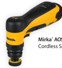
Mirka® AOS-B 130NV Cordless Sander, 1.25"