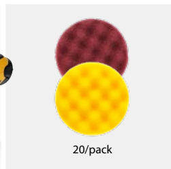
Polishing Foam Pad: Yellow, Burgundy