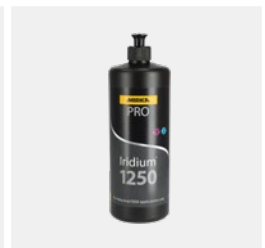
PRO Iridium™ 1250 polishing compound