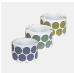
Iridium™ SR 3, SR 5 and Iridium™ SR 7 abrasives