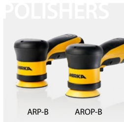
Mirka® ARP-B 300NV and Mirka® AROP-B 312NV