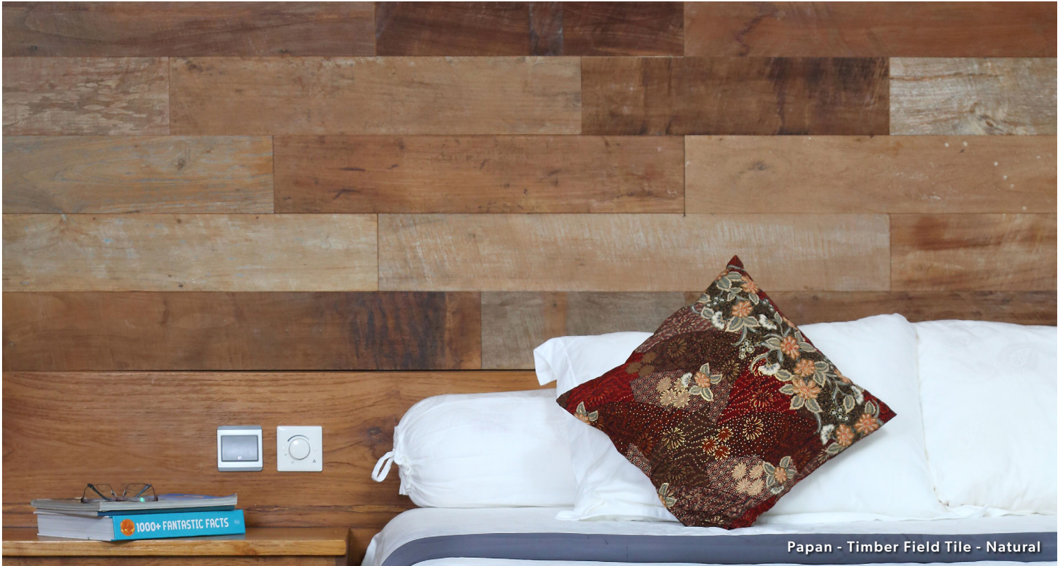
Papan - Timber Field Tile - Natural