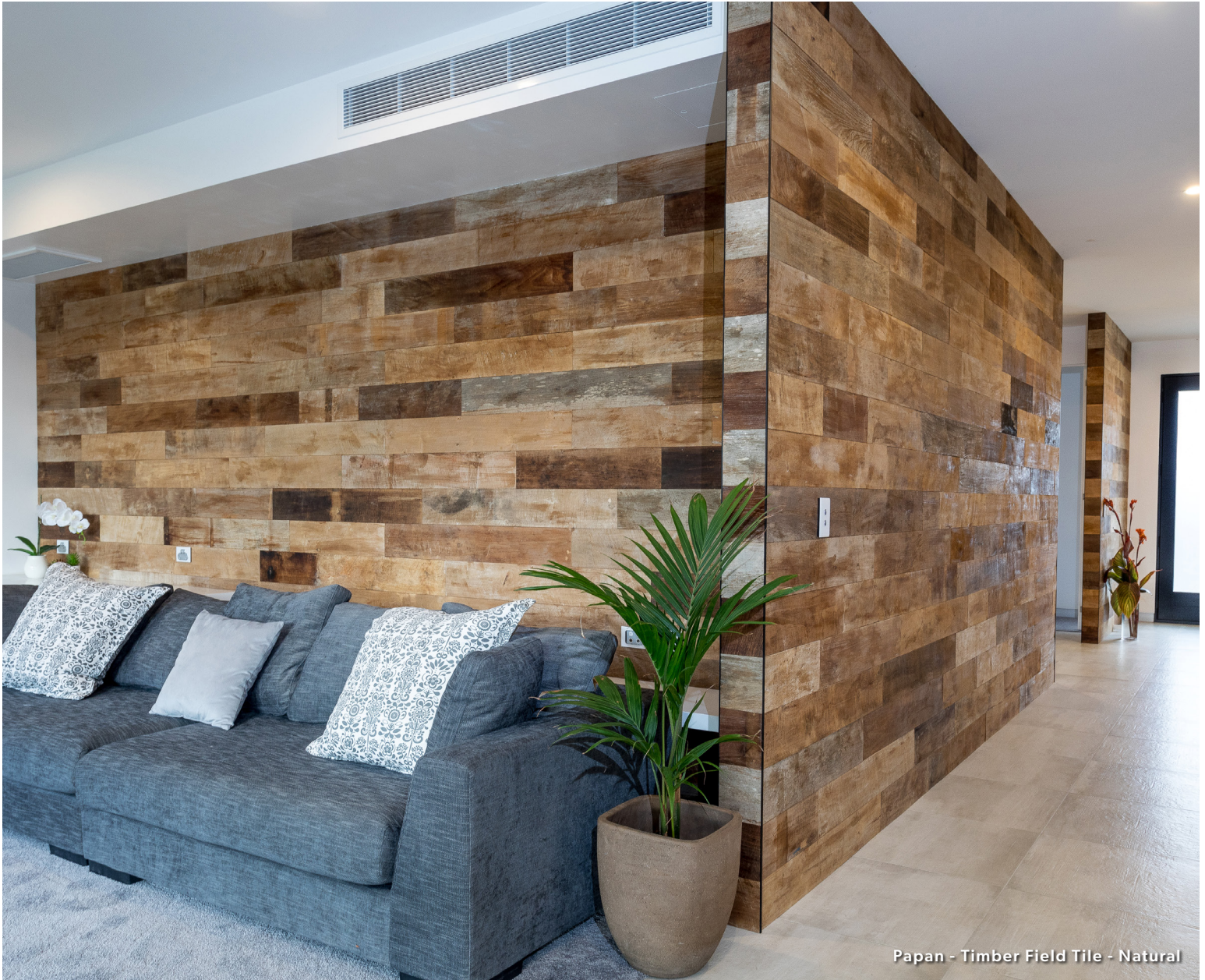
Papan - Timber Field Tile - Natural