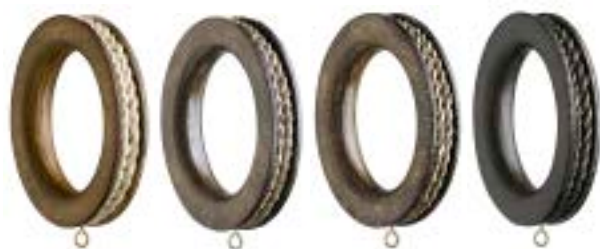
Rope Ring HDW20440 Sisal-16, Flax-106, Burnished Metal-1068, Metallic Mica-81