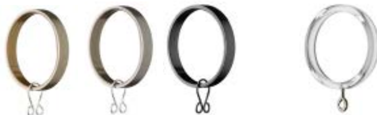
Aluminum Ring HDW20460 Bronze-46, Titanium-11, Graphite-8