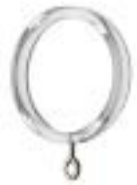
Deco Ring HDW20472-01