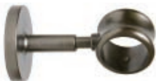
Metal Bracket *HDW20338