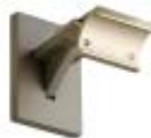
Single Bracket HDW20458