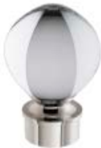
HDW20410-11 Polished Nickel