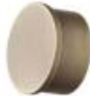
HDW20412-44 Antique Brass