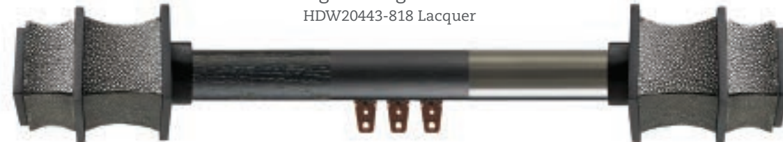
Shagreen Pagoda Finial HDW20443-818 Lacquer