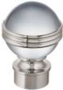
HDW20409-11 Polished Nickel