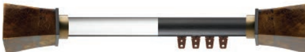
Hawkbill Wedge HDW20449-646 Tortoise