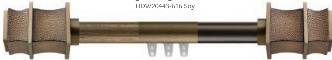
Shagreen Pagoda Finial HDW20443-616 Soy