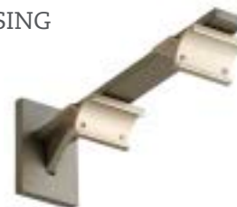
Double Bracket HDW20459

*Wall projection is 3.5"-3.75", order extender HDW20340 to increase the projection to 4.75"-5".