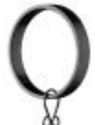
Aluminum Ring HDW20460-8

Due to the natural materials used, slight variations in color may occur from piece to piece. Suggested Pole finishes are listed with each finial above. The Wood and Metal Poles 1 3/8" dia. (not shown) can also be used. For all options and ordering information on Poles, Rings, and Brackets available refer to pages 14-15 or price list. Photography is, at best, a representation of color. Actual finishes may vary slightly.