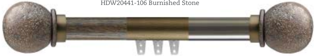
Stone Ball Finial HDW20441-106 Burnished Stone