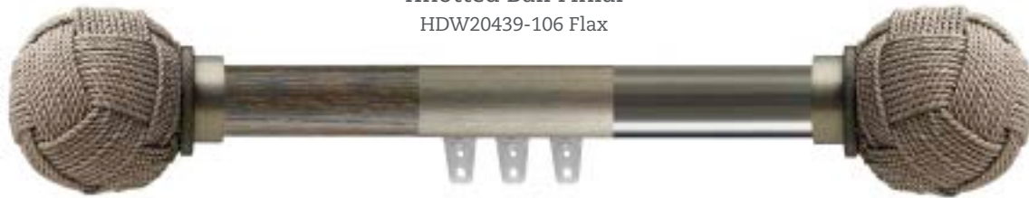
Knotted Ball Finial HDW20439-106 Flax