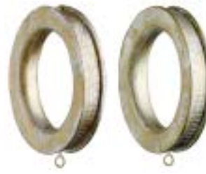
Stardom Ring HDW20446 Gold Dust-4, Dusted Silver-11