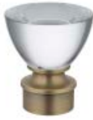
HDW20411-44 Antique Brass