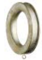
Stardom Ring HDW20446-11