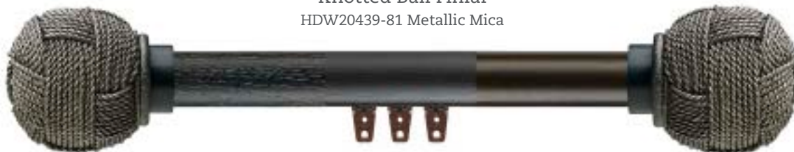
Knotted Ball Finial HDW20439-81 Metallic Mica