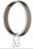
Aluminum Ring HDW20460-11