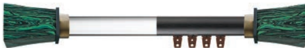
Exotica Wedge HDW20448-358 Malachite