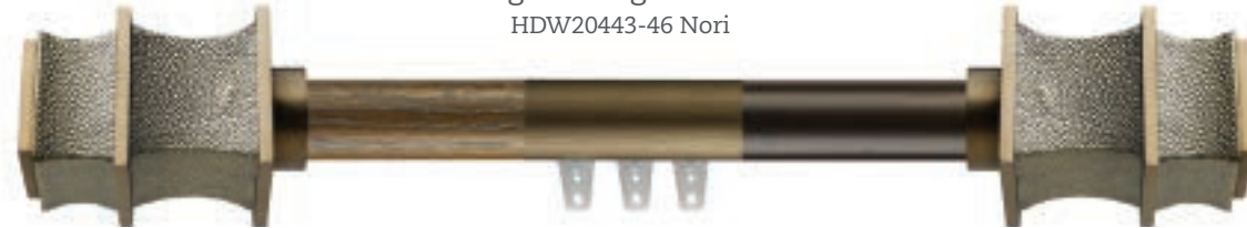
Shagreen Pagoda Finial HDW20443-46 Nori