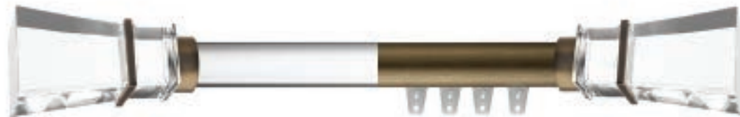
Deco Wedge HDW20447-01 Clear