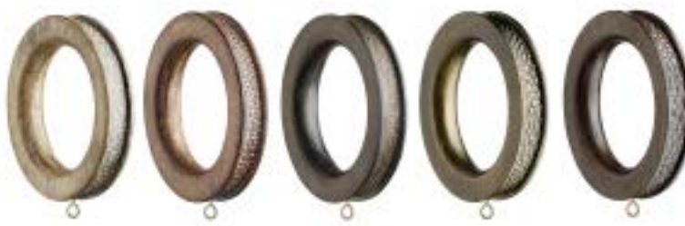
Shagreen Ring HDW20444 Miso-16, Soy-616, Ming-811, Nori-46, Lacquer-818