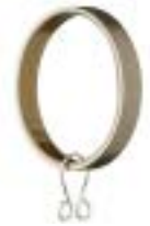
Aluminum Ring HDW20460-46