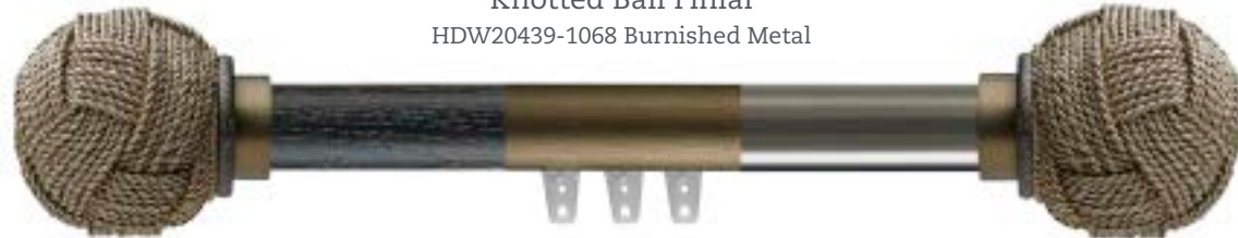
Knotted Ball Finial HDW20439-1068 Burnished Metal