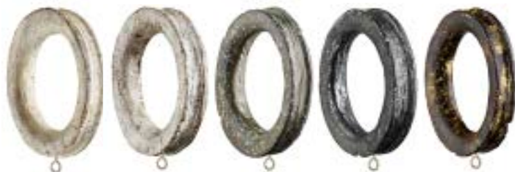
Stone Ring HDW20442 Boulder-16, Concrete-811, Burnished Stone-106, Lava-818, Lava Glow-84