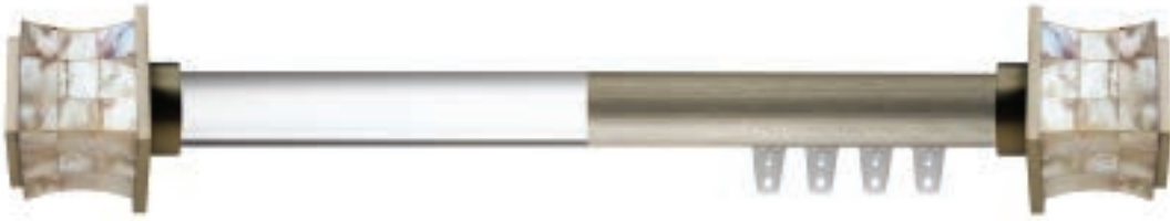
Islandia HDW20450-1 Pearl