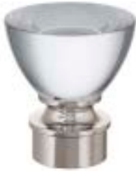
HDW20411-11 Polished Nickel