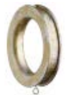
Stardom Ring HDW20446-4