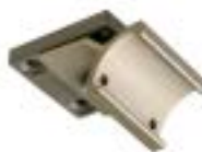
Ceiling Mount HDW20457