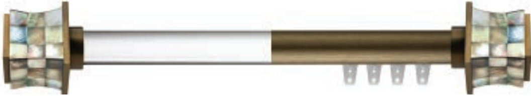
Islandia HDW20450-135 Tahitian