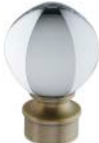
HDW20410-44 Antique Brass