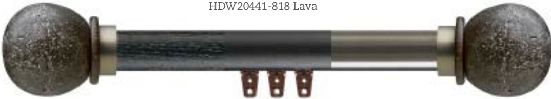
Stone Ball Finial HDW20441-818 Lava