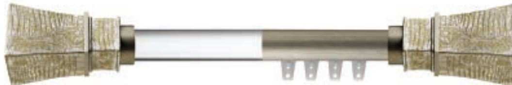
Stardom HDW20445-11 Dusted Silver