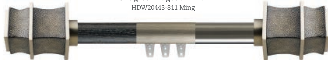
Shagreen Pagoda Finial HDW20443-811 Ming