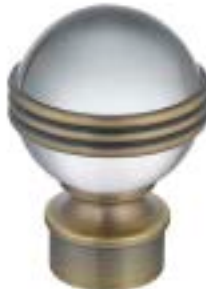
HDW20409-44 Antique Brass