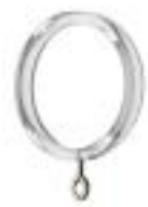
Deco Ring HDW20472-01