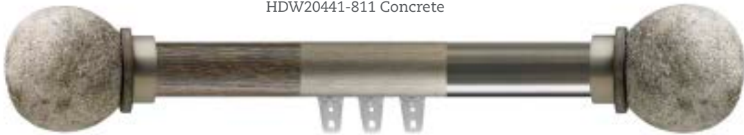
Stone Ball Finial HDW20441-811 Concrete