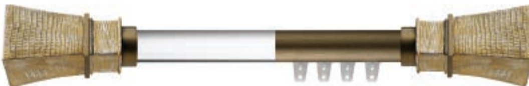
Stardom HDW20445-4 Gold Dust