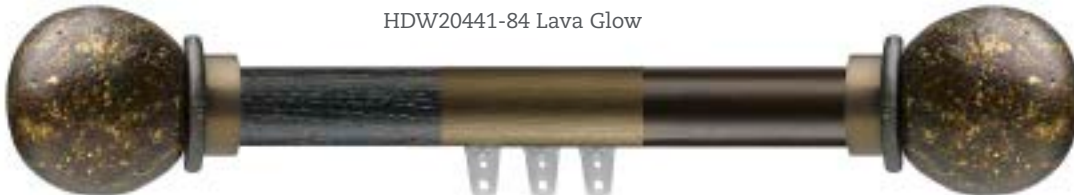
Stone Ball Finial HDW20441-84 Lava Glow