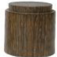
Wood Endcap for 1 3/4" pole HDW20319