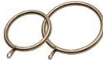
Metal Ring (Small) HDW20333