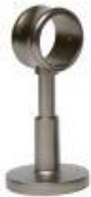
Standard Bracket for 1" pole HDW20337