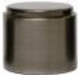
Metal Endcap for 1 3/8" pole HDW20318