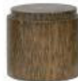
Wood Endcap for 1 3/8" pole HDW20317