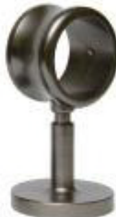
Standard Bracket for 1 3/4" pole HDW20339