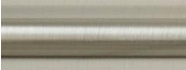
Brushed Nickel- 106