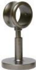
Standard Bracket for 1 3/8" pole HDW20338