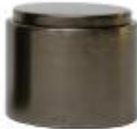
Metal Endcap for 1 3/4" pole HDW20320