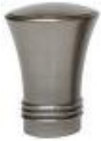
Metal Trumpet Finial for 1" pole HDW20303