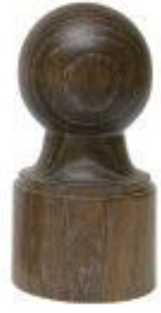
Wood Ball Finial for 1 3/4" pole HDW20313