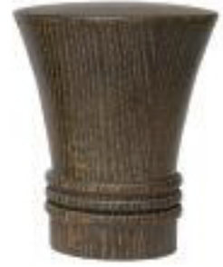
Wood Trumpet Finial for 1 3/4" pole HDW20307