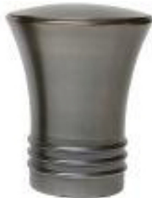
Metal Trumpet Finial for 1 3/4" pole HDW20308