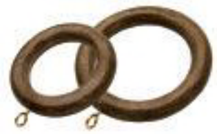
Wood Ring (Small) HDW20335