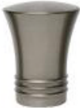
Metal Trumpet Finial for 1 3/8" pole HDW20306