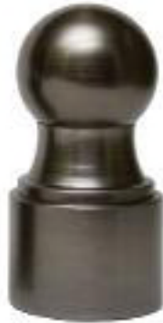
Metal Ball Finial for 1 3/4" pole HDW20314