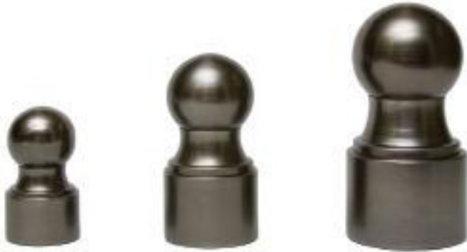
Metal Ball Finial for 1" pole HDW20310