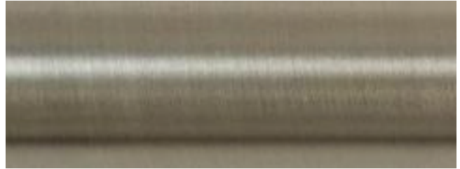
Antique Pewter- 118