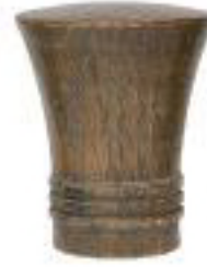
Wood Trumpet Finial for 1 3/8" pole HDW20305