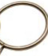
Metal Ring (Large) HDW20334