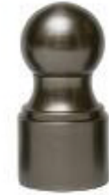
Metal Ball Finial for 1 3/8" pole HDW20312