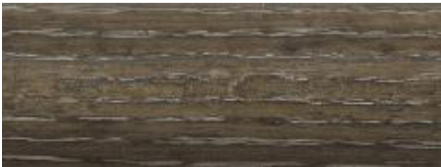
French Grey- 106