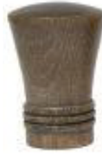
Wood Trumpet Finial for 1" pole HDW20304