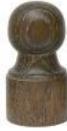
Wood Ball Finial for 1 3/8" pole HDW20311