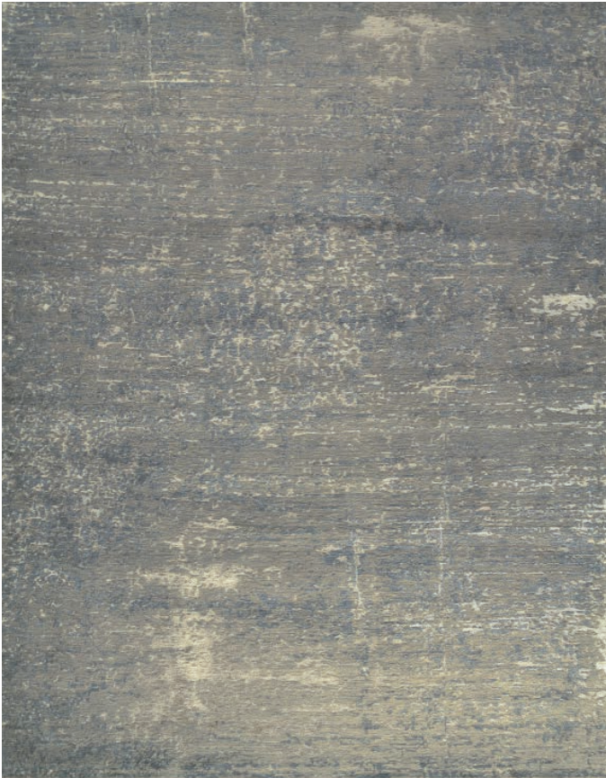
Glaze - Mica