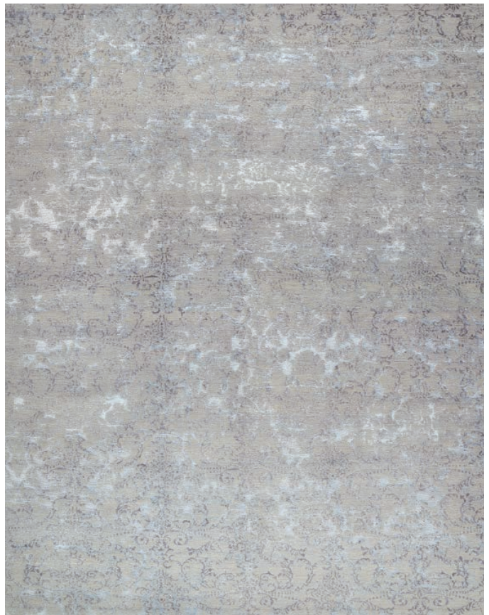
Soft Whisper - Platinum