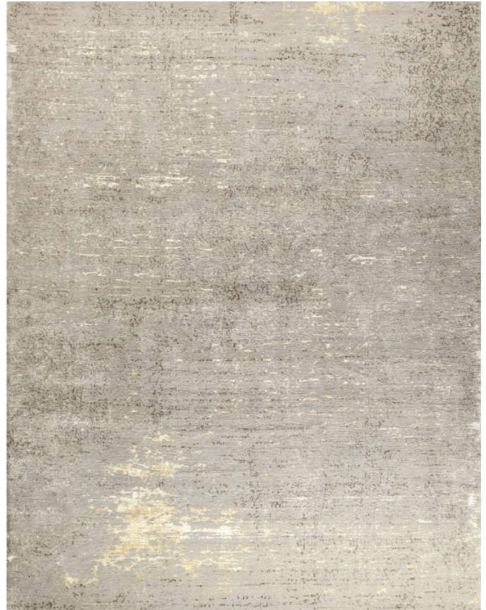
Glaze - Quartz