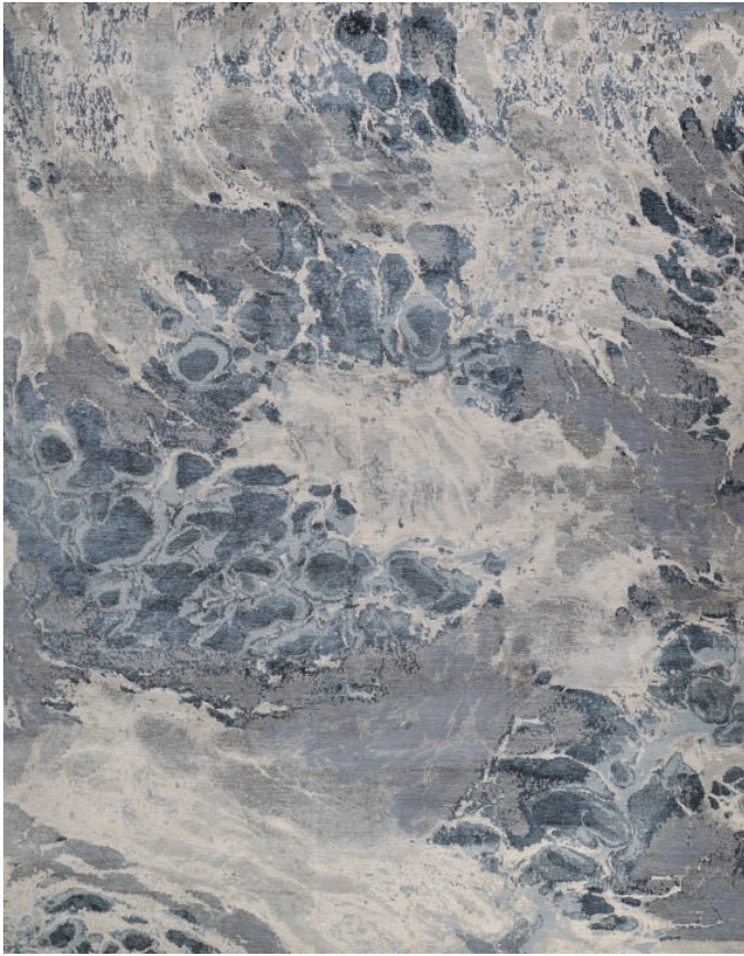
Splashback - Blue Granite