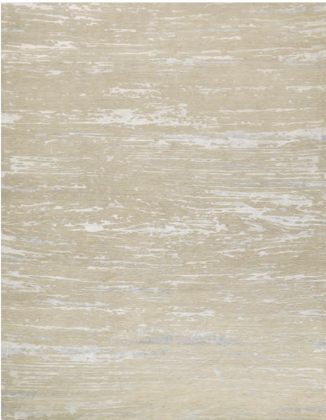
Ravine - Limestone