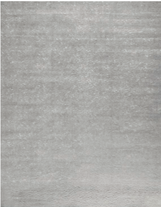
Water Ripple - Platinum