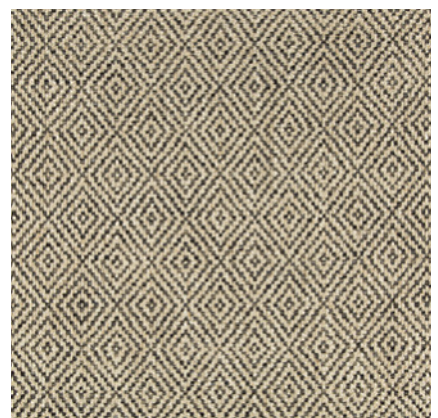
Izu - Slate