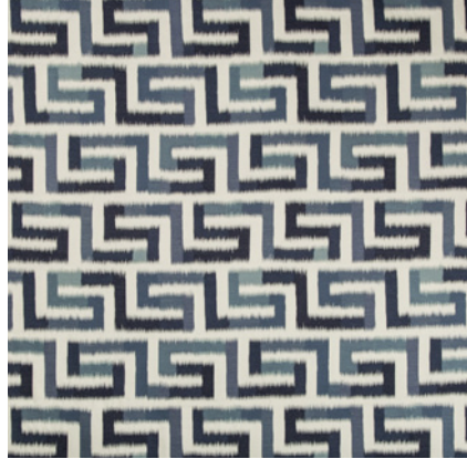
Tensho - Ink