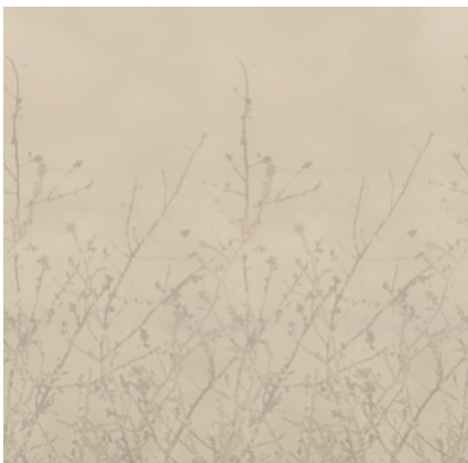
Matsue - Greige