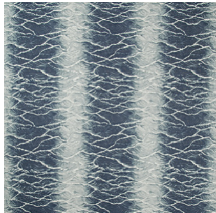
Onsen - Indigo