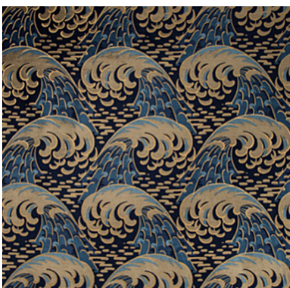
Kaiyou - Indigo