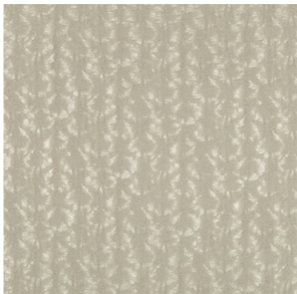
Shiruku - Platinum