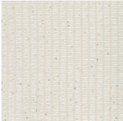
Leno Shine - Ivory