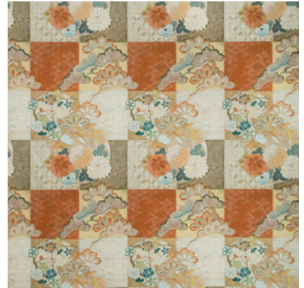
Osode - Clay