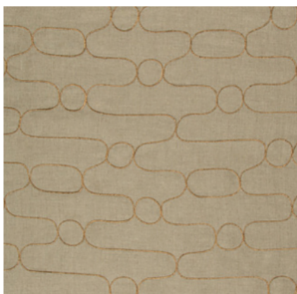
Tottori - Gilded