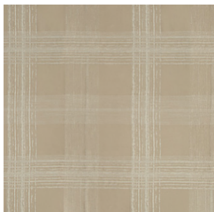
Refined Lines - Natural