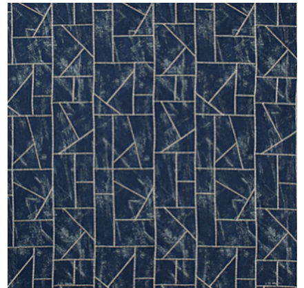
Bamboo Stitch - Indigo