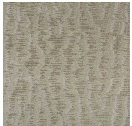
Yoshino - Smoke