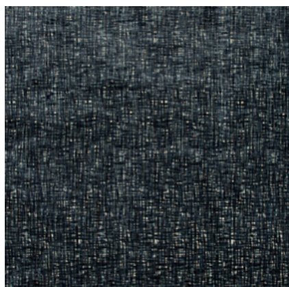
New Ideas - Ink