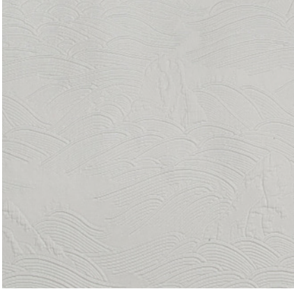
Hokkaido - Blanc