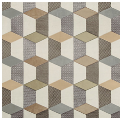
Boroboro - Quartz