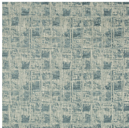
Sumi - Reef