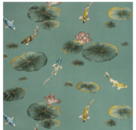
Lotus Pond - Sage