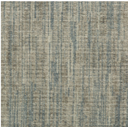
Now and Zen - Seaglass