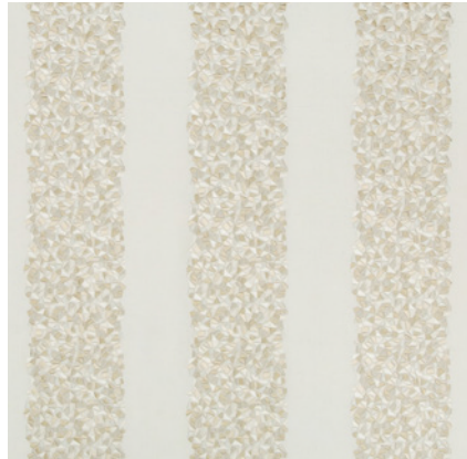
Sagano - Alabaster