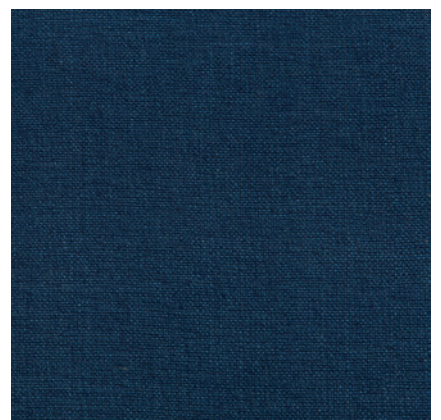
Garden Silk - Royal