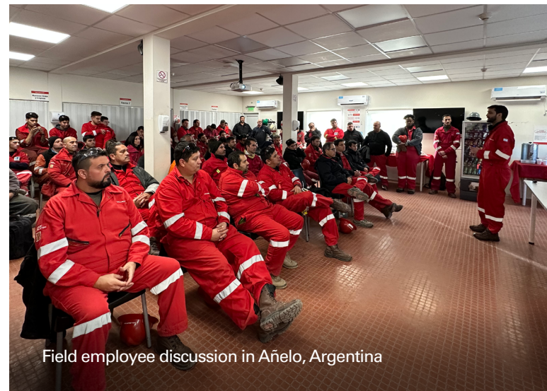
Field employee discussion in Añelo, Argentina