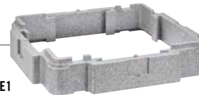
EPPMFE1 10 cm Extender.