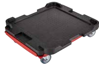
EPPMFBBPKG EPP Adapter with CD4060 Dolly.