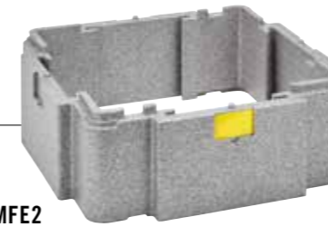
EPPMFE2 20 cm Extender.