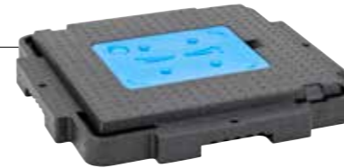
EPPMFBL Lid is designed with integrated space for optional Camchiller® (cold plate) or Camwarmer® (hot plate).

Designed with ergonomic features to allow easy loading and unloading with interior wall recesses. A custom transport accessory that ensures easy delivery anywhere.