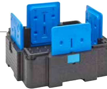
EPPMFBB Base features unique design slots for optional Camchiller® or Camwarmer® to extend cold or hot holding time.