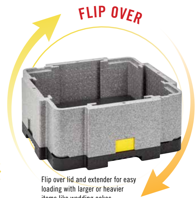
Flip over lid and extender for easy loading with larger or heavier items like wedding cakes.