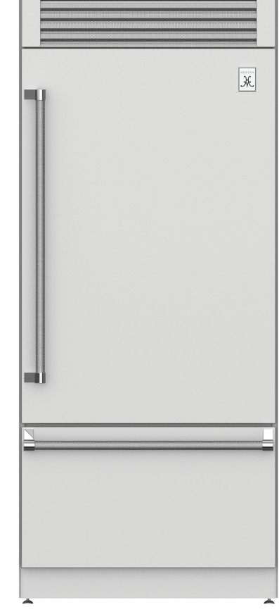
Model as shown KRPR36