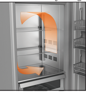
Adjustable Shelf System