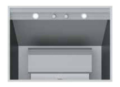
36" Liner Hood Also in 30", 42", 48" and 54" widths

Cooking tends to leave behind a joyous mess. Hestan happily (and silently) handles it. Hestan hoods clear the air of even the most intense cooking odors with best-in-class ventilation while safely collecting 70% more grease than most competitors. The dishwasher cleans everything from stock pots to stemware quietly, carefully and thoroughly with its patented Double Axial Washing System<sup>™</sup>. Then the automatic door pops open to maximize airflow and conserve energy for spot-free drying. It's the next best thing to a magic wand.