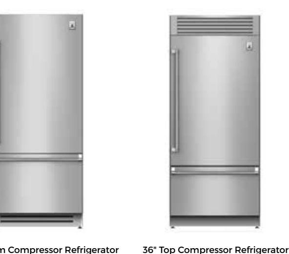
36" Bottom Compressor Refrigerator

Hestan refrigeration works smarter and looks brilliant. Refrigerators and freezers silently and diligently preserve your food and ingredients. A feat of mechanical engineering delivers extra storage depth within standard cabinet depths. Refrigerator and wine cellar bottom drawers offer three independent temperatures zones ranging from fresh food to deep freeze. Wine cellars and wine refrigerators preserve your favorite vintages at the perfect temperature while keeping them safe from light and vibration, if not toast-happy guests. And undercounter refrigeration options, including a beer dispenser, ensure refreshments are always ready wherever the party congregates.