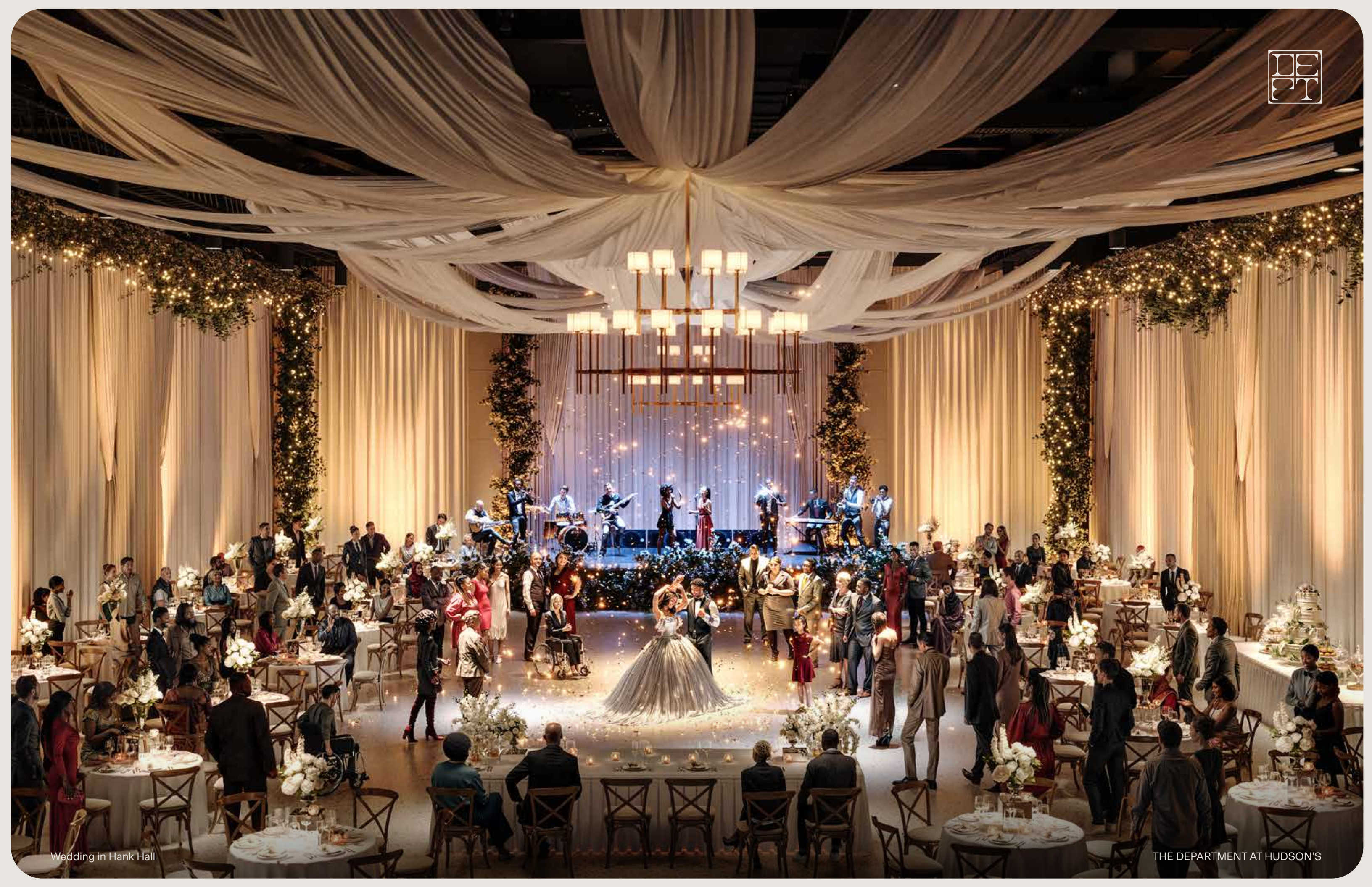
Wedding in Hank Hall