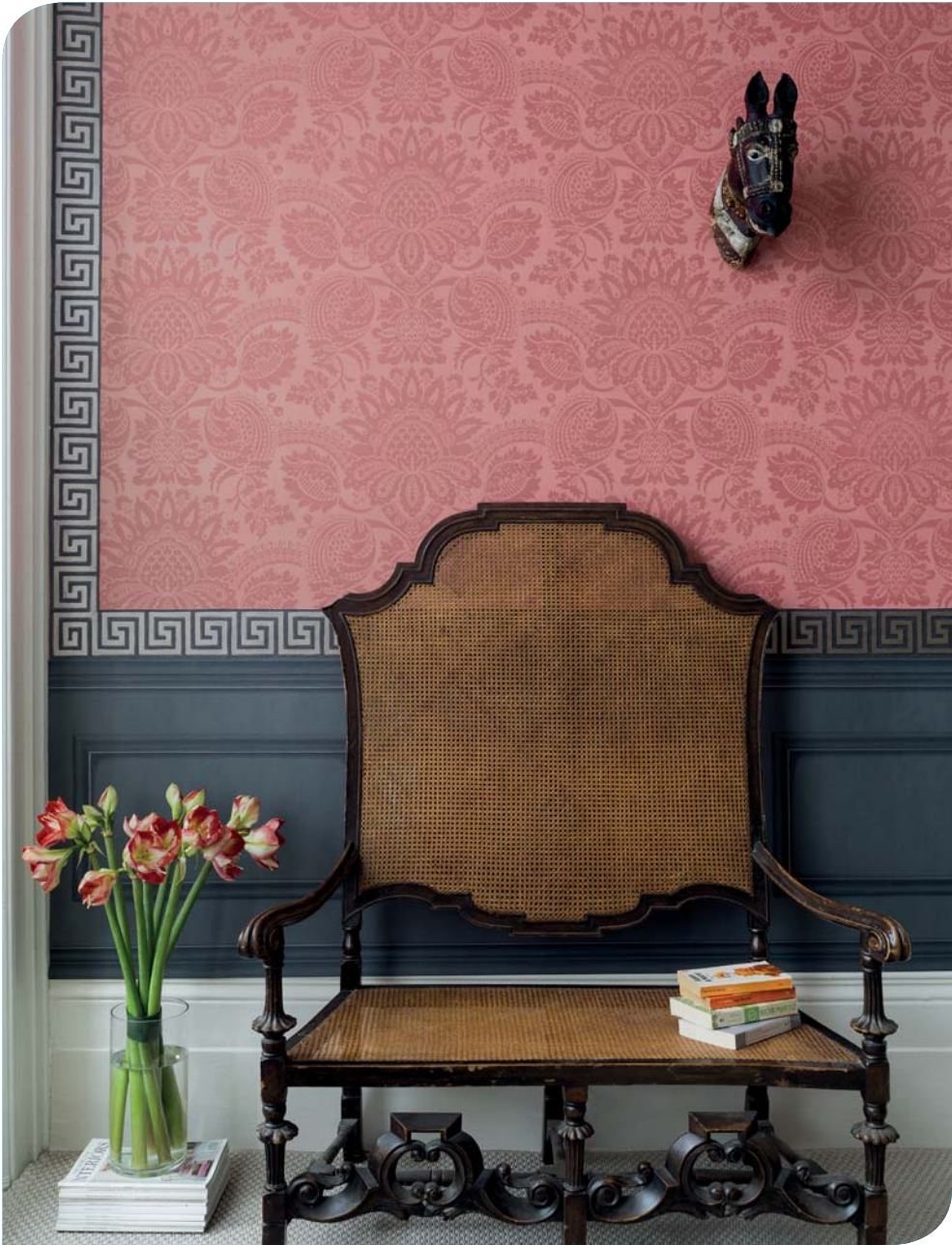
Dukes Damask 98/2011, Library Frieze 98/8038 & Queens Key Border 98/9043

Presented in seven appealing and accessible colourways, Dukes Damask takes its inspiration from the luxurious silk clad walls of both Kensington Palace and Hampton Court Palace. The colour palette represents shades which can be found on the walls and within the textiles of all of the palaces, including stone greys and neutrals, rich yellow, duck egg, old olive and rose.