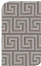
98/5022 Dark Linen & Silver