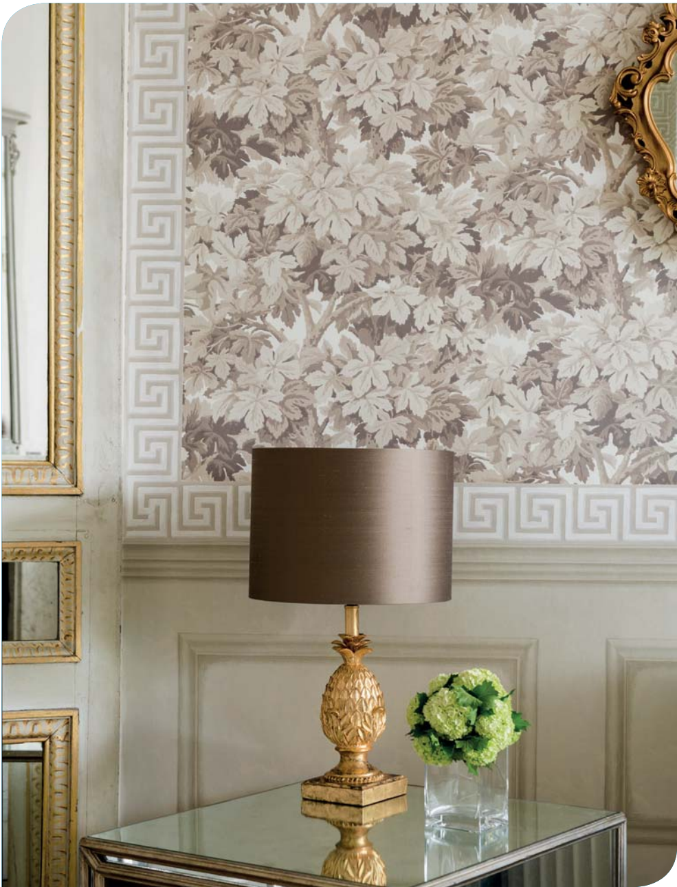
Great Vine 98/10047, Library Frieze 98/8034 & Queens Key Border 98/9040

A wonderfully abundant and verdant design of interwoven vine leaves introduces us to the Great Vine of Hampton Court Palace. At 229 years old and over 36 metres long the Great Vine is possibly the oldest and largest vine in the world. This wallpaper in its shady hues of leaf green, olive, aqua and stone creates a leafy world within a world.