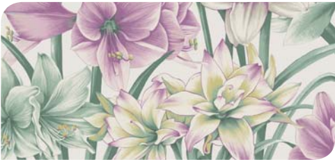
98/6024 Green & Purple