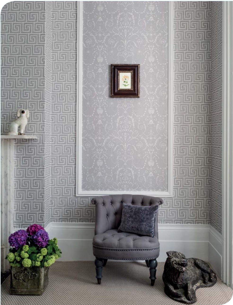
Regalia 98/12050 & Queens Key 98/5018

Inspired by the Crown Jewels housed at the Tower of London, this graceful design represents a more delicate aspect of decoration within the historic royal palaces. Cleverly incorporating important motifs from the royal regalia, this elegant wallpaper has been produced in four tasteful colourings of dove grey, stone, duck egg and soft olive.