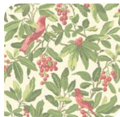
98/1002 Olive & Pink