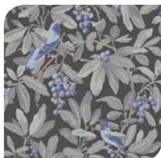
98/1004 Midnight & Blue