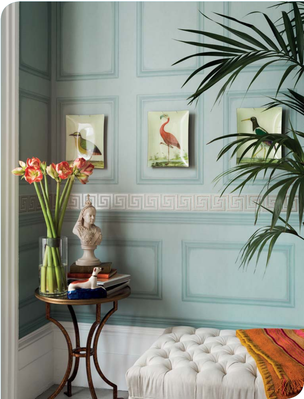
Library Panel 98/7028 , Library Fireze 98/8035 & Queens Key Border 98/9042

Inspired by the numerous examples of wooden panelling found throughout the palaces, this timeless feature of interior decoration has been skilfully translated into an elegant wallpaper and frieze. Library Panel, structured as a portrait orientated tile, is presented in seven smart hues ranging from duck egg and stone to charcoal, dark linen and olive.