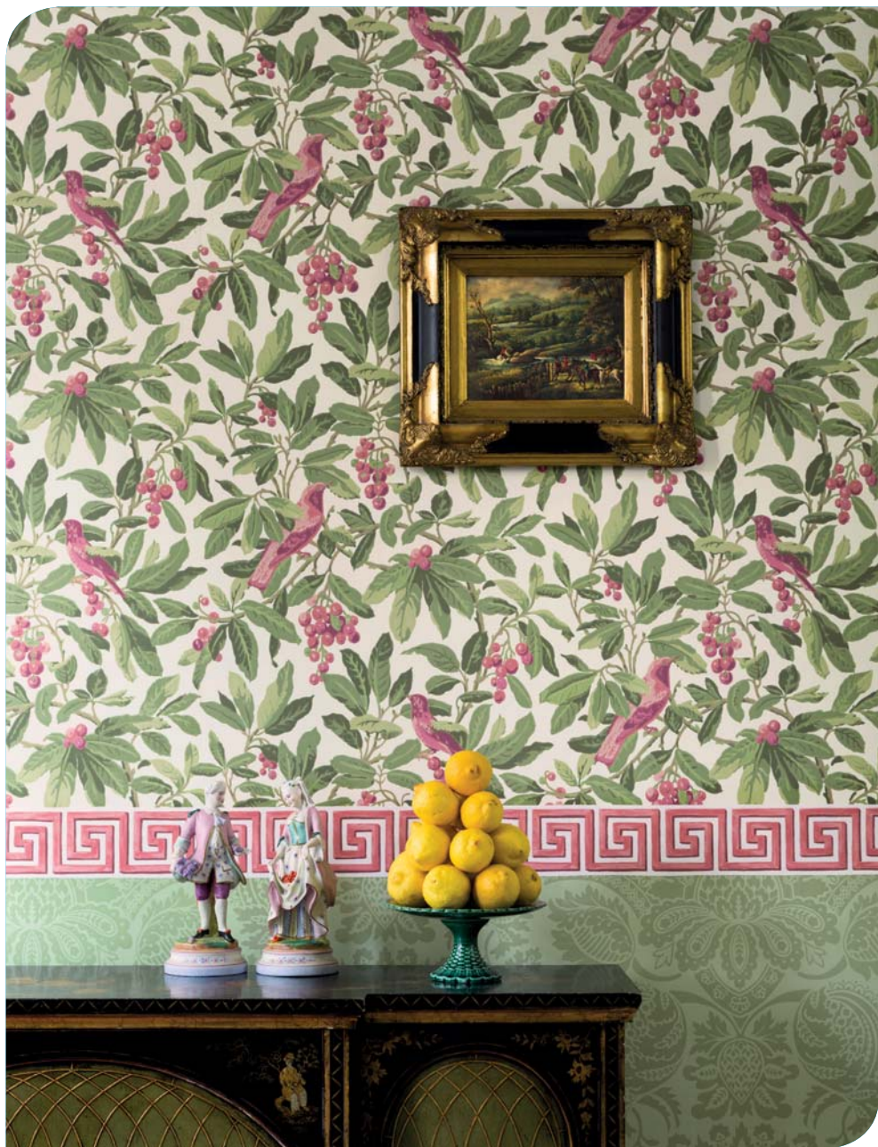
Royal Garden 98/1002, Queens Key Border 98/9041 & Dukes Damask 98/2009