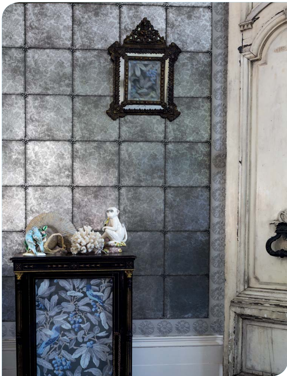
Kings Mirror 98/13054 & Tudor Rose Border 98/4016