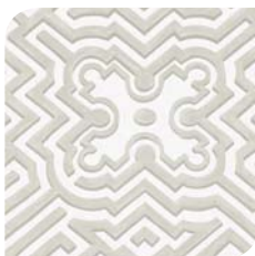
98/14058 Stone & White