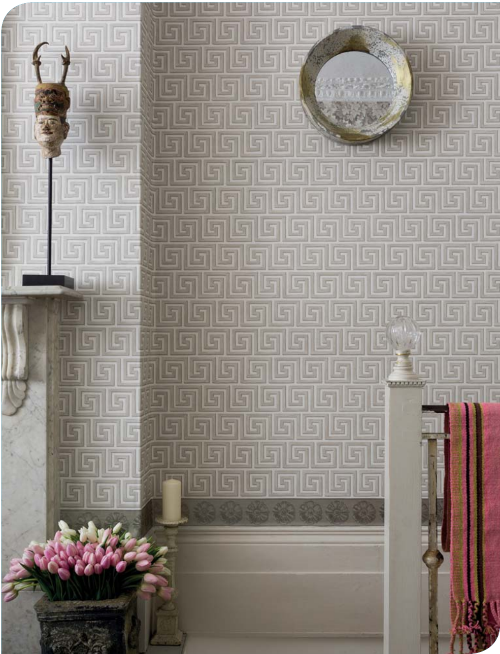
Queens Key 98/5017 & Tudor Rose Border 98/4016

A smart geometric pattern, softened by the use of a painterly brush-marked style. Inspired by the Greek Key decorative pattern as seen in the Presence Chamber at Kensington Palace and Queen Charlotte's Boudoir at Kew Palace, we have recreated it here as an all over wallpaper in two distinct styles; three soft watercolour shades of olive, stone and grey on neutral grounds contrasting with three sharper metallic golds, silvers and pewters on grounds of linen and dove.