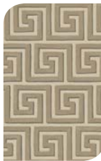
98/5021 Linen & Gold