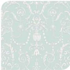
98/12052 Duck Egg