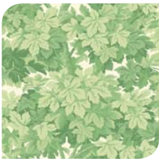
98/10045 Leaf Green

Sold on a 52cm wide 10 metre roll with a half drop repeat.