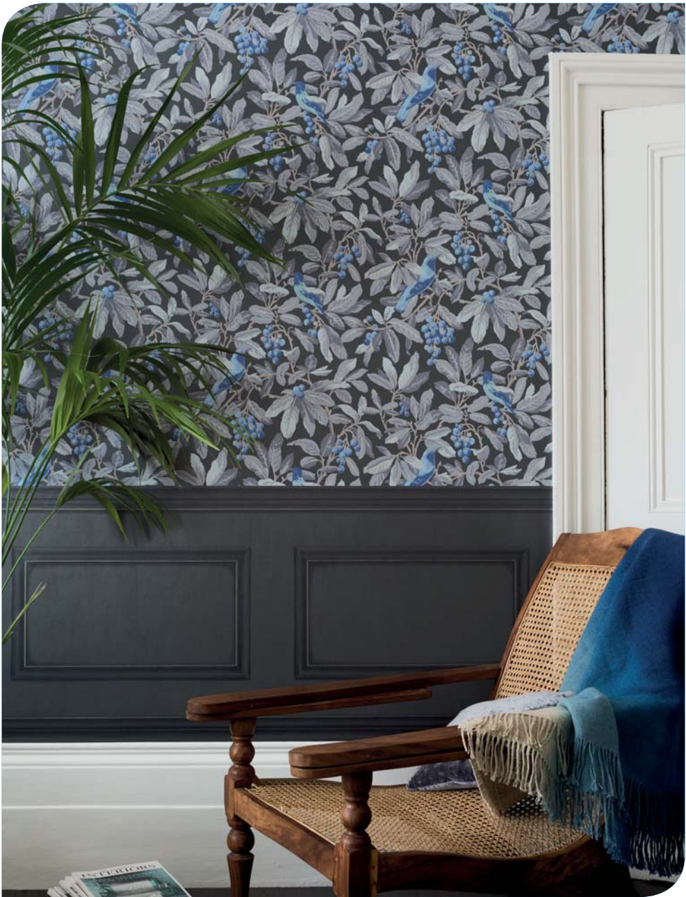
Library Frieze 98/8038 & Royal Garden 98/1004

This wide width panel design continues the exciting trend for horizontal wallpapers. Designed and presented in seven colourways to coordinate directly with the Library Panel, it can be hung below dado height to produce a truly stunning effect. This frieze has also been coloured to complement many other papers in the collection.