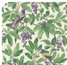
98/1001 Green & Purple

Sold on a 52cm wide 10 metre roll with a half drop repeat.