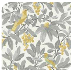
98/1003 Grey & Yellow