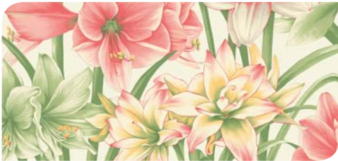
98/6023 Green & Pink

Sold on a 52cm wide 10 metre roll with a half drop repeat.