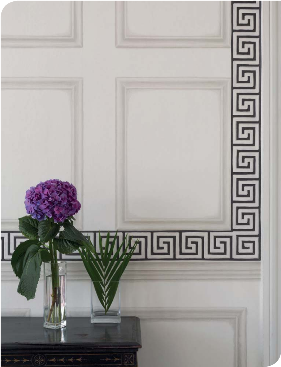
Queens Key Border 98/9039 , Library Frieze 98/8032 & Library Panel 98/7025

Taken directly from the pattern originally found in Queen Charlotte's Boudoir at Kew Palace, this decorative little border can be utilised in a variety of ways to enhance any interior. Presented in six striking colourways varying from graphic black and white, stone and white and pink on ivory to a richer charcoal and bronze and duck egg and gilver; these borders are not intended to coordinate directly with the Queens Key wallpaper; rather they complement several other designs found within this collection. Sold on a 10.6cm wide 10 metre roll.