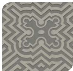
98/14056 Dark Linen & Silver

Considered to be the most famous in the world, the Hampton Court Palace Maze has inspired this wonderfully intricate geometric wallpaper. Using softened brush-marks and a painterly style this design is presented in four colourways, each conveying a different mood – leafy green on ivory, offering a contemporary take on colour; soft stone and white echoing the architectural details within the gardens, black and white for a more striking optical effect and silver on dark linen reflecting the ‘maze by moonlight’. Sold on a 53cm wide 10 metre roll with a half drop repeat.