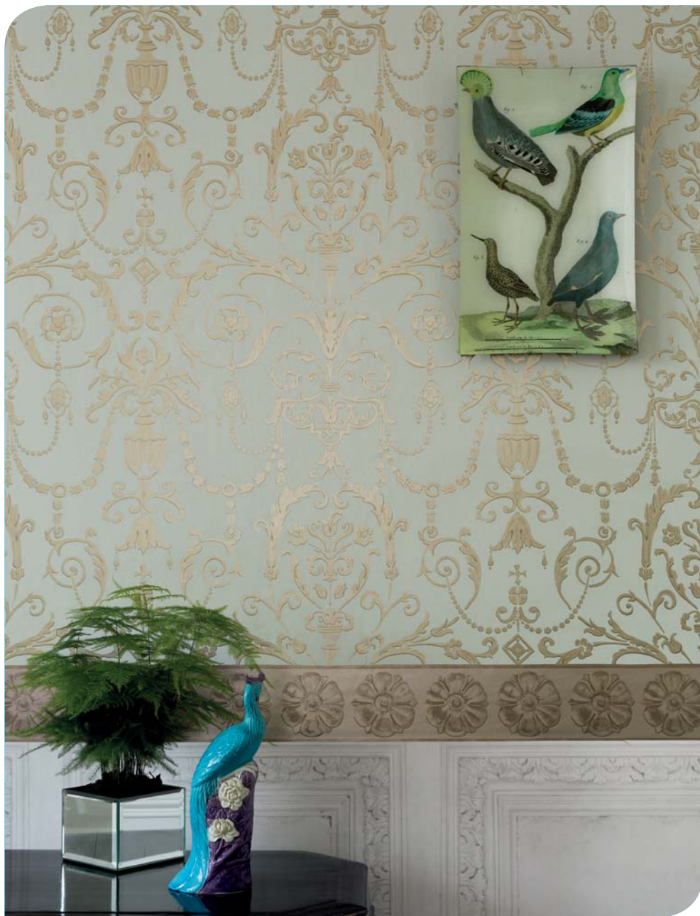
Tudor Rose Border 98/4015 , Regalia 98/12053 & Clock Court 98/3013