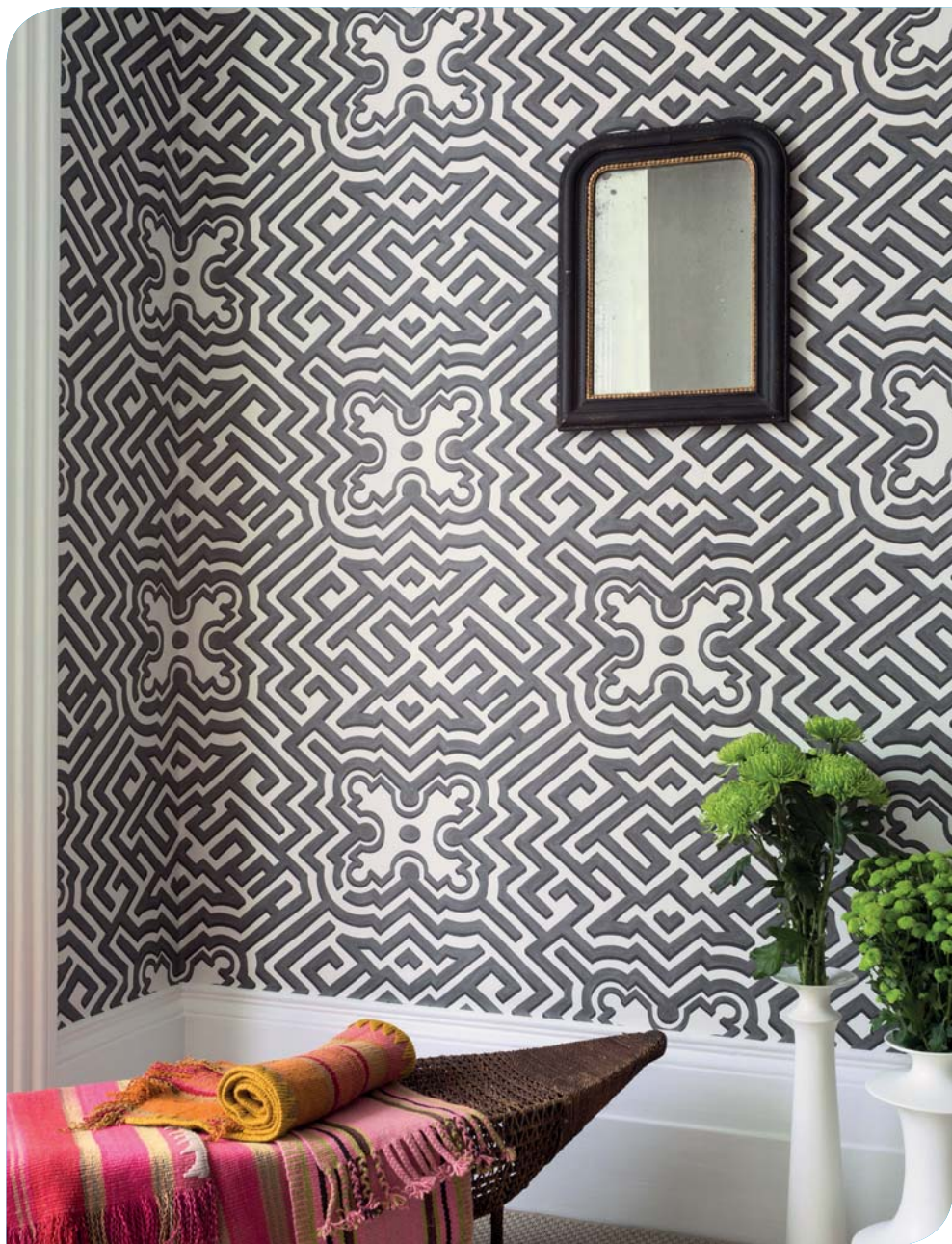
Palace Maze 98/14057