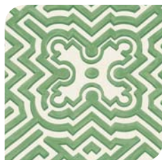
98/14059 Green & Ivory