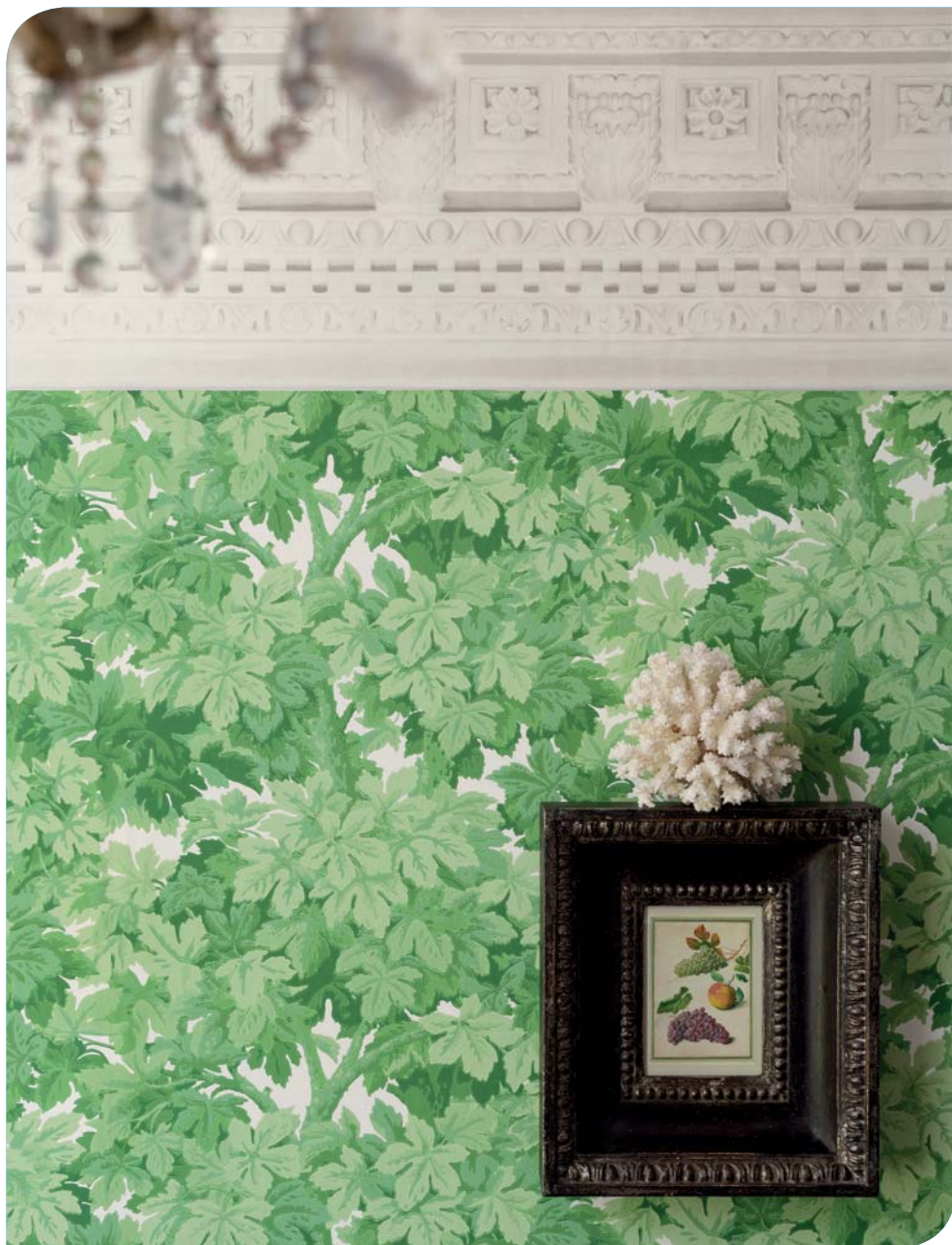
Georgian Border 98/11049 & Great Vine 98/10045