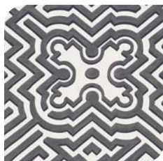
98/14057 Black & White