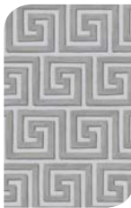
98/5020 Dove & Silver