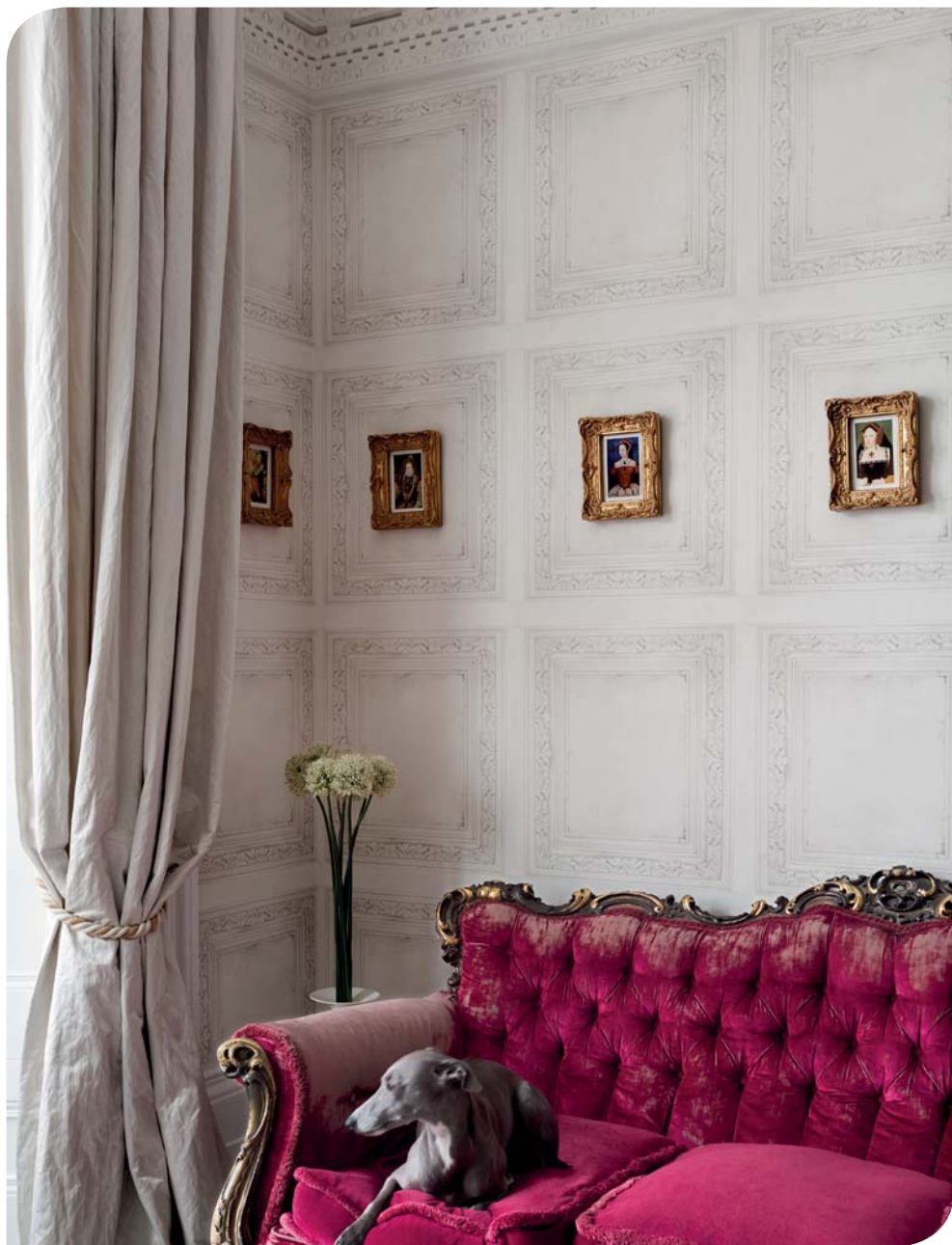
Clock Court 98/3012 & Georgian Border 98/11049