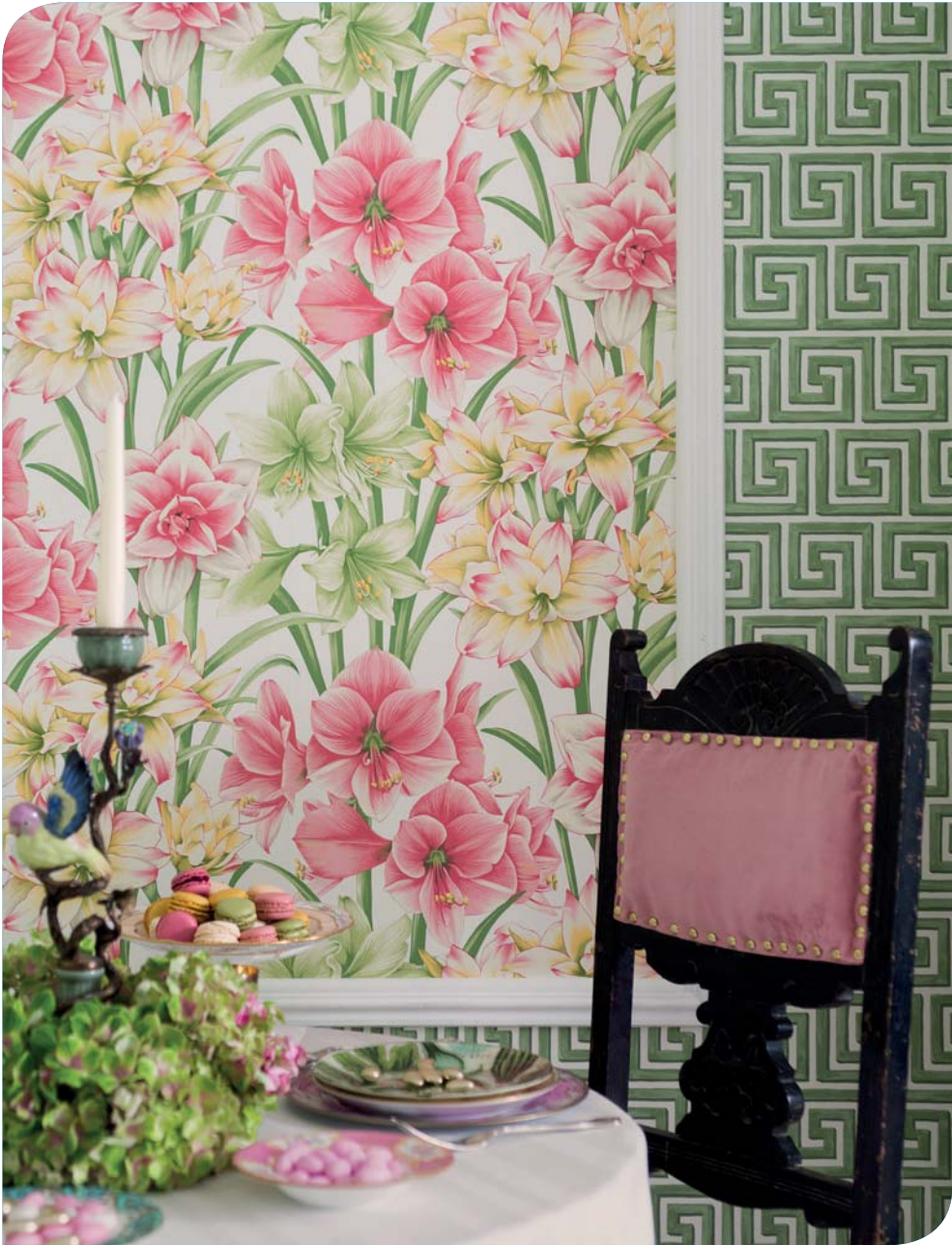
Exoticks 98/6023 & Queens Key 98/5019

Utilising the original spelling, Exoticks refers to Queen Mary II's vast collection of tender exotic plants, housed at Hampton Court Palace, which had become one of the largest private collections in the world. Featuring Amaryllis Belladonna, a native of South Africa, this exuberant and showy wallpaper reveals striking pink, red and green petals amongst verdant greens.