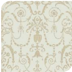
98/12053 Olive & Gold