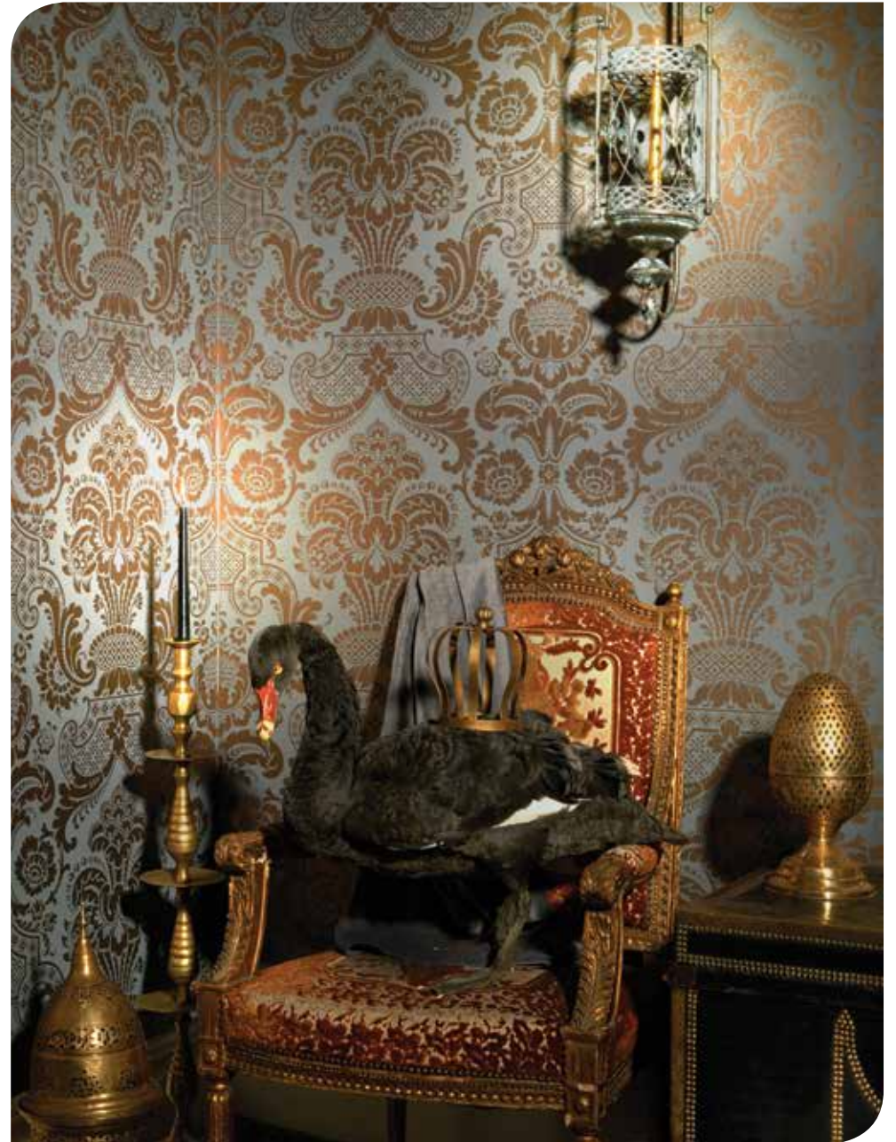
Above: Carmen 108/2010