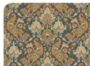
108/8042 Ginger & Charcoal