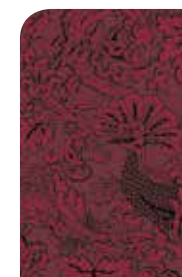
108/1004 Velvet Red