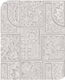
108/9047 Grey & White