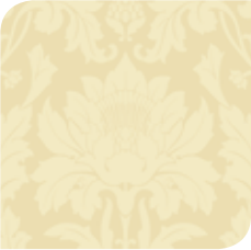
108/7038 Vintage Yellow