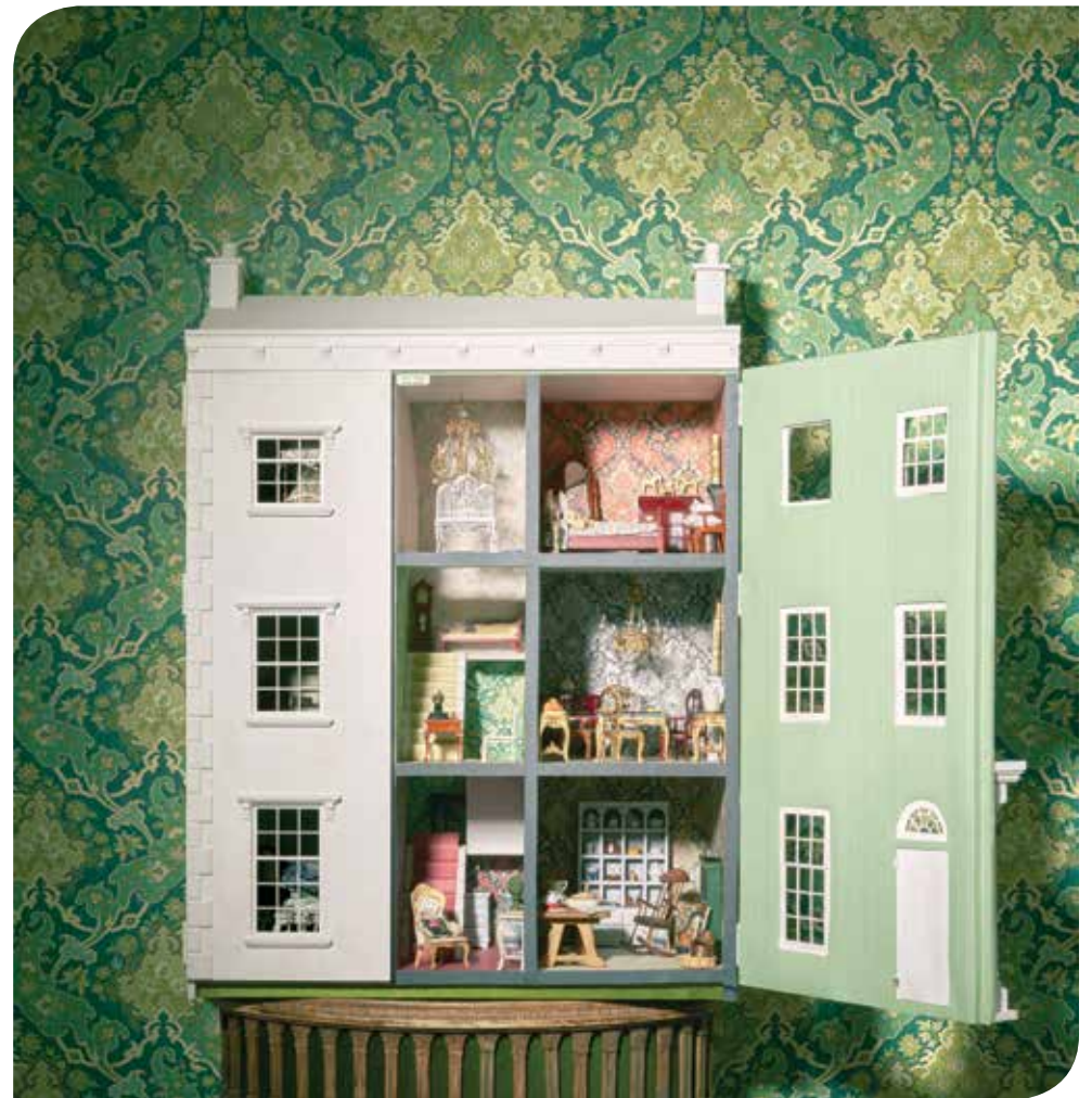
Above: Pushkin 108/8041