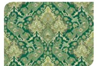
108/8041 Forest Green