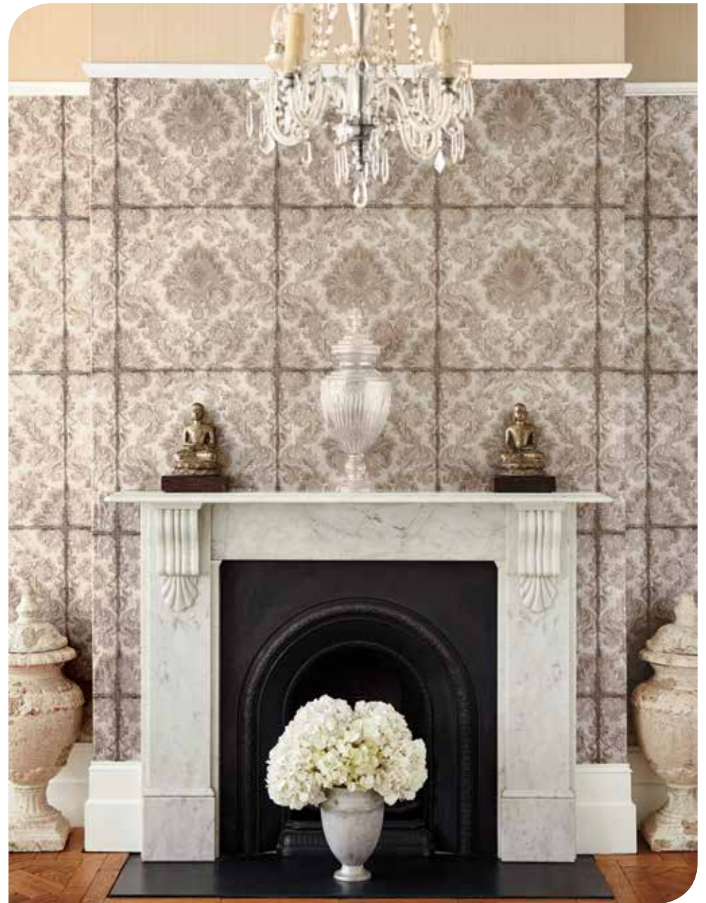
Above: Stravinsky 108/4019