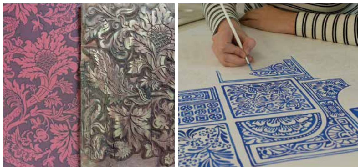
Cole & Son originate new designs by hand in the Design Studio. An original archive block print from 1840, inspired the Balabina design.