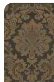
108/4017 Charcoal & Bronze