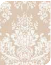
108/5024 Shell Pink