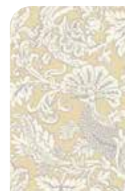
108/1001 Vintage Yellow

Produced on a 52cm wide 10m roll. The pattern repeat measures 101.8cm with a half drop.