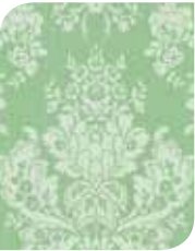
108/5028 Leaf Green