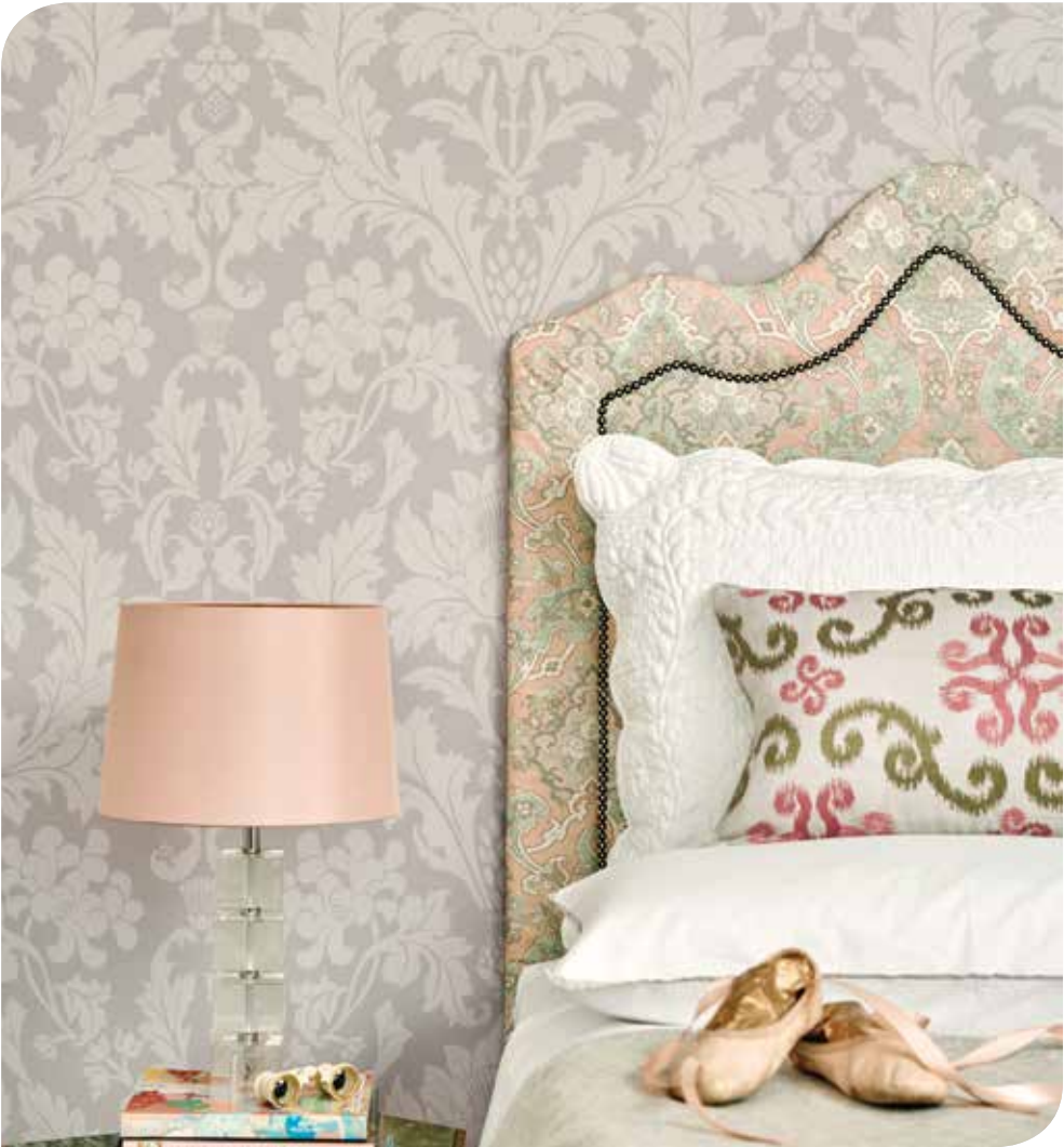
Above: Fonteyn 108/7034

Fonteyn takes its name from our well known prima ballerina, who gained worldwide acclaim with the Royal Ballet. Interwoven trails and sprigs of honeysuckle and milk thistle pirouette across this subtle two-tone design, screen printed to give an especially soft matt appearance. It is presented in seven chalky hues of stone, old olive, parchment, biscuit, pale yellow and petrol.