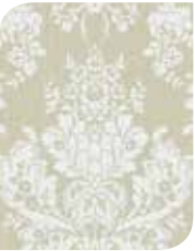
108/5029 Old Olive