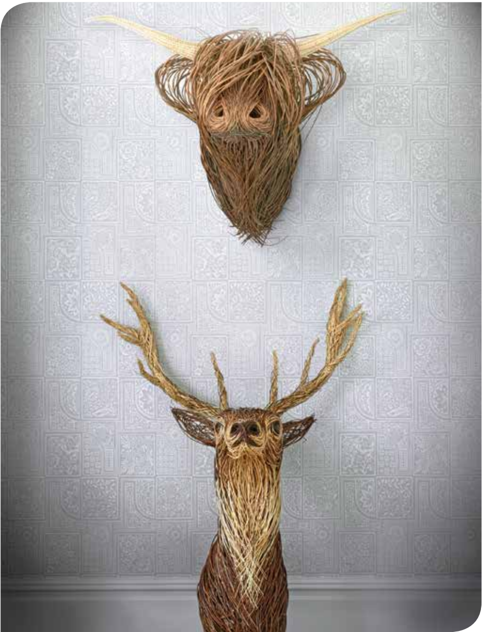
Above: Bellini 108/9047

Bellini is a re-working of a Cole & Son surface print design from the 1950s. Featuring a pretty water-coloured arrangement of tiles containing loosely sketched florals and geometrics, Bellini, named after Vincenzo Bellini the famous Italian composer, is presented in four simple colourings of charcoal and white, china blue on white, white on grey and a subtle gilver on stone.