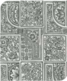
108/9046 Black & White