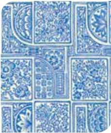
108/9045 Blue & White

Produced on a 52cm wide 10m roll. The pattern repeat measures 70cm with a straight match.