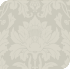
108/7035 Old Olive