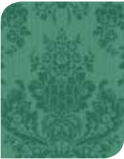
108/5027 Forest Green