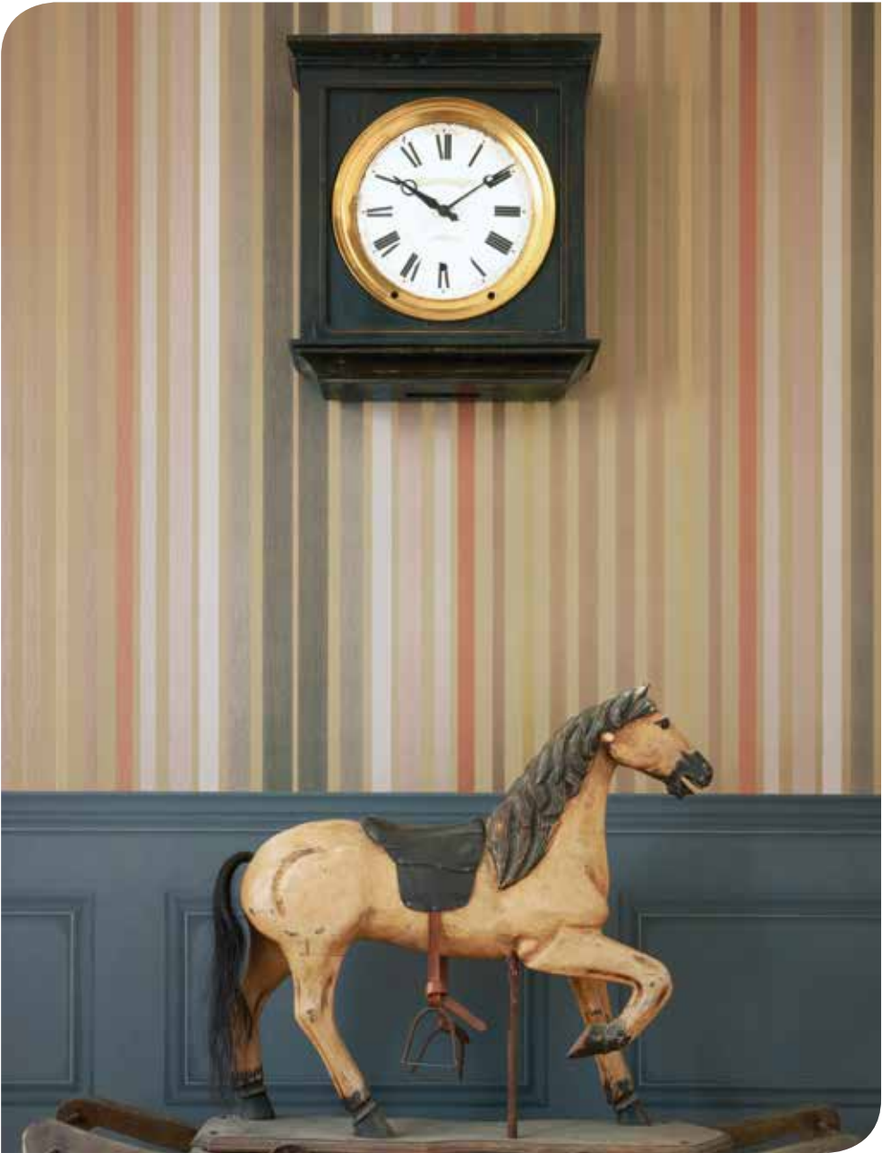
Above: Carousel Stripe 108/6030

Bringing to life another Cole & Son classic archive print, Carousel Stripe has been updated and recreated using innovative modern print techniques in two of the original colourways. Shimmering dragged-brush ribbons of coloured metallics line up to create a wonderfully vibrant and glamorous wallpaper.