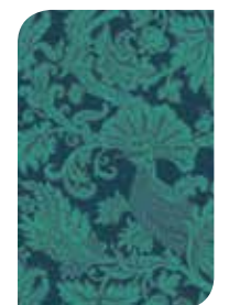
108/1005 Midnight & Jade