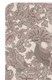
108/1003 Stone & Gilver