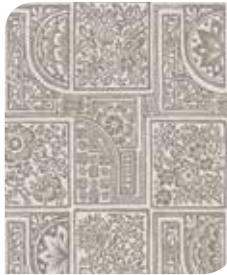
108/9048 Stone & Silver