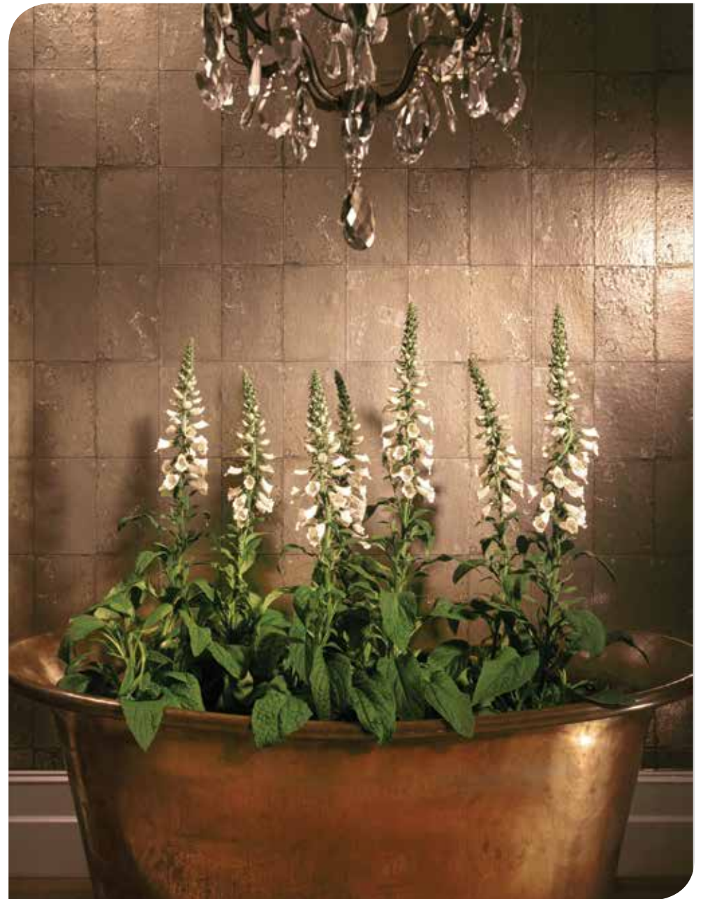
Above: Antique Mirror 92/2010