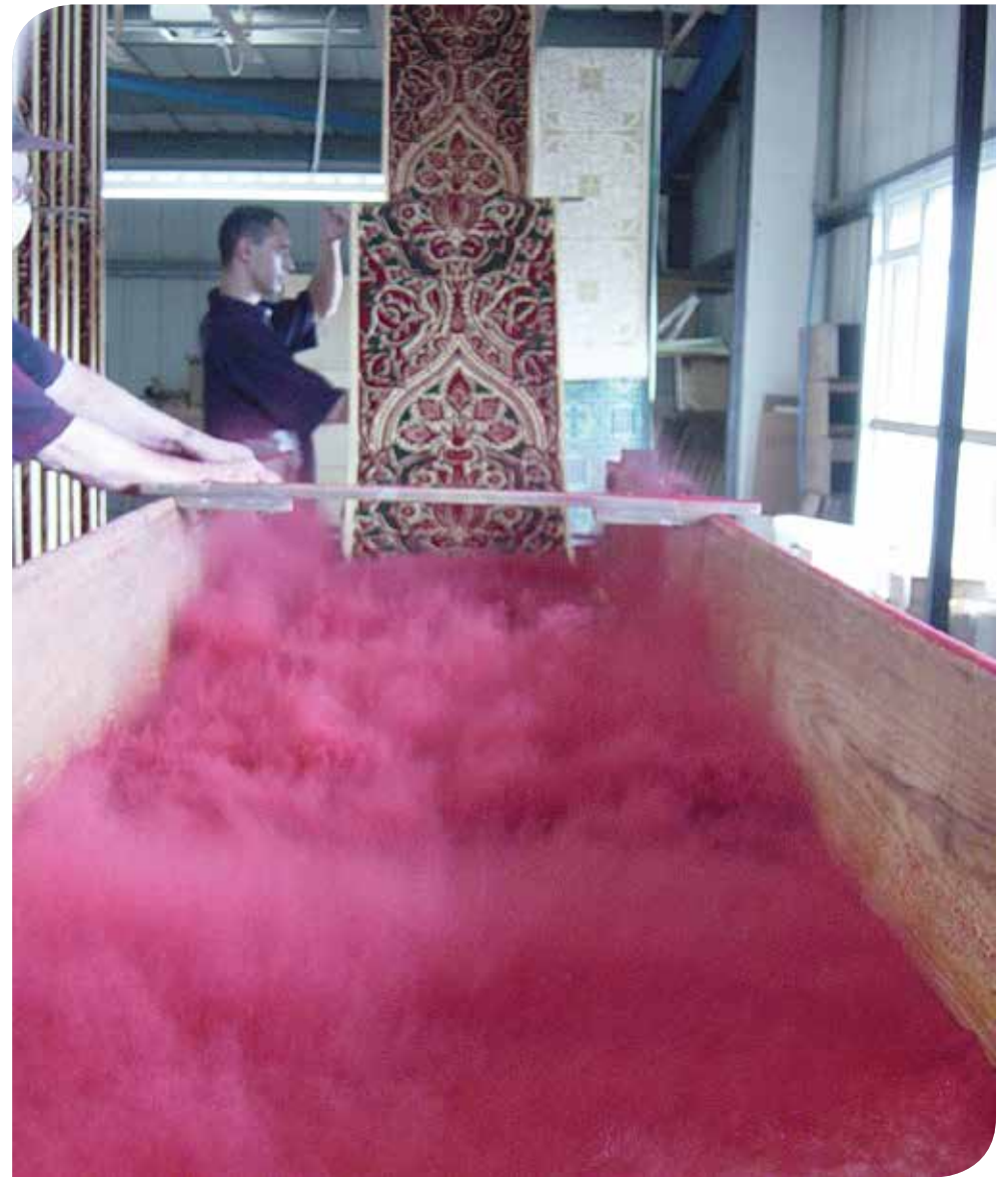
Above: Original method of flocking at Cole & Son