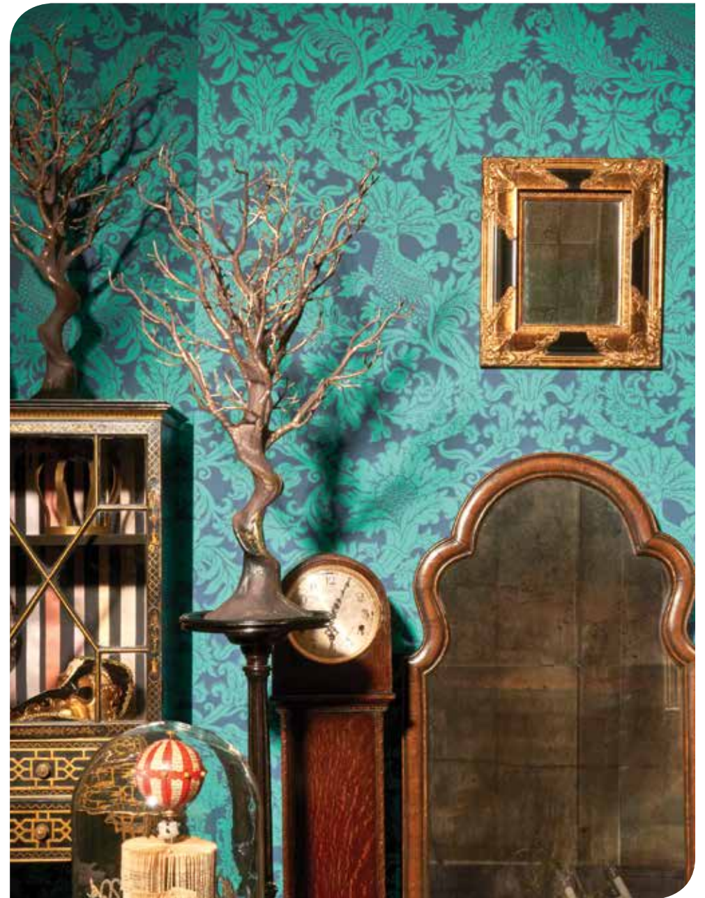
Above: Balabina 108/1005