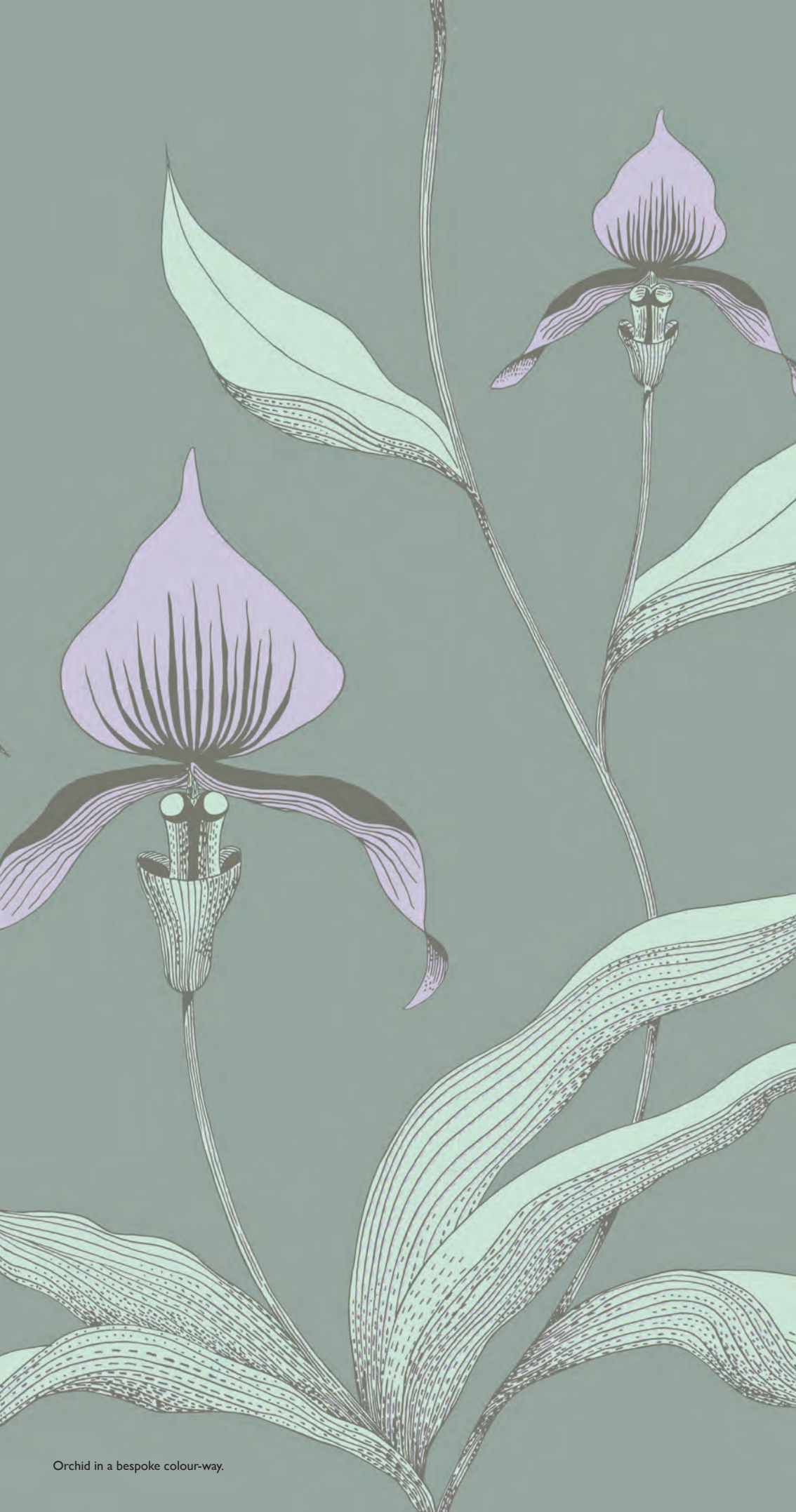
Orchid in a bespoke colour-way.