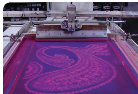
Screen printing Rajapur.

Cole & Son assembled one of the first screen printing studios in the late 1940s and our Bespoke Service continues to offer traditional screen printing today, giving the opportunity to re-colour some of our most famous designs including Rajapur, Orchid, Palm and Woods.