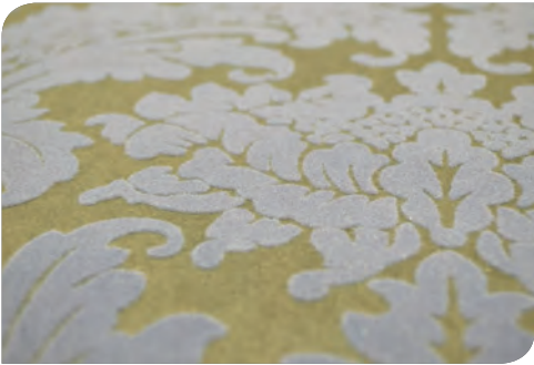
Flocked Damask in cream on gold.