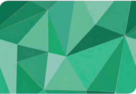
Facet in shades of green.

Cole & Son utilise the latest technology in digital printing to produce large-scale designs. Combining the latest production methods with traditional printing techniques to reproduce historic designs.