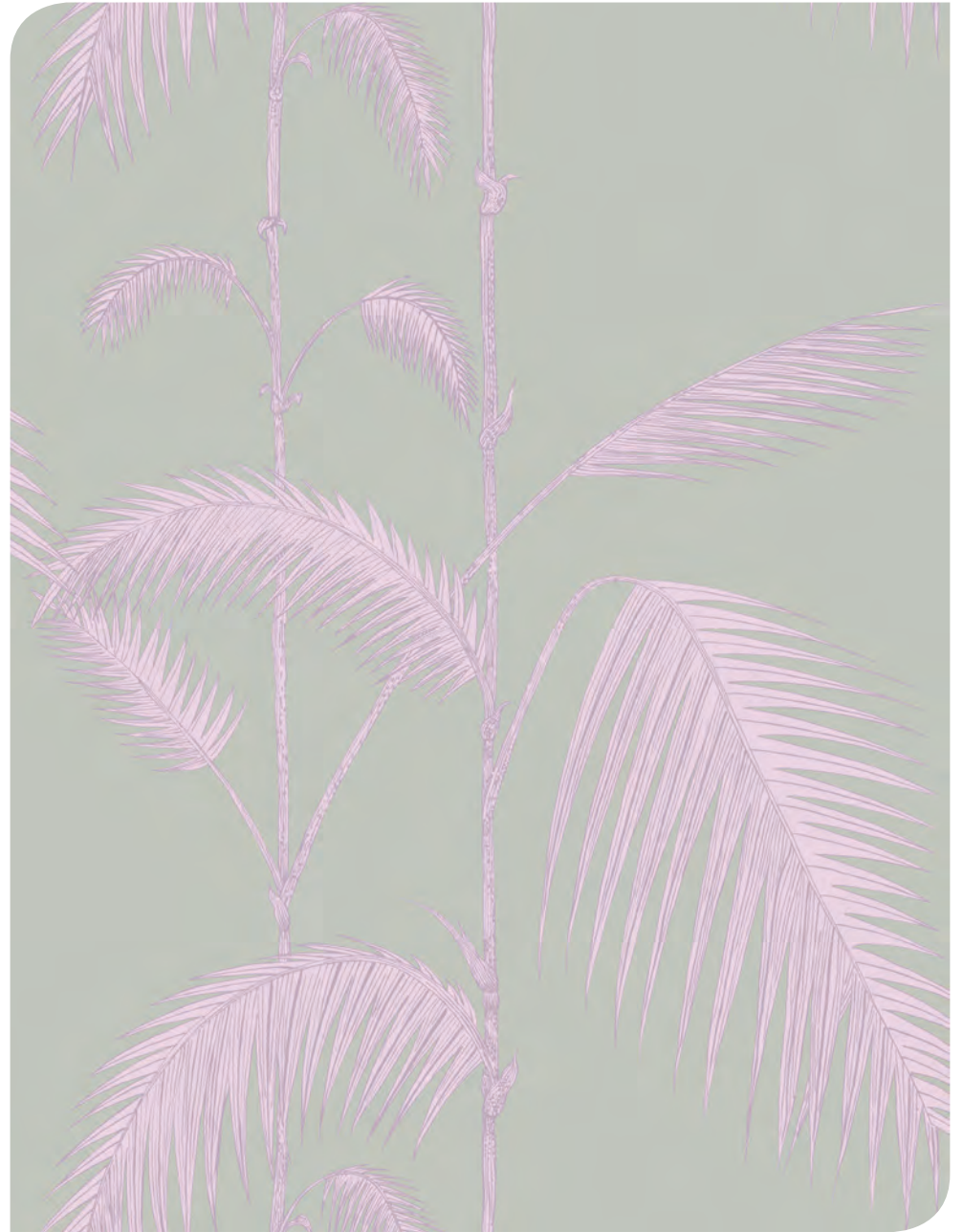
Palm in a bespoke colour-way.