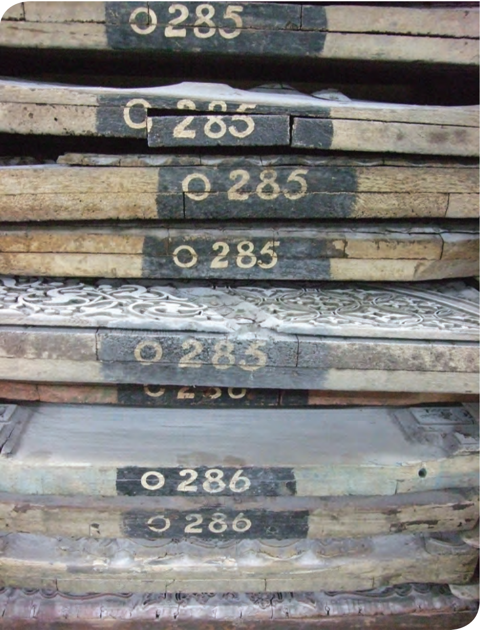
Numbered blocks in the Cole & Son archive.

The most artisanal of all our bespoke services, block printing is completed by hand, layering individual colours to form a complete design. This traditional hand printed process is especially suitable for more exclusive papers. Cole & Son maintains the most significant collection of hand carved wooden blocks in Britain with designs dating back to the early 1700s.