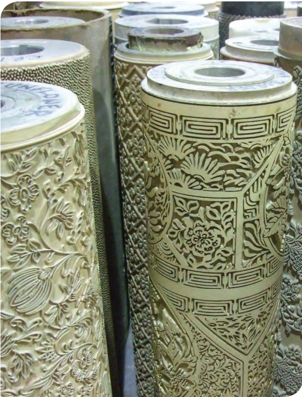
Carved and engraved rollers in the Cole & Son archive.

Surface printing uses a roller to apply ink to paper. This printing method involves producing a relief engraved cylinder of the design and is suitable for bespoke commercial orders.