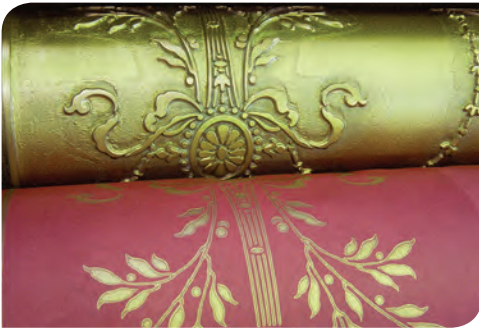
Surface printing Dorset.

Surface printing uses a roller to apply ink to paper. This printing method involves producing a relief engraved cylinder of the design and is suitable for bespoke commercial orders.