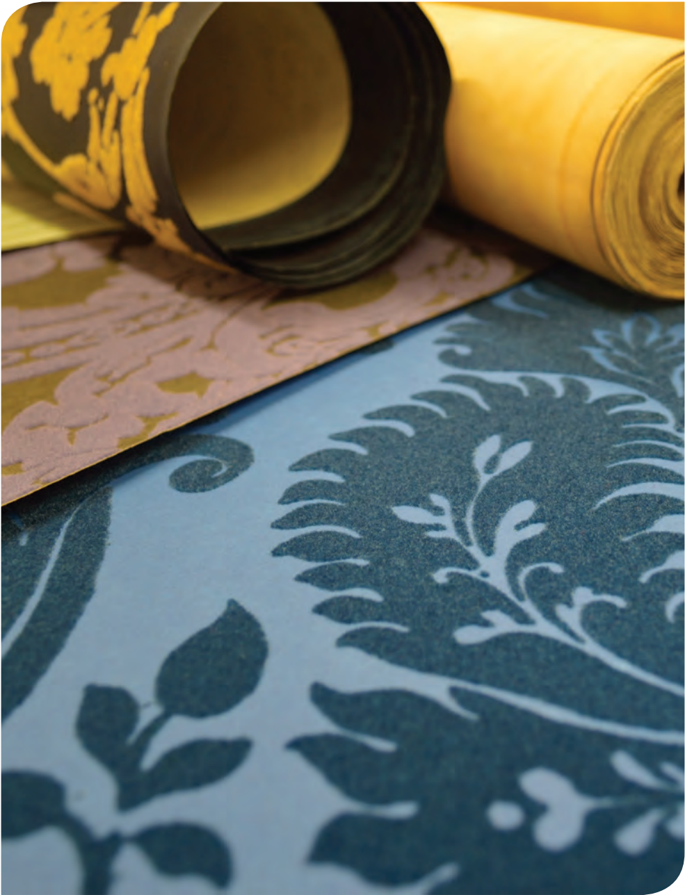
Examples of Cole & Son flocked designs.