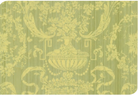
Versailles, an archive design printed with a mica jaspe ground and a single colour hand block print.