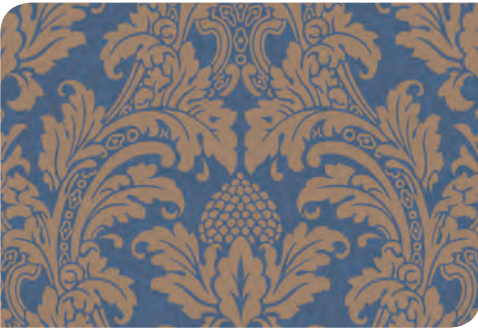
Blake produced in blue and gold.