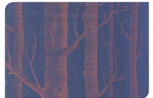
Original Woods colour-way, now discontinued, re-printed for a bespoke order.