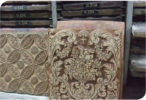
Wooden blocks in the Cole & Son block archive.