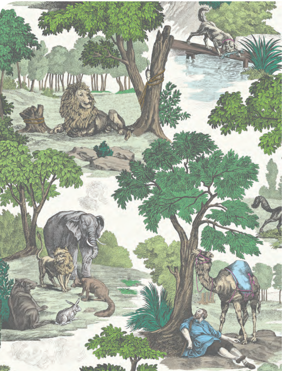
Versailles Grand from the Folie collection is a large scale digitally printed toile, re-coloured in a forest green colour-way.

Cole & Son utilise the latest technology in digital printing to produce large-scale designs. Combining the latest production methods with traditional printing techniques to reproduce historic designs.