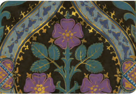
Gothic Lily by A.W.N Pugin faithfully reproduced using the original hand carved wooden blocks. Re-coloured in a bespoke colour-way.

The most artisanal of all our bespoke services, block printing is completed by hand, layering individual colours to form a complete design. This traditional hand printed process is especially suitable for more exclusive papers. Cole & Son maintains the most significant collection of hand carved wooden blocks in Britain with designs dating back to the early 1700s.