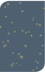
103/3017 Midnight Blue