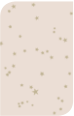
103/3015 Pink & Gold