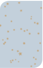
103/3016 Powder Blue