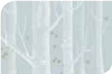
103/11051 Powder Blue