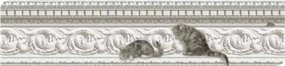
103/6025 Grey & White

Providing a witty take on a Cole & Son archival paper, Paddy & Louis features two mischievous cats and an elusive mouse hiding atop a regency style block moulding, this paper comes in a single colouring of stone and tabby. In addition it measures 34cm high with the cat and mouse trio repeating twice within a 7 metre roll. Produced on a 34cm wide 7m long roll. The pattern repeat measures 3.5m. Designed to be hung horizontally.