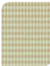
103/14061 Duck Egg