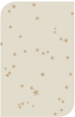
103/3014 Buff & Gold