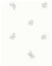
103/10033 White & Lilac