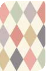
103/2009 Coral & Green