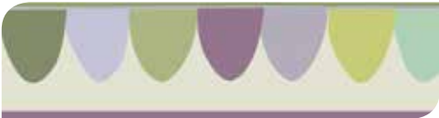
103/8028 Purple & Green