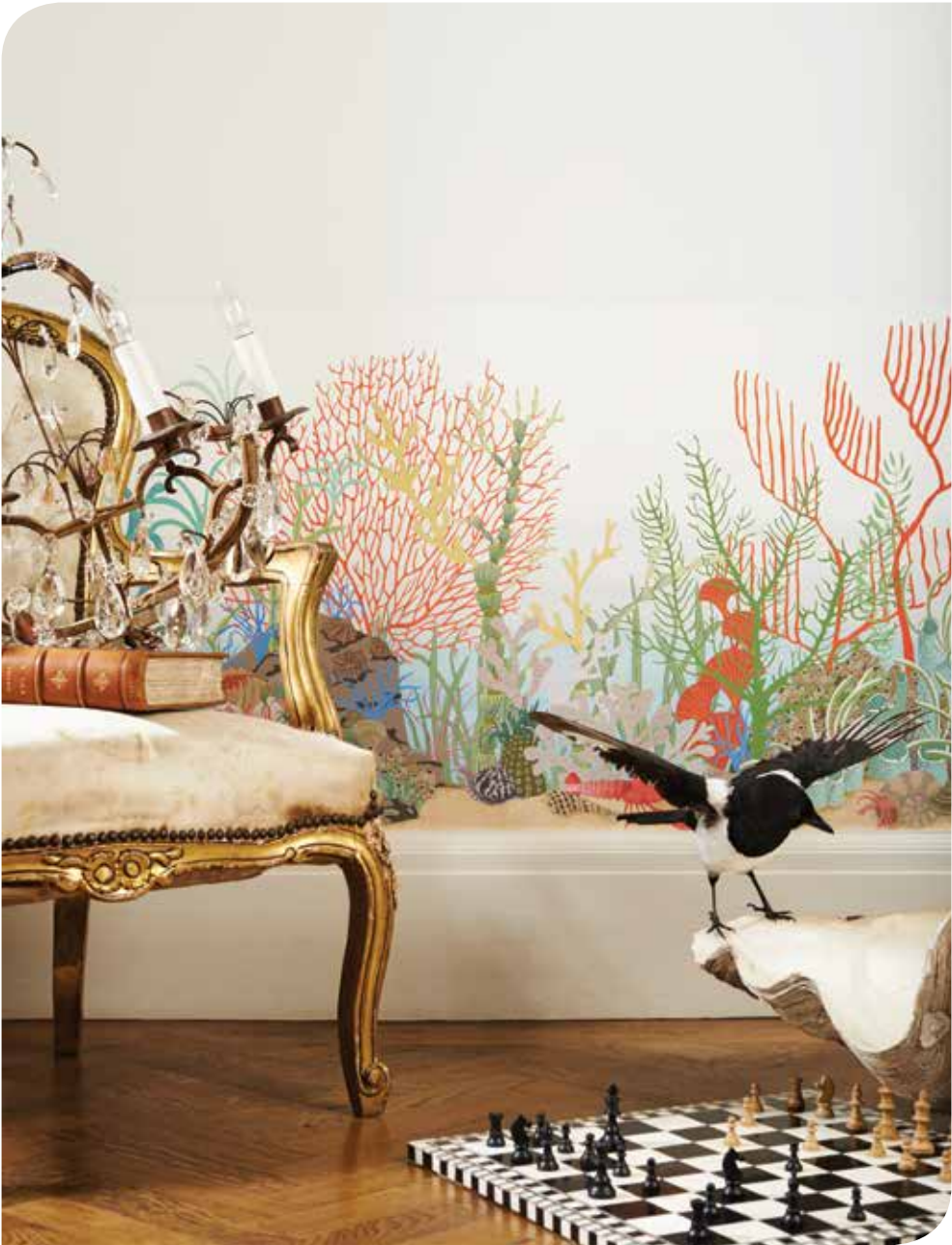
Archipelago Border 103/12054

With its company of crustaceans and shells hiding amongst strange and wonderful waterworld plants and coral on a shoreline somewhere far away, this 68.5cm high frieze is perfect for adding an aquatic twist to any environment. The design repeats once every 1.5 metres on a 7.5 metre roll. Produced on a 68.5cm wide 7.5m roll. The pattern repeat measures 150cm on a 7.5m roll.