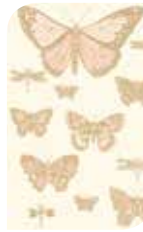
103/15066 Pink & Ivory