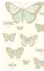
103/15065 Duck Egg & Ivory