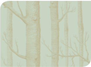
103/5023 Green & Gold