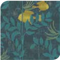
103/4018 Dark Blue

Produced on a 52cm wide 10m roll. The pattern repeat measures 64cm with a half drop.