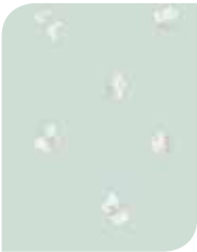
103/10032 Duck Egg

Taking a print which has been in the Cole & Son block archives for many years, Peaseblossom is a delightful butterfly print which has been recoloured here for the Whimsical Collection in pretty shades of duck egg and calm neutrals. Produced on a 52cm wide 10m roll. The pattern repeat measures 35.9cm with a straight match.