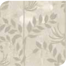
103/4021 Neutral & Gilver