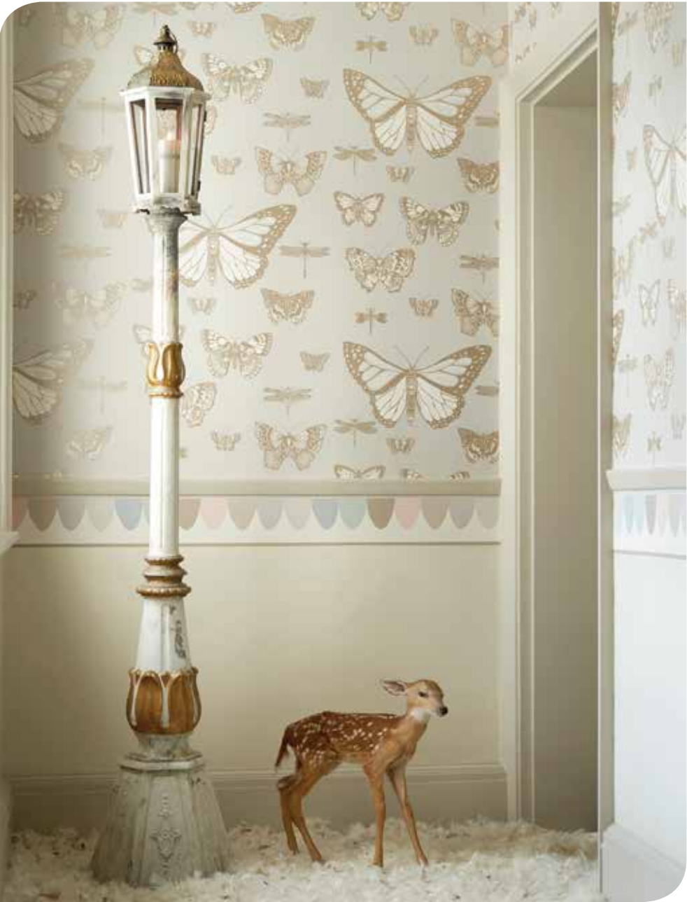
Butterflies & Dragonflies 103/15064 & Scaramouche 103/8027

Taken from the Cole & Son archives this elegant design surprises with its scale. It features large graphical butterflies and dragonflies in shimmering metallic on cool neutral grounds, with the addition of a more unusual emerald and gold on deep charcoal, and a bright pink on blue. Produced on a 52cm wide 10m roll. The pattern repeat measures 72cm with a half drop.