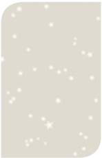
103/3012 Grey & White

Taken from the Cole & Son block print archives, this charming design, produced in six celestial colourings, provides the perfect magical backdrop to any space. Produced on a 52cm wide 10m roll. The pattern repeat measures 64cm with a half drop.