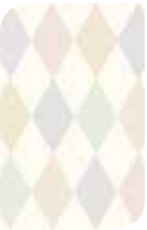
103/2010 Soft Pink