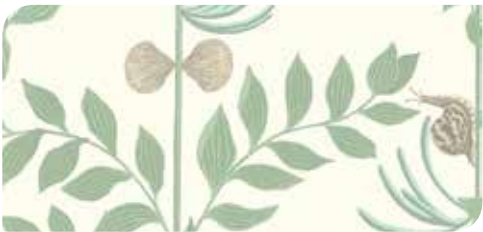
103/9031 Soft Green