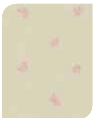
103/10036 Linen & Pink

For every roll of Peaseblossom purchased Cole & Son will donate £1 to Butterfly Conservation to support their vital work to save butterflies, moths and our environment. For further details visit www.butterfly-conservation.org