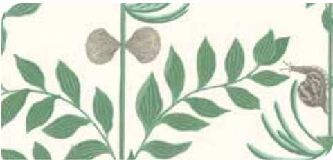
103/9030 Dark Green

Designed as a companion to Nautilus, Secret Garden presents an amusing take on the traditional foliage pattern. Sea shells mingle with garden snails to reveal a verdant underwater jungle. At 52cm wide this design is offered in two colourings of emerald green and misty sage. Produced on a 52cm wide 10m roll. The pattern repeat measures 64cm with a half drop.