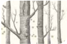
103/11050 Black & White