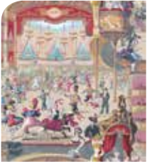
103/7026 Red & Yellow

A highly unusual archive design, Cabaret is an exuberant wallpaper with a strong narrative. With its carnival imagery and colouring, featuring whirling dancers, this design measures 68.5cm wide, repeats on a half drop and is offered as a single handsome colourway. Produced on a 68.5cm wide 10m roll. The pattern repeat measures 76.2cm with a half drop.