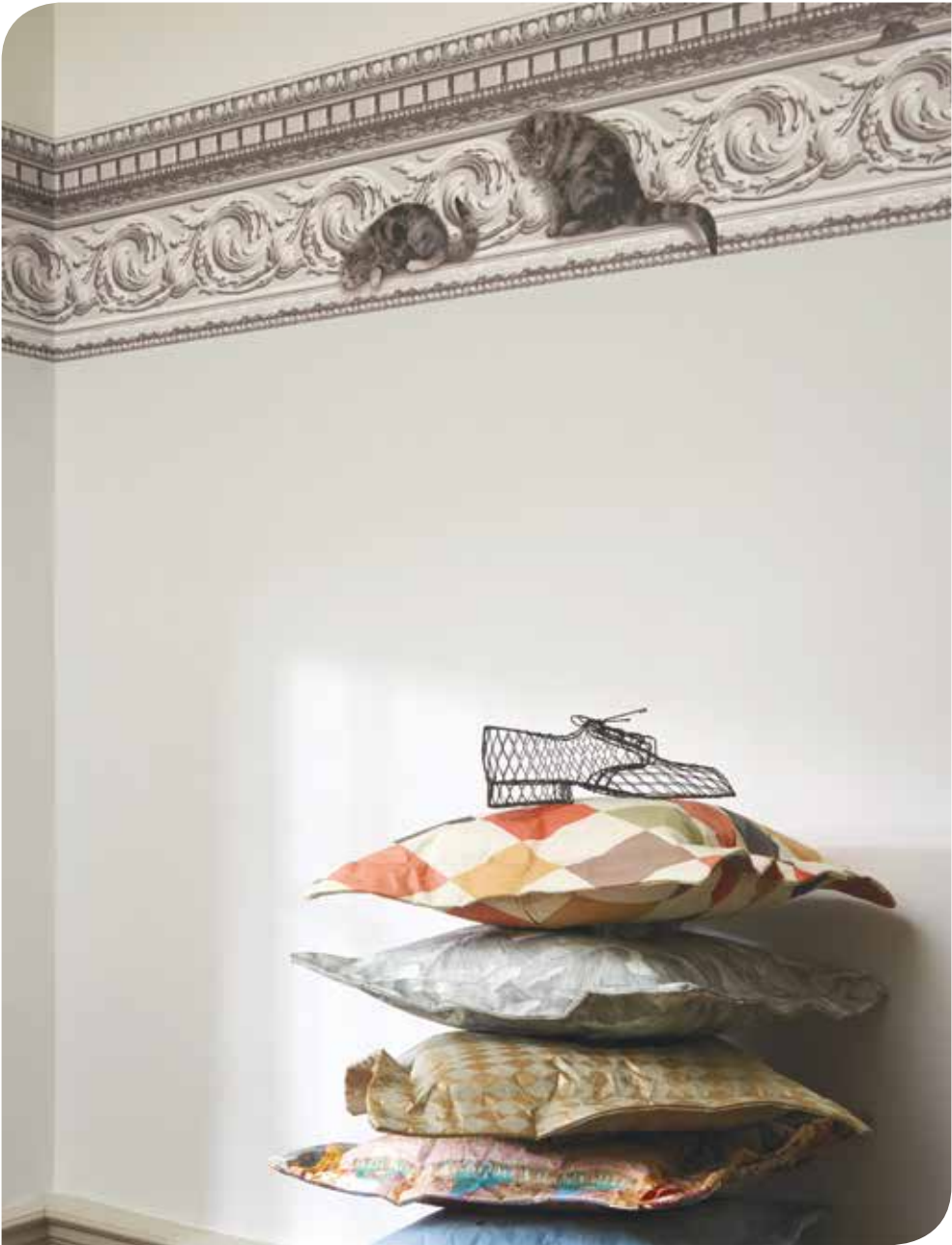
Paddy & Louis Border 103/6025

Providing a witty take on a Cole & Son archival paper, Paddy & Louis features two mischievous cats and an elusive mouse hiding atop a regency style block moulding, this paper comes in a single colouring of stone and tabby. In addition it measures 34cm high with the cat and mouse trio repeating twice within a 7 metre roll. Produced on a 34cm wide 7m long roll. The pattern repeat measures 3.5m. Designed to be hung horizontally.