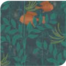
103/4019 Dark Green