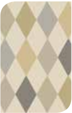
103/2008 Metallics on Linen