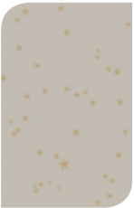
103/3013 Linen & Gold