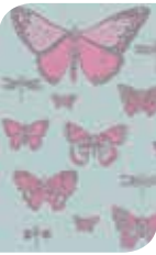
103/15062 Pink & Blue

Taken from the Cole & Son archives this elegant design surprises with its scale. It features large graphical butterflies and dragonflies in shimmering metallic on cool neutral grounds, with the addition of a more unusual emerald and gold on deep charcoal, and a bright pink on blue. Produced on a 52cm wide 10m roll. The pattern repeat measures 72cm with a half drop.