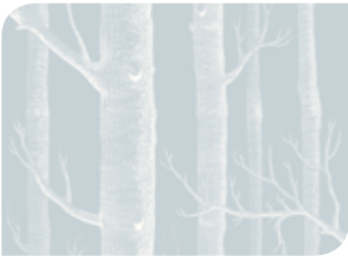
103/5022 Powder Blue

Produced on a 52cm wide 10m roll. The pattern repeat measures 72cm with a half drop.