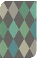
103/2007 Teal on Charcoal