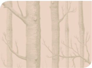
103/5024 Pink & Gilver