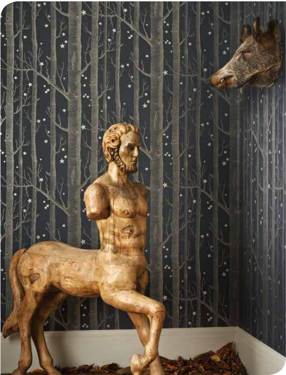
Woods & Stars 103/11053

For every roll of Peaseblossom purchased Cole & Son will donate £1 to Butterfly Conservation to support their vital work to save butterflies, moths and our environment. For further details visit www.butterfly-conservation.org