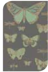
103/15067 Green & Charcoal