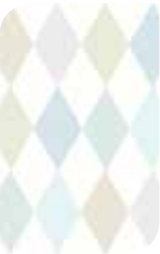
103/2011 Soft Blue