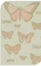
103/15063 Pink & Olive