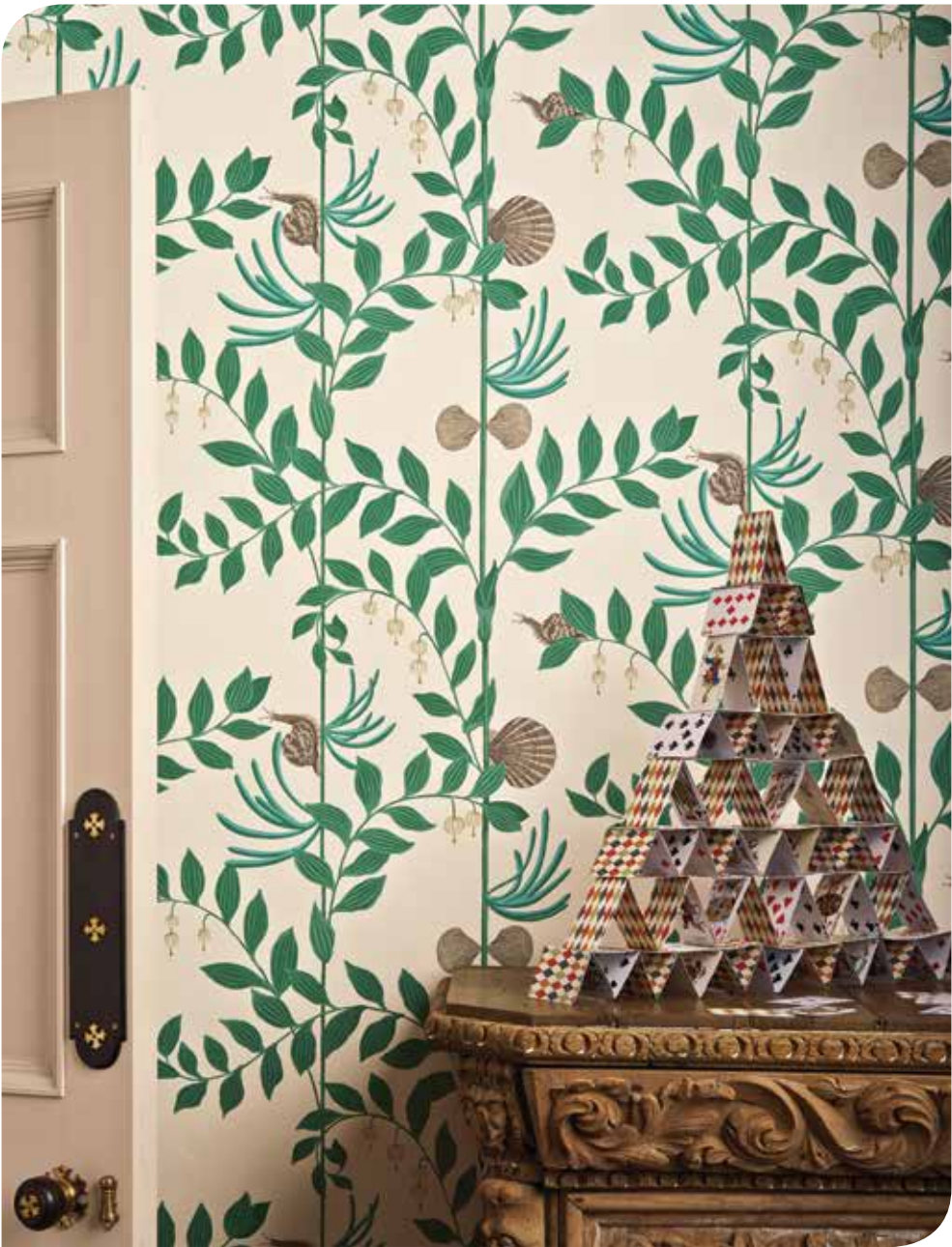
Secret Garden 103/9030

Designed as a companion to Nautilus, Secret Garden presents an amusing take on the traditional foliage pattern. Sea shells mingle with garden snails to reveal a verdant underwater jungle. At 52cm wide this design is offered in two colourings of emerald green and misty sage. Produced on a 52cm wide 10m roll. The pattern repeat measures 64cm with a half drop.