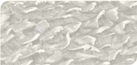
103/13055 Black & White

Designed as a whale-free alternative to Melville, this attractive finely engraved sea print will be a talking point for any interior. It is presented in two colour-ways of charcoal on white and stormy bronze and gilver, on a 68.5cm wide single roll. Produced on a 68.5cm wide 10m roll. The pattern repeat measures 68.5cm with a half drop.