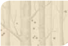
103/11049 Buff & Gold