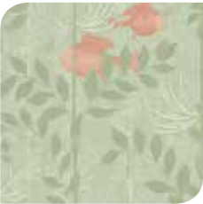
103/4020 Soft Green