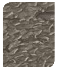
103/1005 Metallic Charcoal