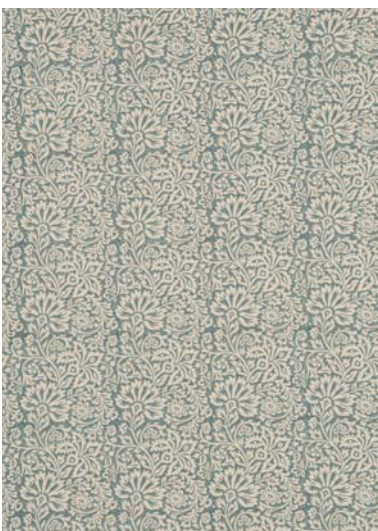
Flora BP10558/2 4 colours