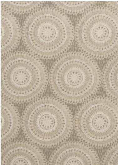
Cheriton BP10568/4 4 colours