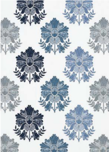
Tregony BF10562/1 4 colours