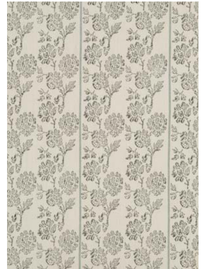
Zennor BP10555/3 4 colours