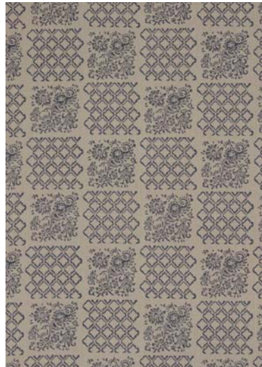
Carew BP10559/1 2 colours