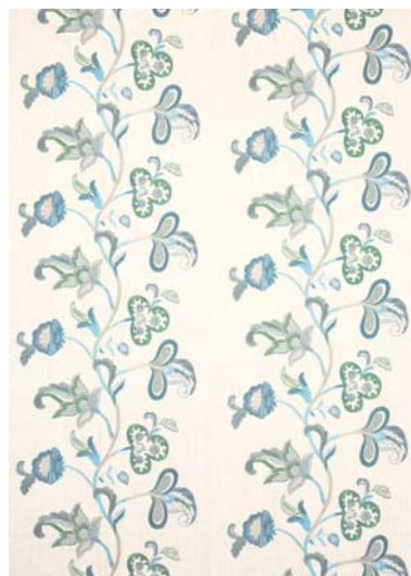
Cawdor BF10560/2 3 colours