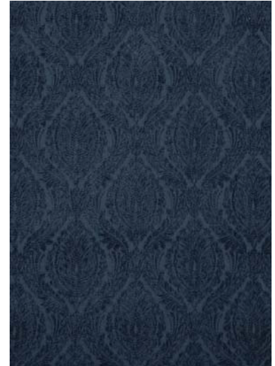
Pentire BF10569/680 5 colours