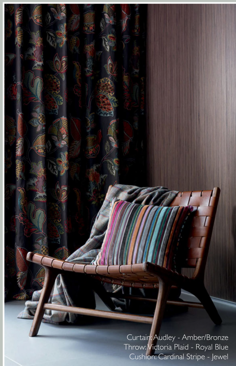
Curtain: Audley - Amber/Bronze Throw: Victoria Plaid - Royal Blue Cushion: Cardinal Stripe - Jewel