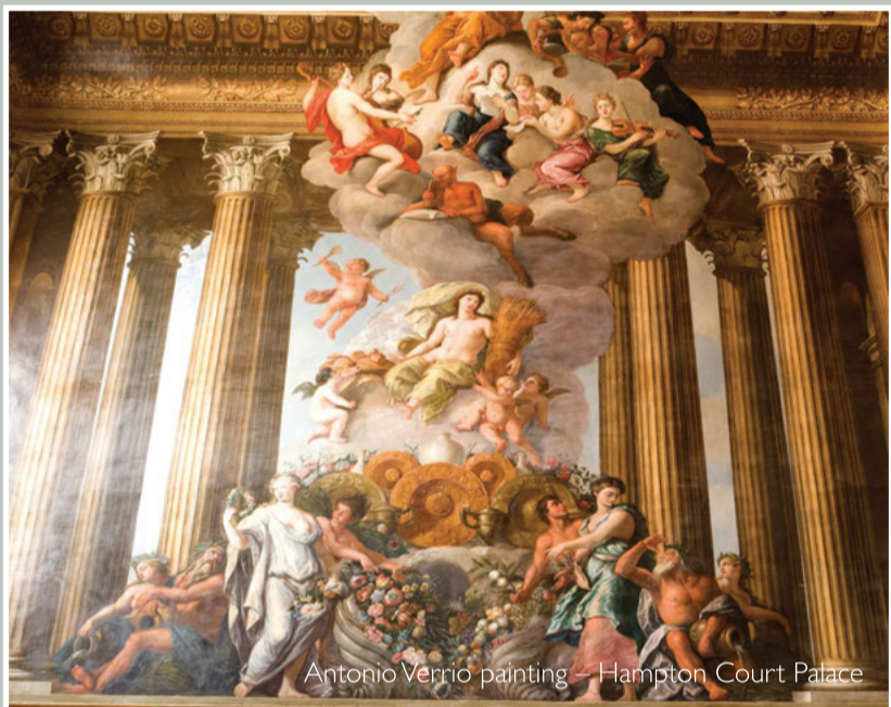
Antonio Verrio painting - Hampton Court Palace