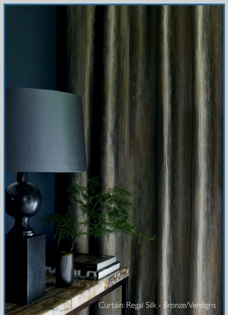
Curtain: Regal Silk - Bronze/Verdigris