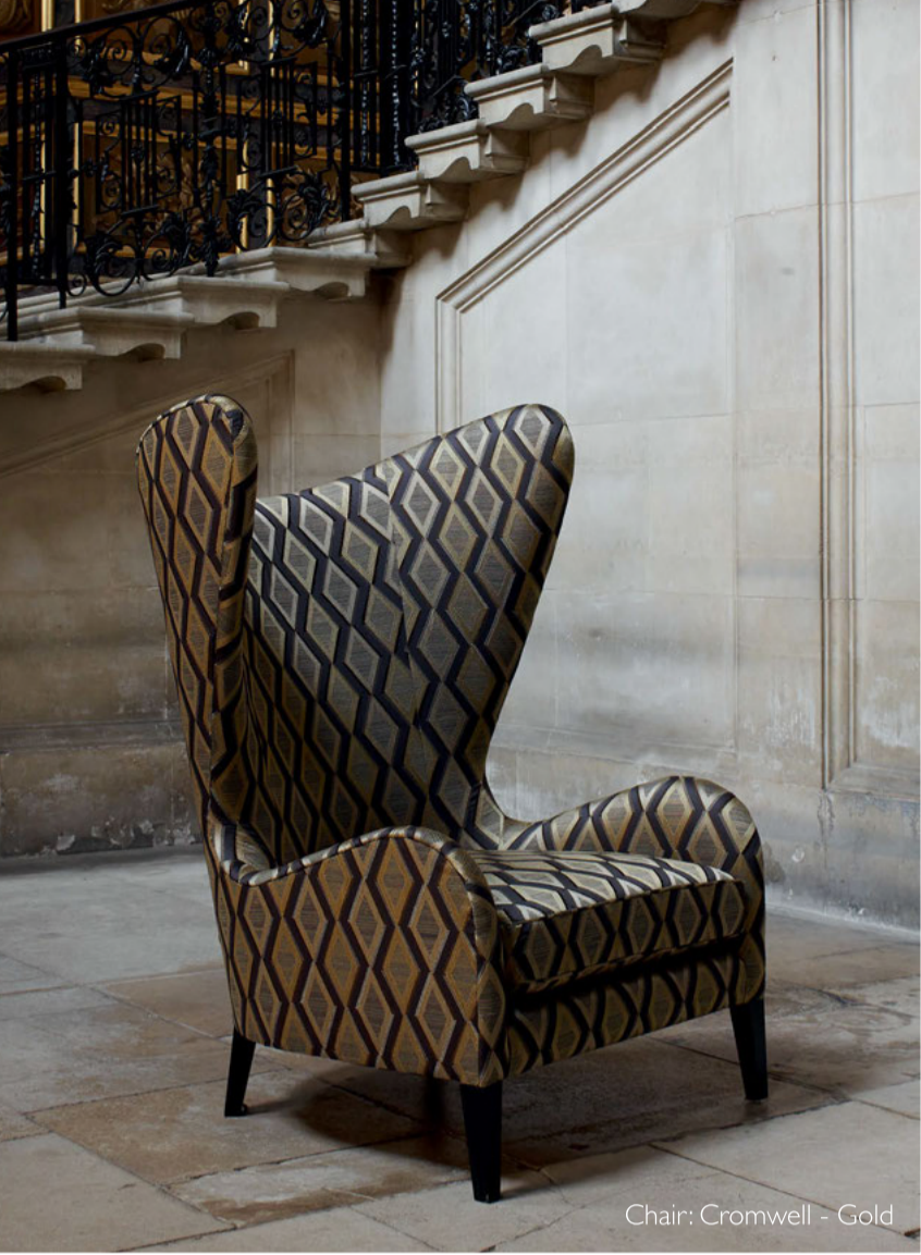
Chair: Cromwell - Gold