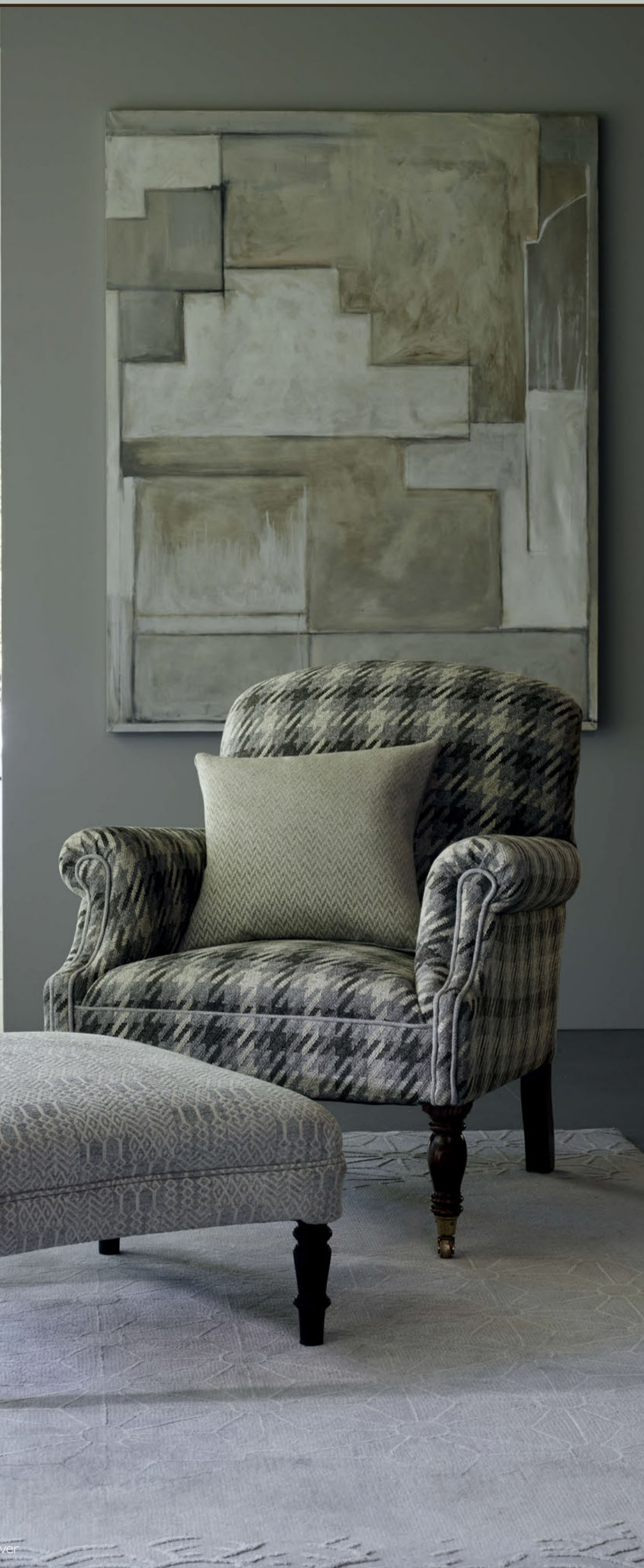
Chair: Court Plaid - Silver Cushion: York Weave - Silver Footstool: Chimney Weave - Silver