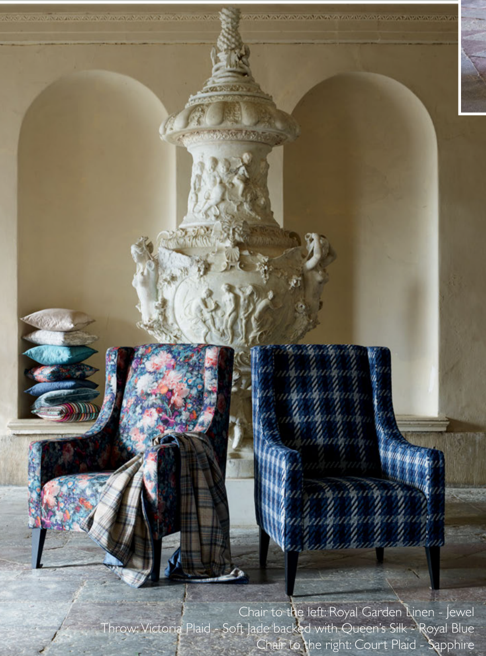
Chair to the left: Royal Garden Linen - Jewel Throw: Victoria Plaid - Soft Jade backed with Queen's Silk - Royal Blue Chair to the right: Court Plaid - Sapphire