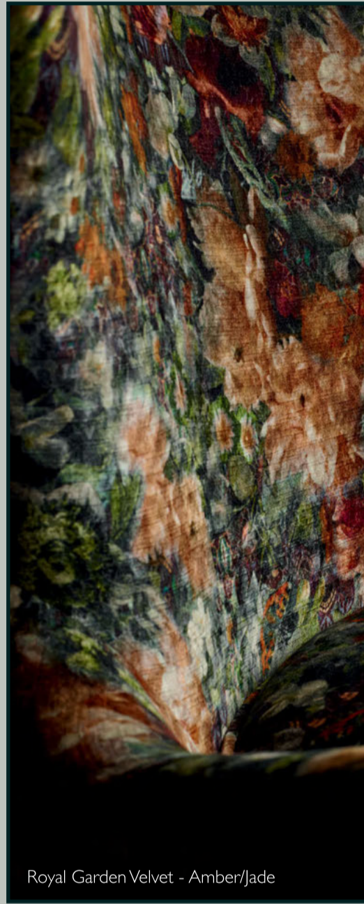
Royal Garden Velvet - Amber/Jade

Darkly romantic, this lovely print honours the glorious gardens of Hampton Court Palace and Kensington Palace. Reminiscent of the beautiful blooms painted on to the ceiling of the King's bedchamber at Hampton Court Palace by the 17th century Italian artist, Antonio Verrio, Royal Garden is printed on both velvet and linen.