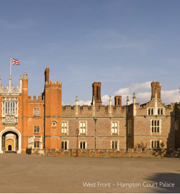
West Front – Hampton Court Palace