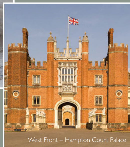
West Front – Hampton Court Palace

Elements of the spectacular gardens, architecture and interiors of these important royal residences have been brilliantly interpreted resulting in magnificent decorative prints and embroideries, shimmering silks, supple velvets and a very special range of stunning weaves.