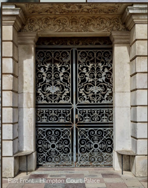
East Front - Hampton Court Palace