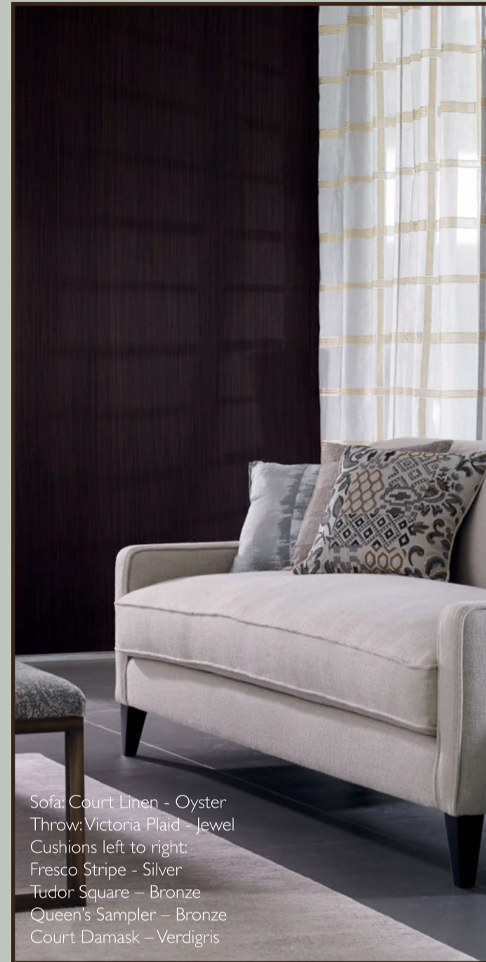
Sofa: Court Linen - Oyster Throw: Victoria Plaid - Jewel Cushions left to right: Fresco Stripe - Silver Tudor Square - Bronze Queen's Sampler - Bronze Court Damask - Verdigris

These richly textured weaves echo the intricate brickwork of Hampton Court Palace and its decorative Tudor chimneys which were the earliest of their type in England and a clear indication of exceptional wealth and status. Tactile and relaxed with a subtle colour palette, Royal Weaves provide the perfect complement to all of the designs in the collection.