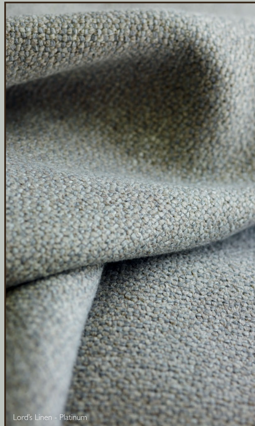
Lord's Linen - Platinum