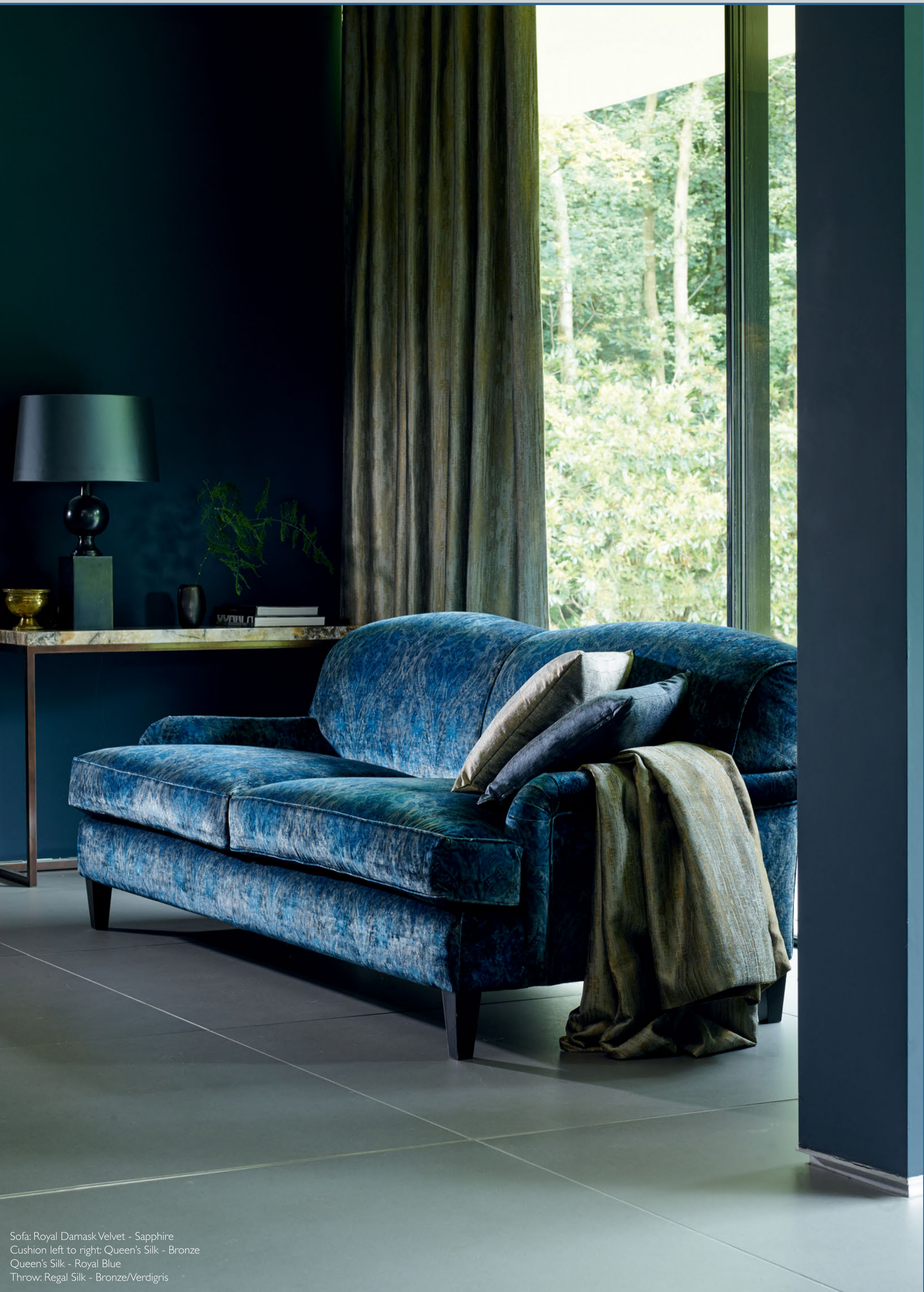
Sofa: Royal Damask Velvet - Sapphire Cushion left to right: Queen's Silk - Bronze Queen's Silk - Royal Blue Throw: Regal Silk - Bronze/Verdigris