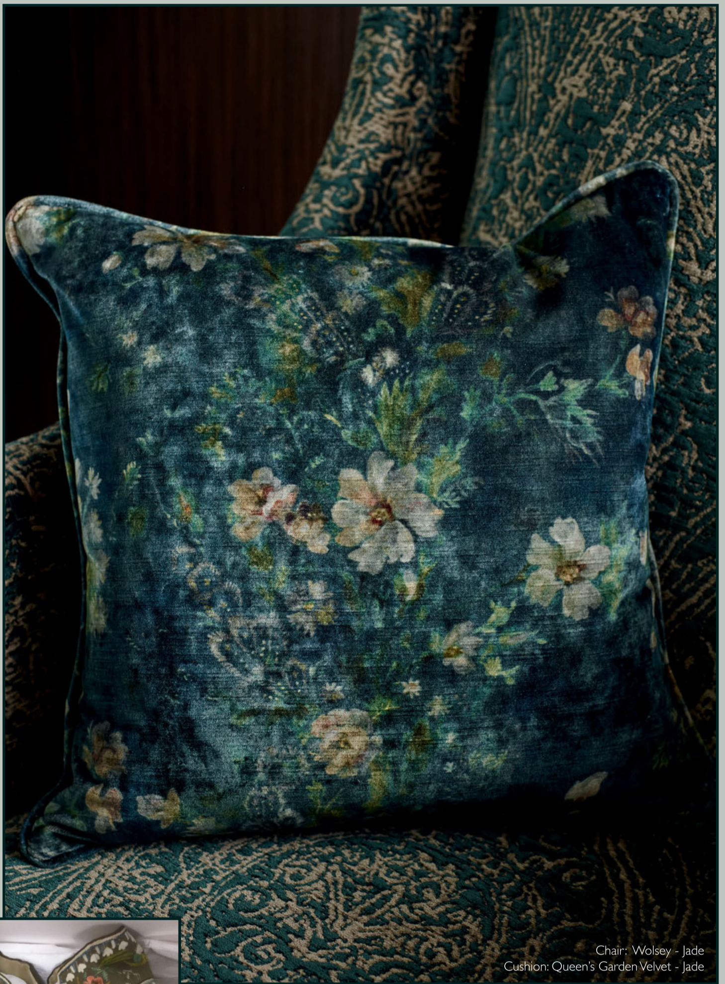
Chair: Wolsey - Jade Cushion: Queen's Garden Velvet - Jade

The exquisite embroidery of an 18th century courtier's coat sourced from The Royal Ceremonial Dress Collection has been sensitively adapted into a delicate all over floral printed on to a luxurious velvet. The artistry and craftsmanship of these embroidered coats and dresses were much treasured and were a reflection of the owners' style, power and wealth.