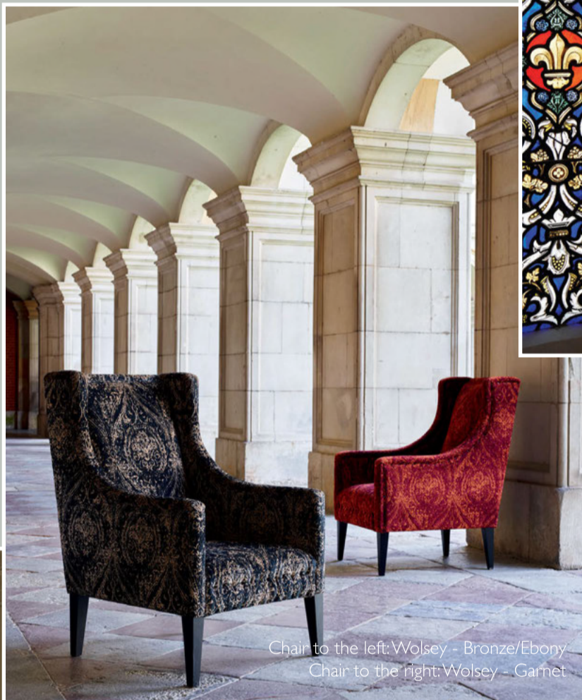
Chair to the left: Wolsey - Bronze/Ebony Chair to the right: Wolsey - Garnet