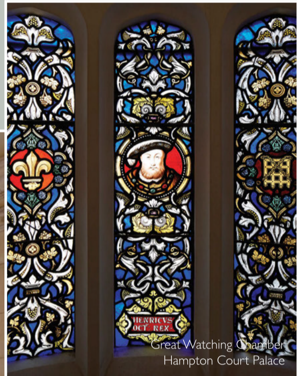
Great Watching Chamber Hampton Court Palace