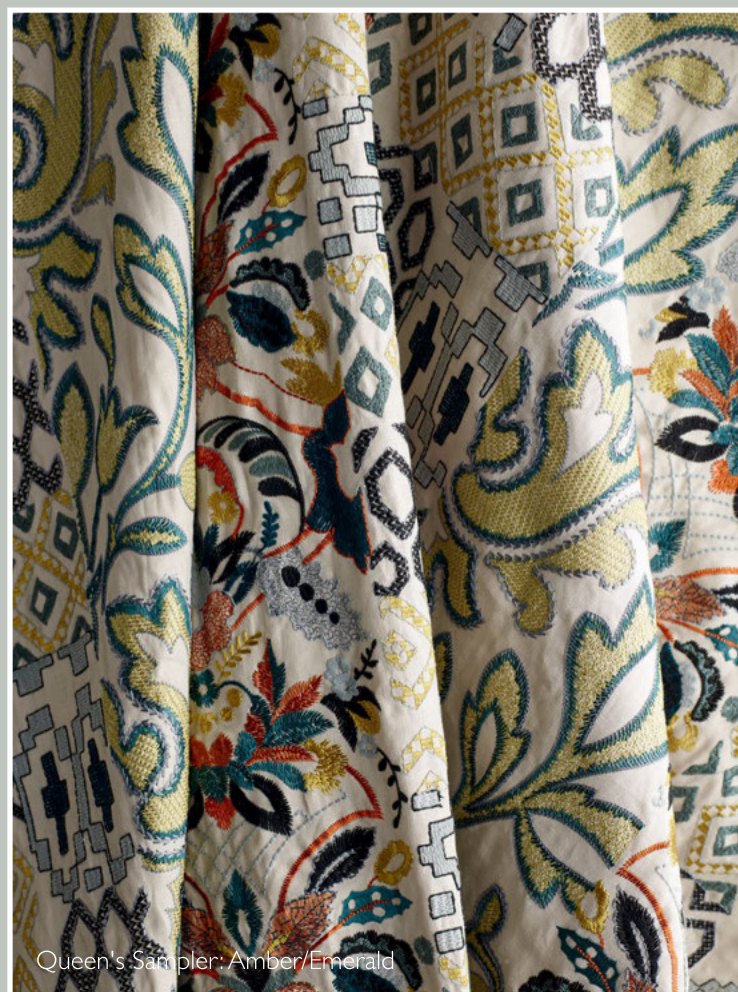
Queen's Sampler: Amber/Emerald