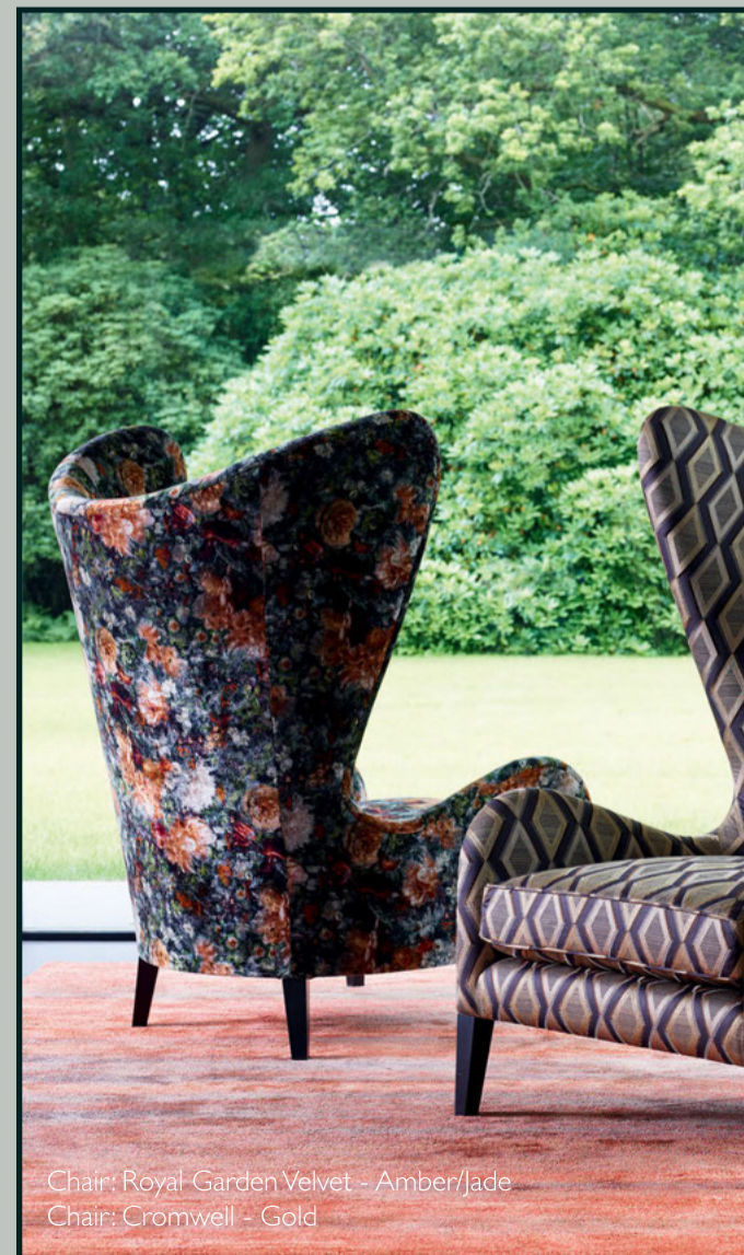
Chair: Royal Garden Velvet - Amber/Jade Chair: Cromwell - Gold