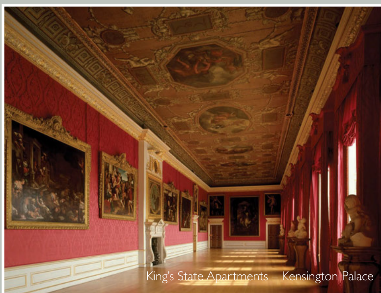
King's State Apartments – Kensington Palace