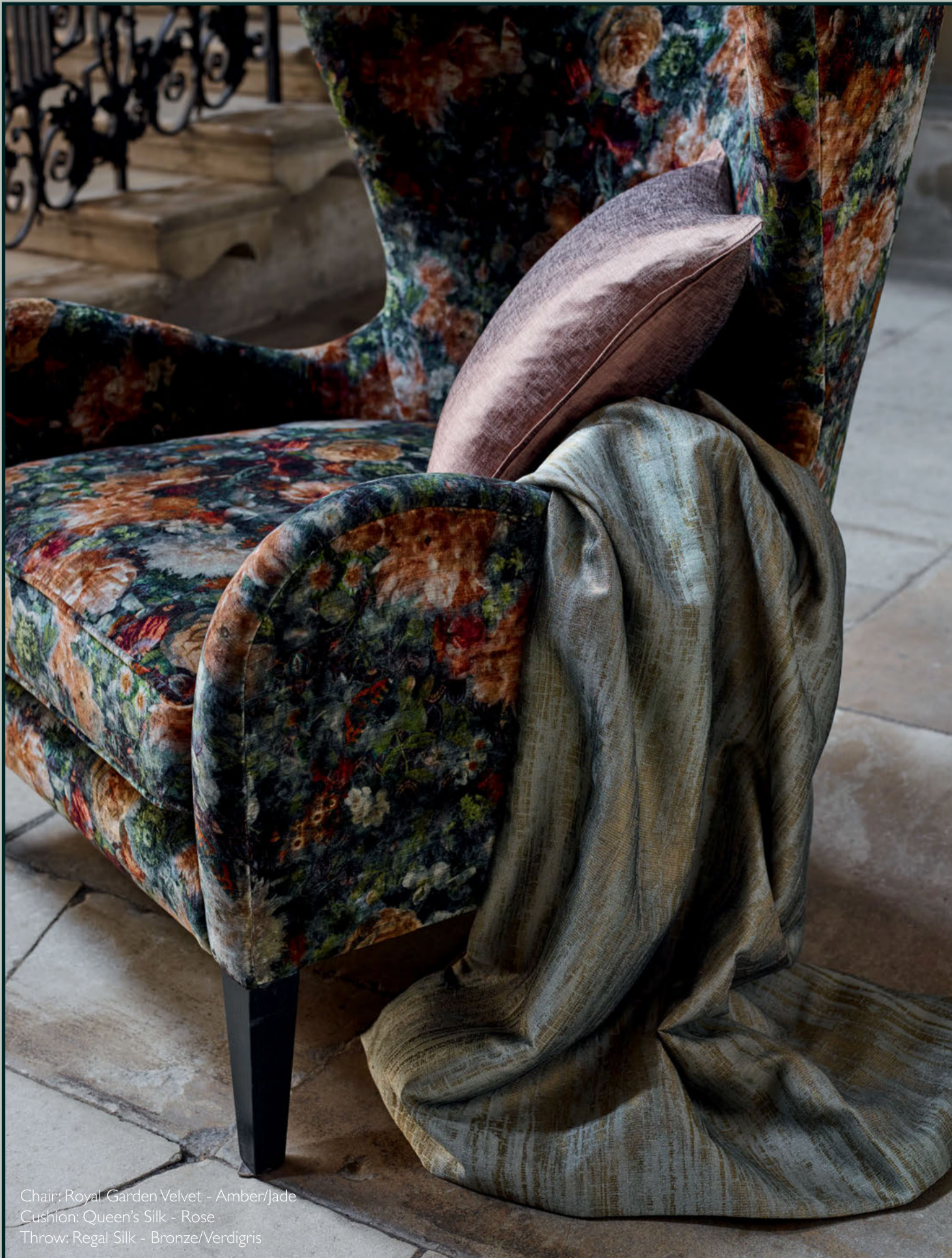
Chair: Royal Garden Velvet - Amber/Jade Cushion: Queen's Silk - Rose Throw: Regal Silk - Bronze/Verdigris