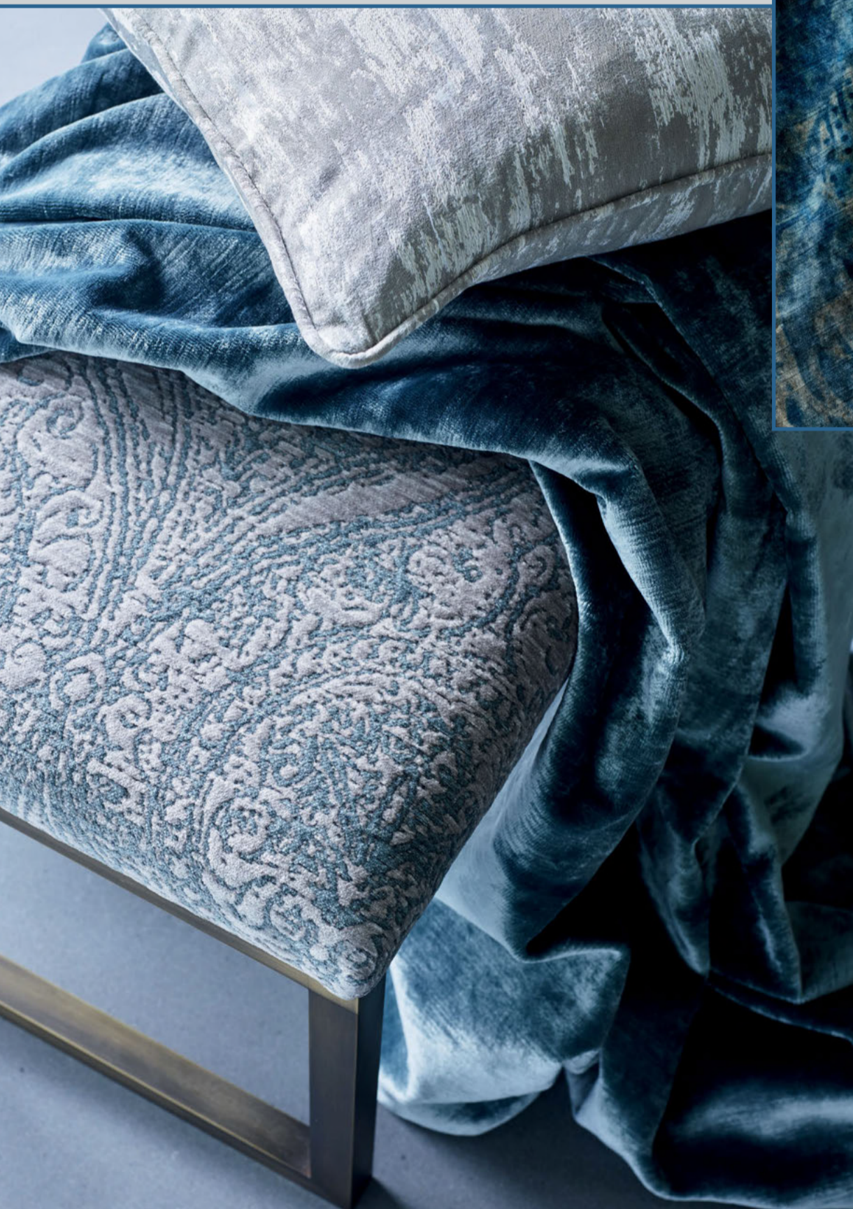
Bench: Wolsey - Verdigris Cushion: Palace Fresco - Silver Throw: King's Velvet - Jade