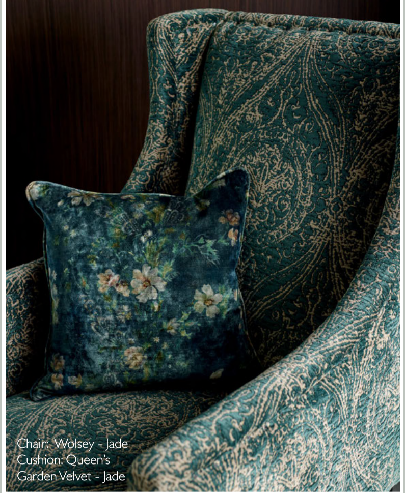
Chair: Wolsey - Jade Cushion: Queen's Garden Velvet - Jade