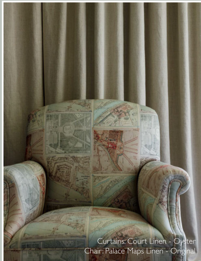
Curtains: Court Linen - Oyster Chair: Palace Maps Linen - Original