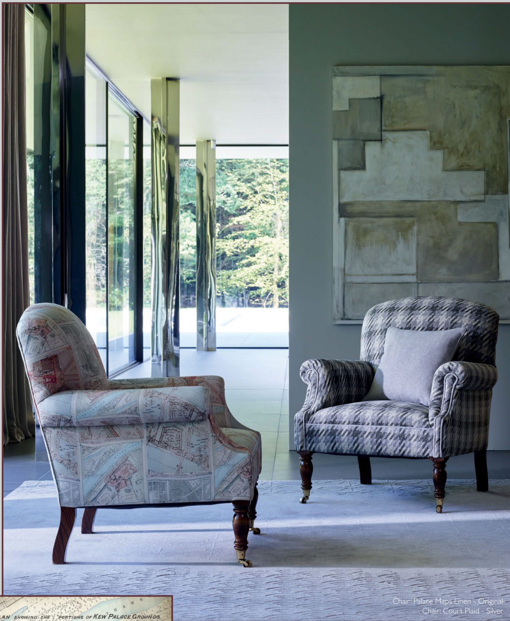
Chair: Palace Maps Linen - Original Chair: Court Plaid - Silver