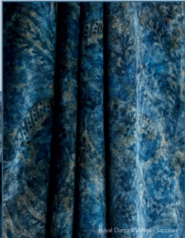
Royal Damask Velvet - Sapphire

For hundreds of years, bold rich damask patterns have also decorated the interiors of English royal palaces.