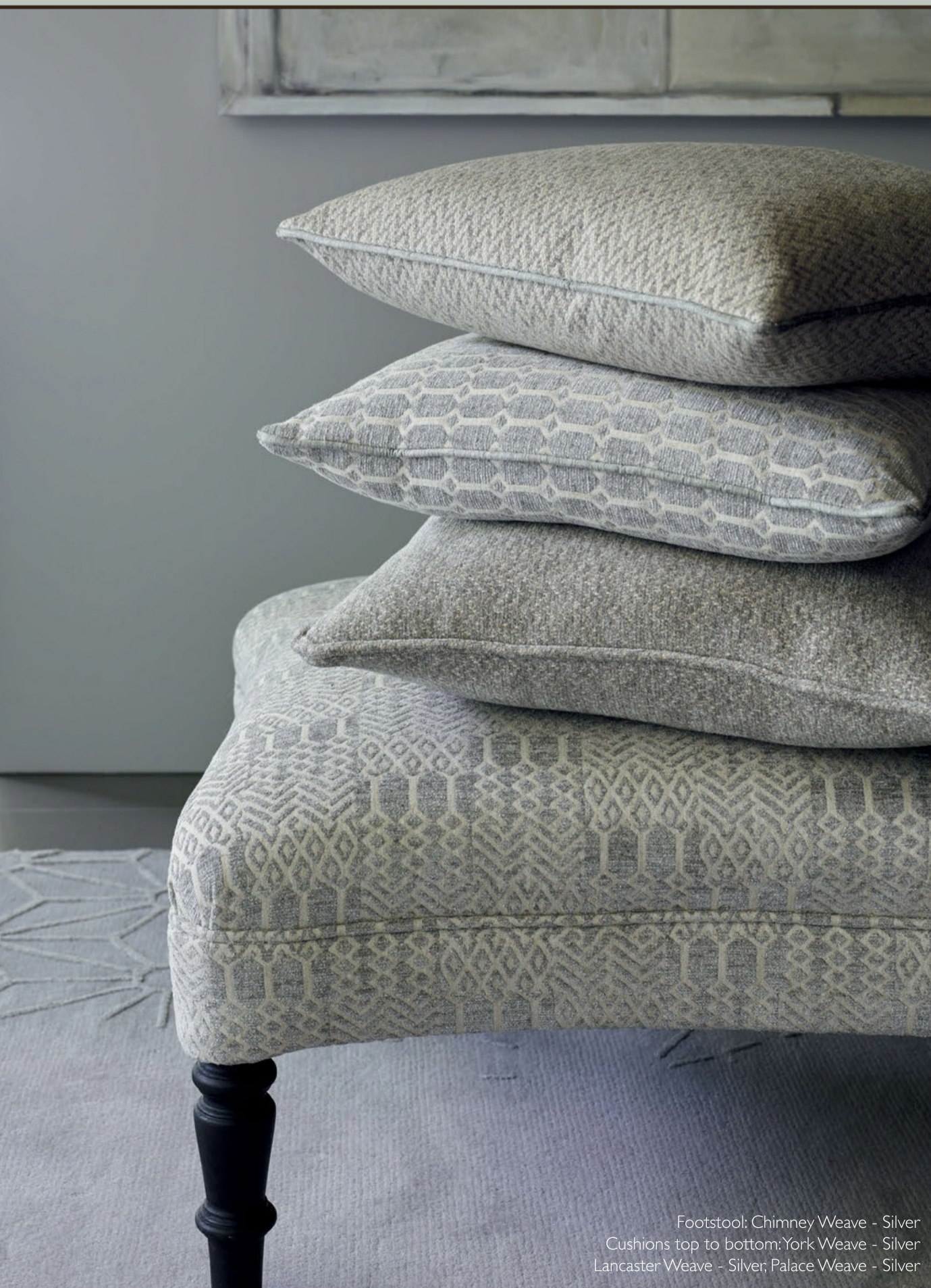
Footstool: Chimney Weave - Silver Cushions top to bottom: York Weave - Silver Lancaster Weave - Silver; Palace Weave - Silver