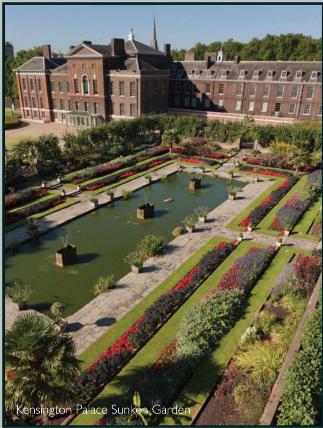
Kensington Palace Sunken Garden

Darkly romantic, this lovely print honours the glorious gardens of Hampton Court Palace and Kensington Palace. Reminiscent of the beautiful blooms painted on to the ceiling of the King's bedchamber at Hampton Court Palace by the 17th century Italian artist, Antonio Verrio, Royal Garden is printed on both velvet and linen.