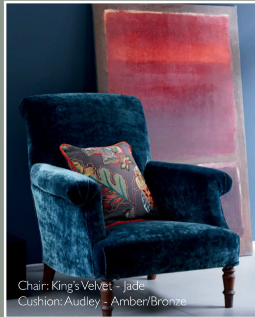
Chair: King's Velvet - Jade Cushion: Audley - Amber/Bronze

Inspired by the opulent velvet in the crown jewels held at the Tower of London, this supremely tactile and luxurious velvet has a wonderful wide-ranging and contemporary colour palette, reflecting the jewel like colours.