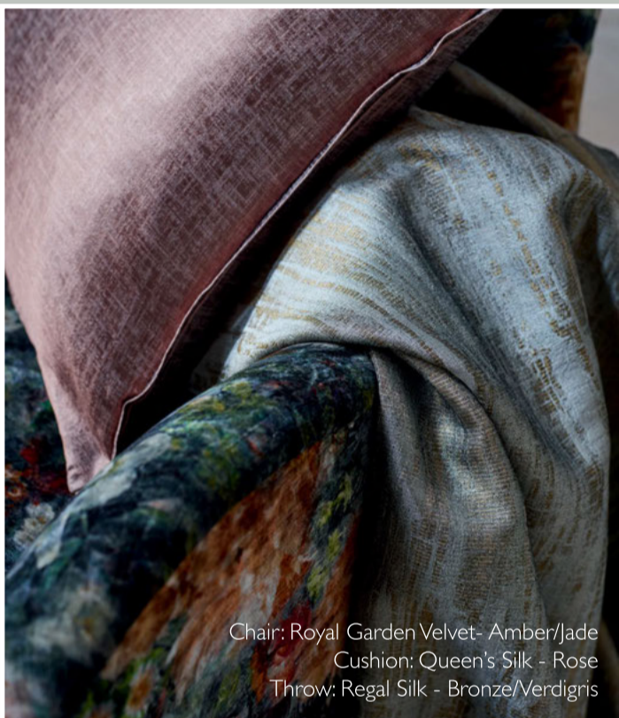
Chair: Royal Garden Velvet- Amber/Jade Cushion: Queen's Silk - Rose Throw: Regal Silk - Bronze/Verdigris