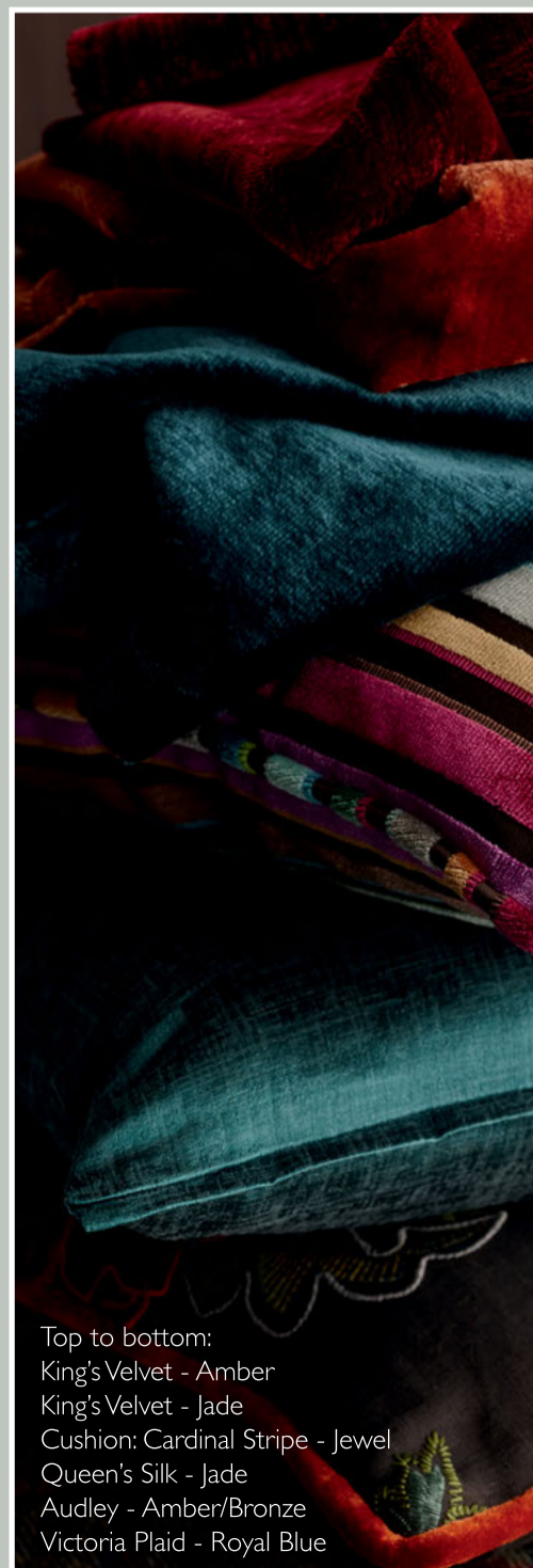
Top to bottom: King's Velvet - Amber King's Velvet - Jade Cushion: Cardinal Stripe - Jewel Queen's Silk - Jade Audley - Amber/Bronze Victoria Plaid - Royal Blue