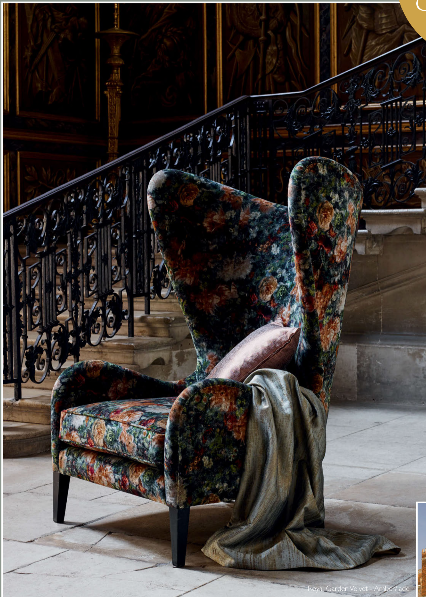
Royal Garden Velvet - Amber/Jade