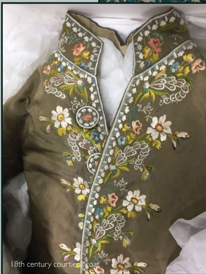
18th century courtier's coat