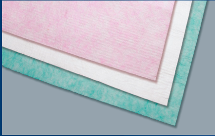
SurgiSafe® Standard Absorbent Floor Mats