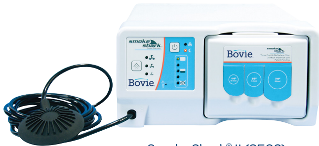
Smoke Shark® II (SE02)