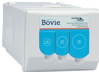
Smoke Shark® II Filter 35 Hour Filter (SF35)