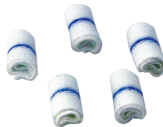
Secto ® Kittner Dissectors 81-1001