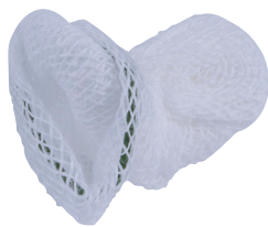
Secto ® Triangle Dissectors 81-1006