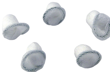
Secto ® Peanut Dissectors 81-1000