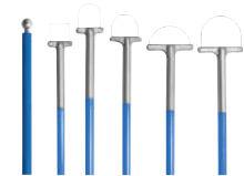
Disposable LLETZ/LEEP Loop and Ball Electrodes †