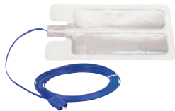
ESREC - Split Disposable Return Electrode with cord †