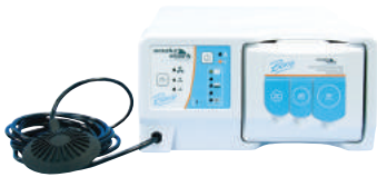
SE02 Smoke Evacuator †