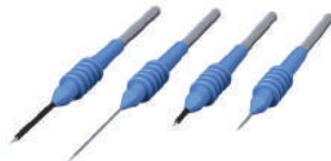
Disposable SuperCut™ Needles Electrodes †