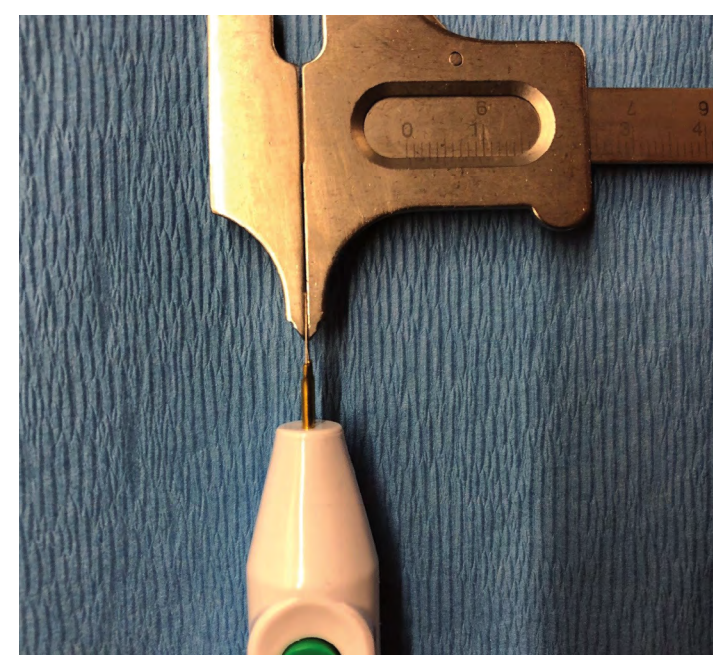
Figure 4: Ultra-thin cautery wire tip (~.07 mm)

There have been incorrect reference to "electrocautery burns" when the case in point was actually utilizing an electrosurgery unit requiring a grounding pad.