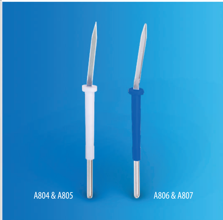
A804 &amp; A805