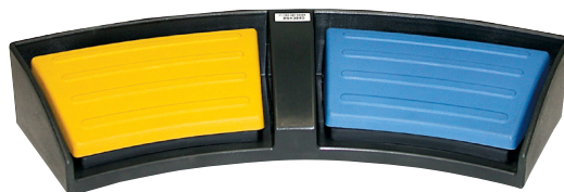
Monopolar Footswitch (BV-1253B)