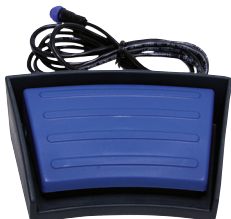
Bipolar Footswitch (BV-1254B)