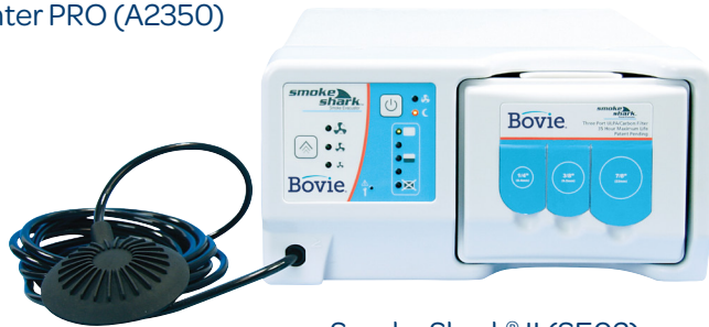
Smoke Shark® II (SE02)