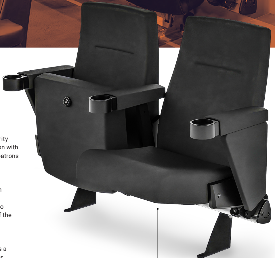
CLARITY SPORT SERIES

Designed with venue operators in mind, Clarity Sport features a low-maintenance build and a comprehensive range of finishes, ensuring easy upkeep and a long-lasting investment for any venue.