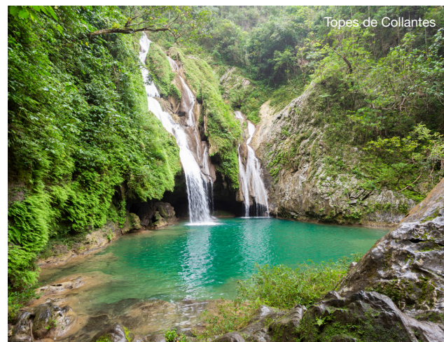
Topes de Collantes