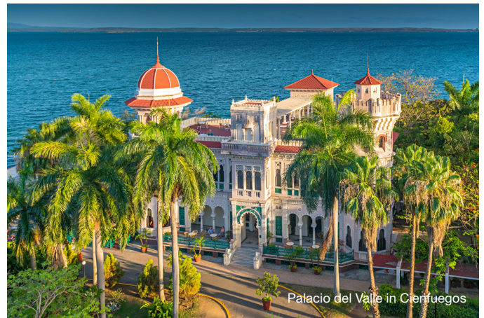
Palacio del Valle in Cienfuegos