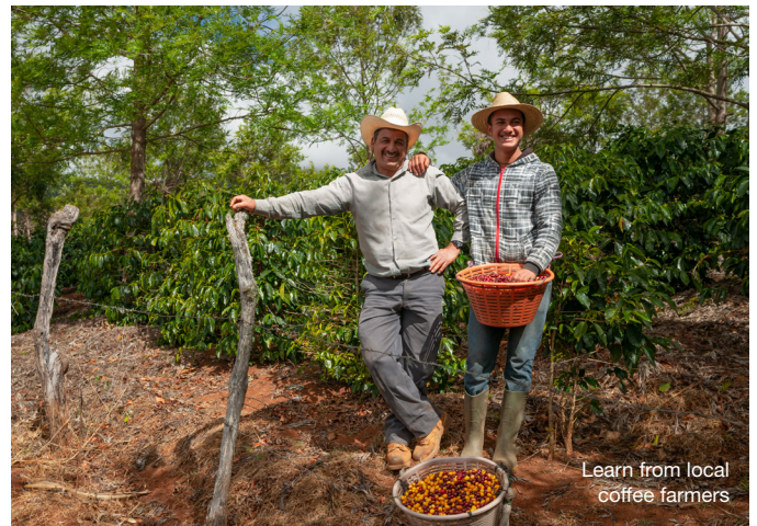
Learn from local coffee farmers