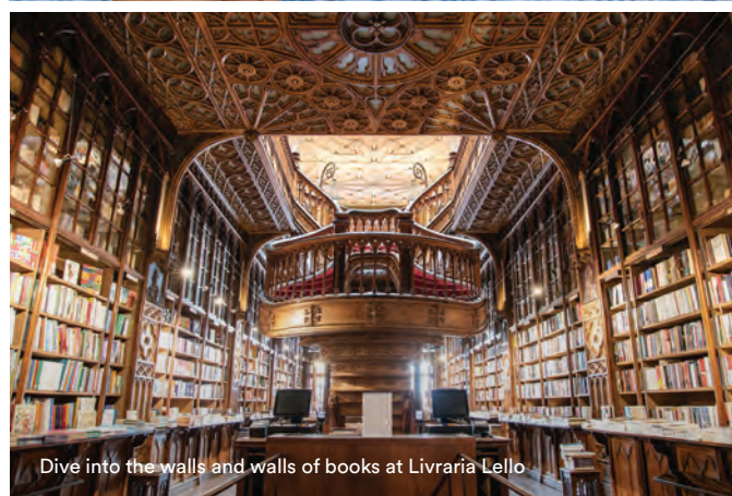
Dive into the walls and walls of books at Livraria Lello