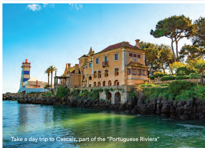
Take a day trip to Cascais, part of the “Portuguese Riviera”