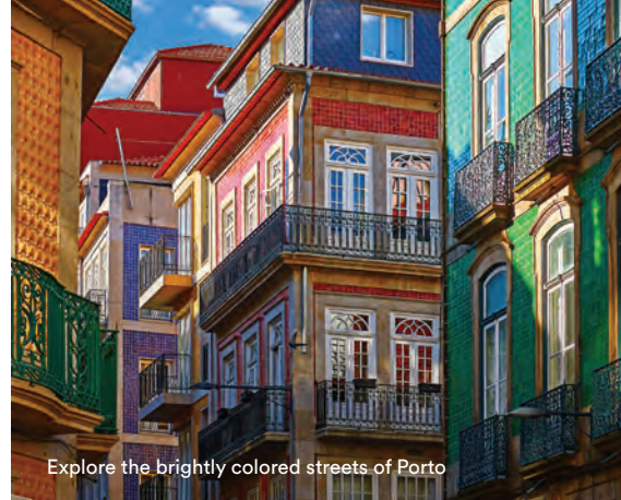
Explore the brightly colored streets of Porto

"I will confidently book with EF knowing that they truly have the infrastructure to handle a crisis, that they care deeply for the students, and that they remain committed to sharing the wonder of travel."