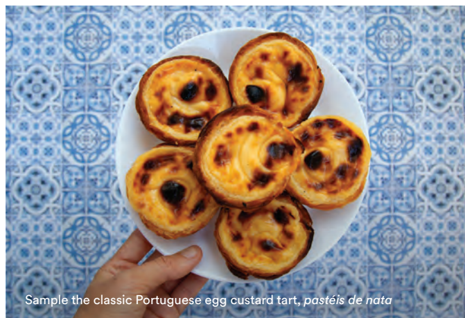
Sample the classic Portuguese egg custard tart, pastéis de nata