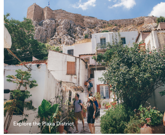
Explore the Plaka District

“I will confidently book with EF knowing that they truly have the infrastructure to handle a crisis, that they care deeply for the students, and that they remain committed to sharing the wonder of travel.”