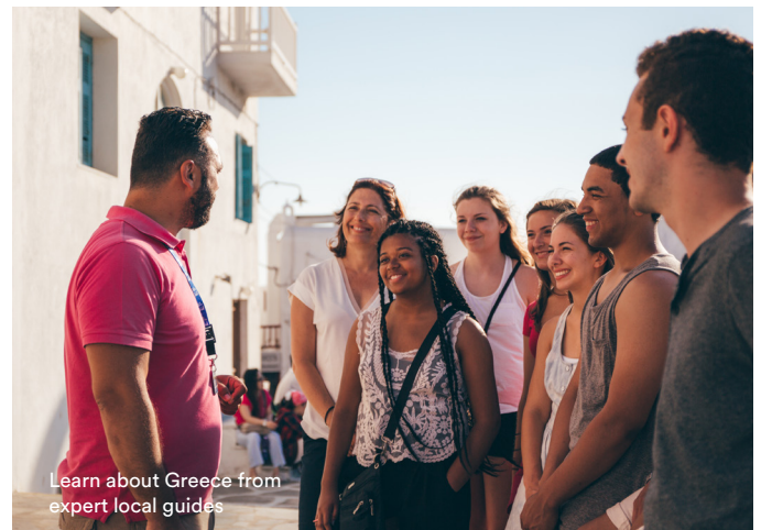
Learn about Greece from expert local guides