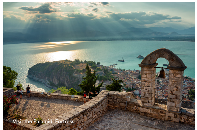
Visit the Palamidi Fortress