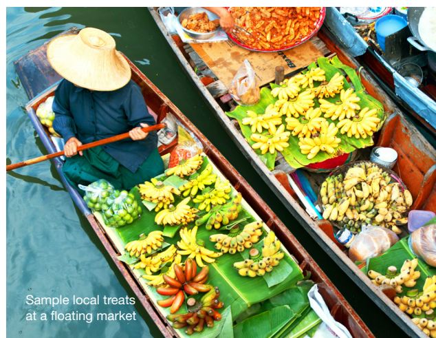
Sample local treats at a floating market