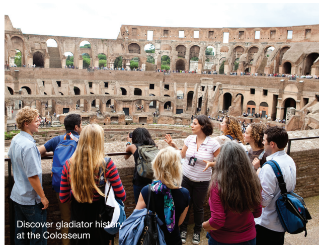
Discover gladiator history at the Colosseum