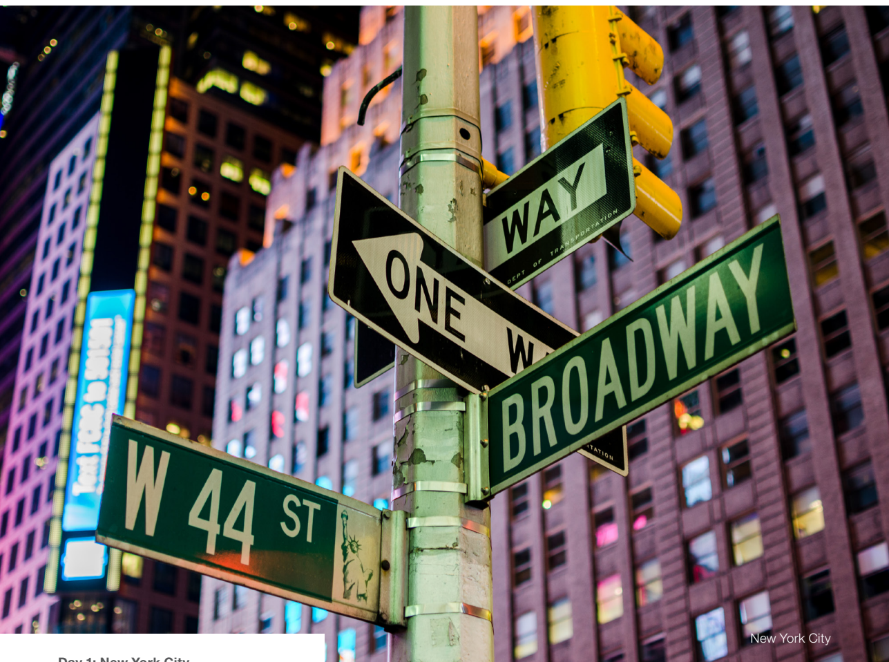
New York City