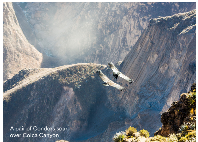
A pair of Condors soar over Colca Canyon