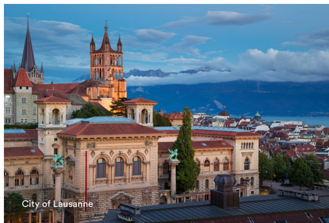
City of Lausanne