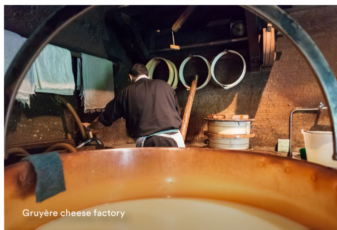
Gruyère cheese factory