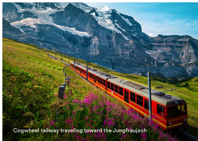
Cogwheel railway traveling toward the Jungfrauoch