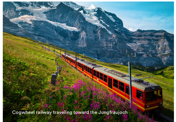
Cogwheel railway traveling toward the Jungfrauoch