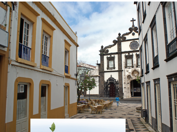
< Start your adventure off on the charming streets of Ponta Delgada