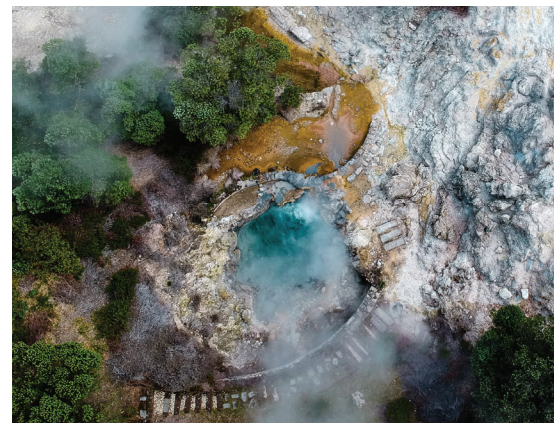
> Get an incredible view of the bubbling caldeiras and fumaroles in the volcanic hotspot of Furnas