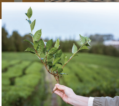
^ Watch the whole tea production process, from picking to packaging, at an organic tea plantation