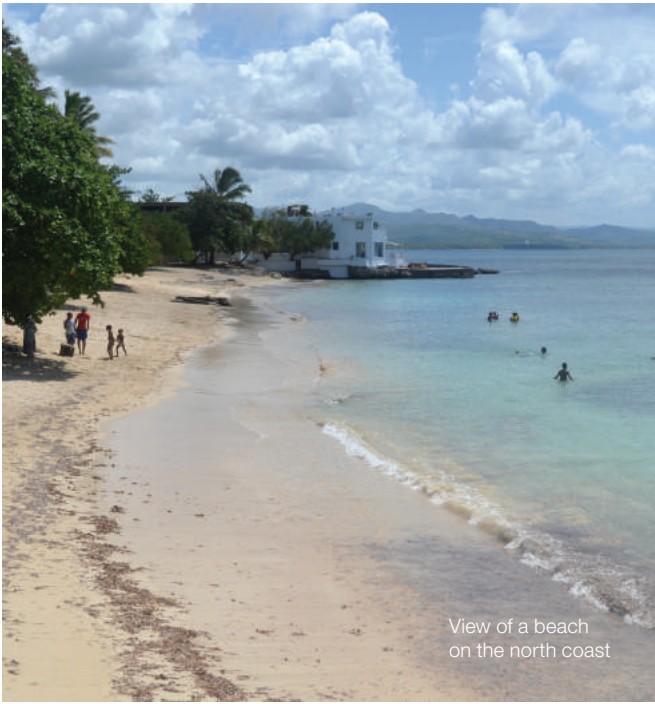
View of a beach on the north coast