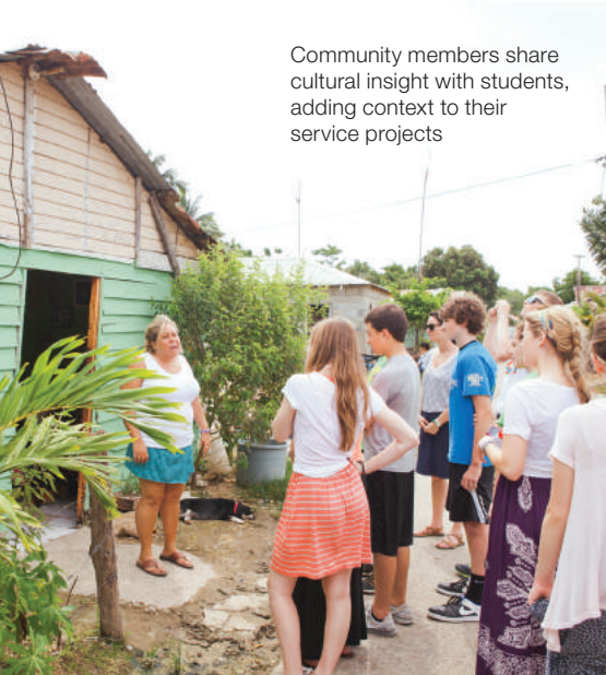
Community members share cultural insight with students, adding context to their service projects