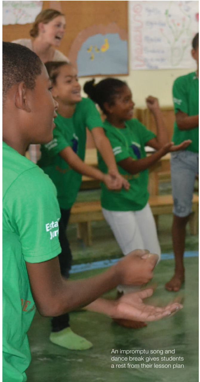
An impromptu song and dance break gives students a rest from their lesson plan