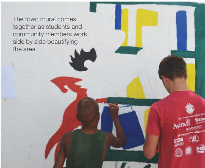
The town mural comes together as students and community members work side by side beautifying the area