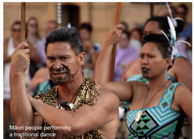
Māori people performing a traditional dance