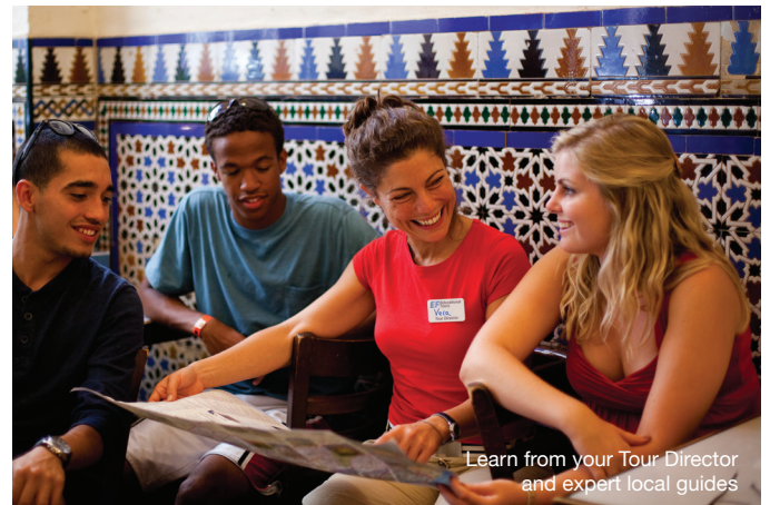
Learn from your Tour Director and expert local guides