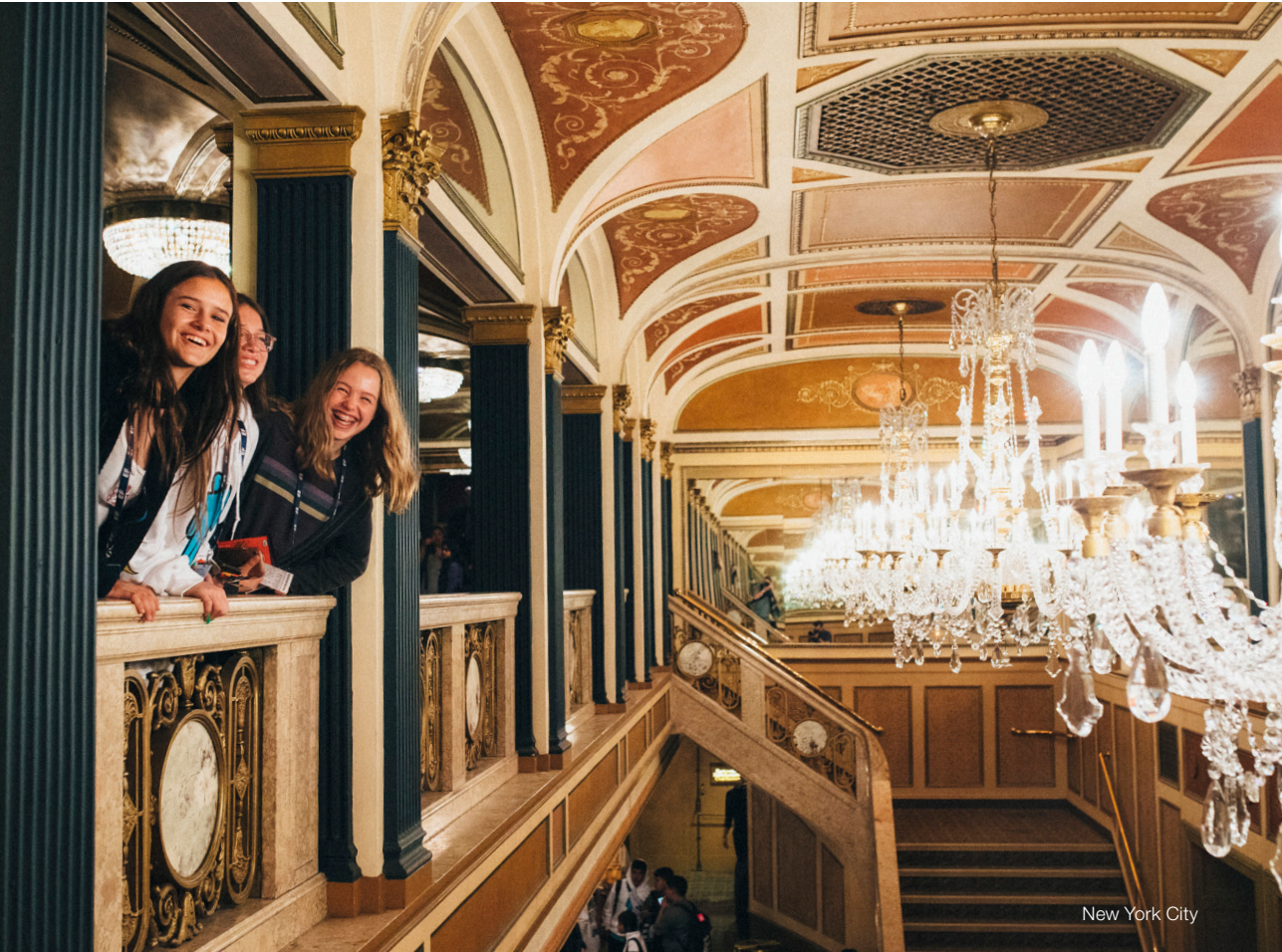
New York City