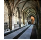
Pure beauty. Gothic cathedral in #barcelona #ef #eftours