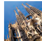
La Sagrada Família. #barcelona #eftours