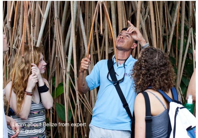
Learn about Belize from expert local guides