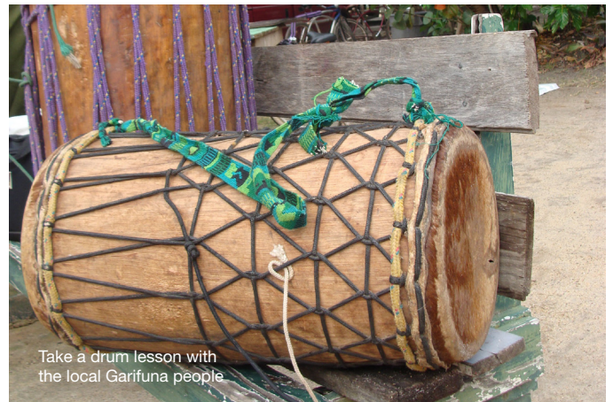
Take a drum lesson with the local Garifuna people