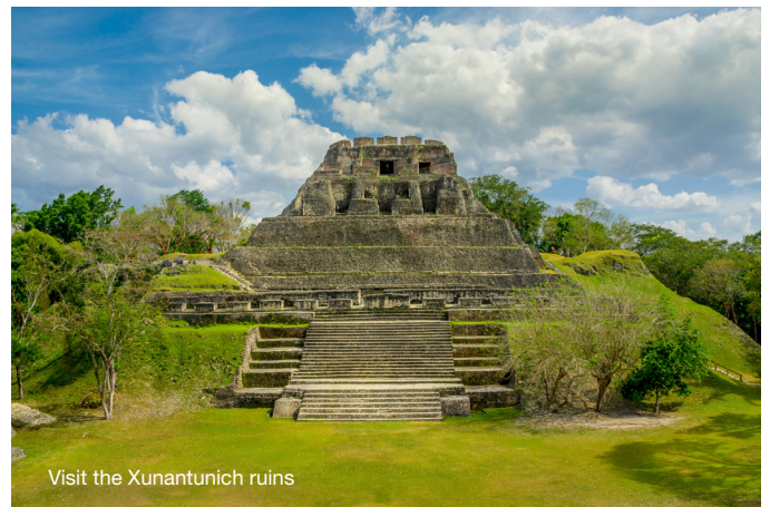
Visit the Xunantunich ruins