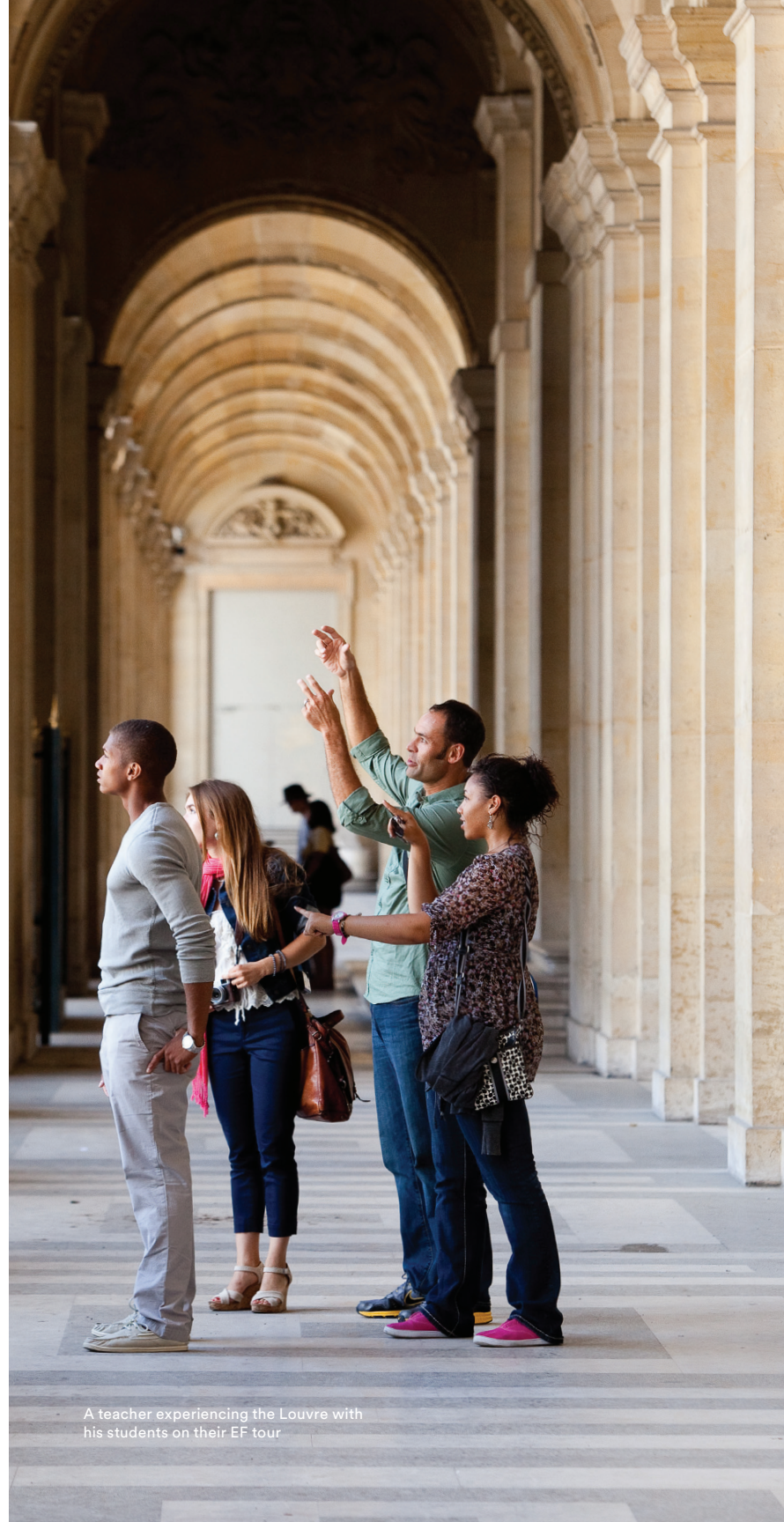
A teacher experiencing the Louvre with his students on their EF tour

Hear from educators who have been on training tours at eftours.com/training