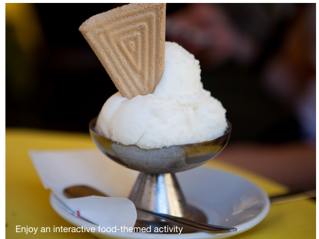
Enjoy an interactive food-themed activity