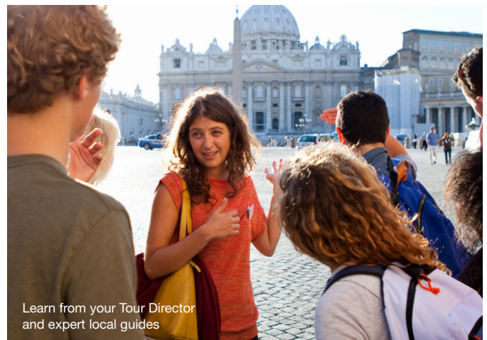
Learn from your Tour Director and expert local guides