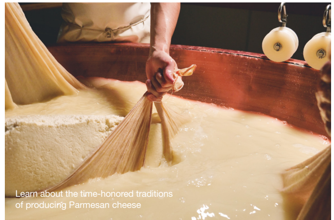
Learn about the time-honored traditions of producing Parmesan cheese