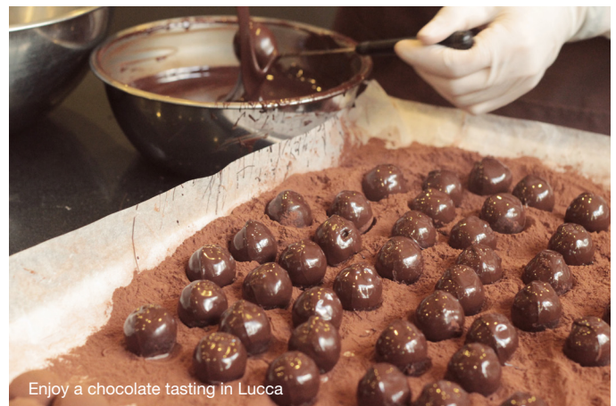
Enjoy a chocolate tasting in Lucca