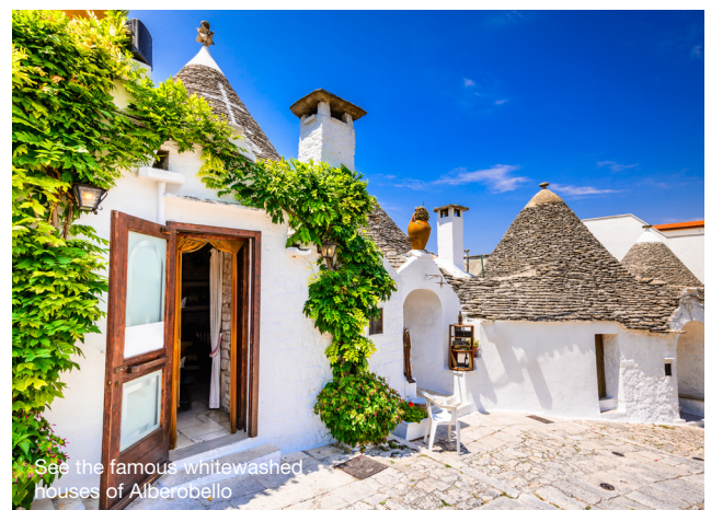
See the famous whitewashed houses of Alberobello