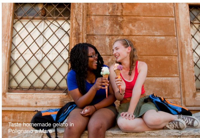
Taste homemade gelato in Polignano a Mare