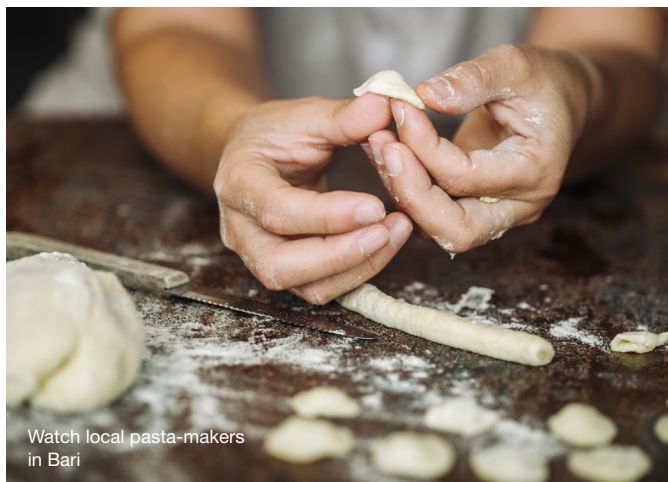
Watch local pasta-makers in Bari