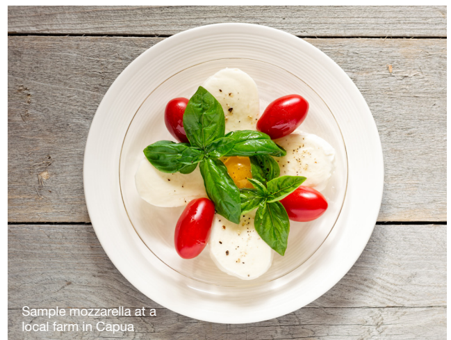
Sample mozzarella at a local farm in Capua

All of the details are covered: Round-trip flights on major carriers; comfortable motorcoach; 8 overnight stays in hotels with private bathrooms; European breakfast and dinner daily