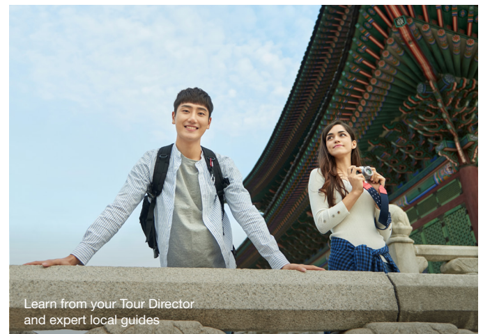
Learn from your Tour Director and expert local guides