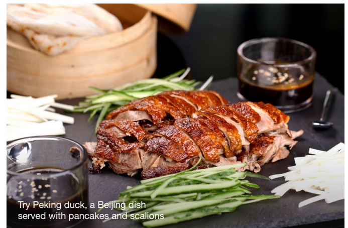
Try Peking duck, a Beijing dish served with pancakes and scallions