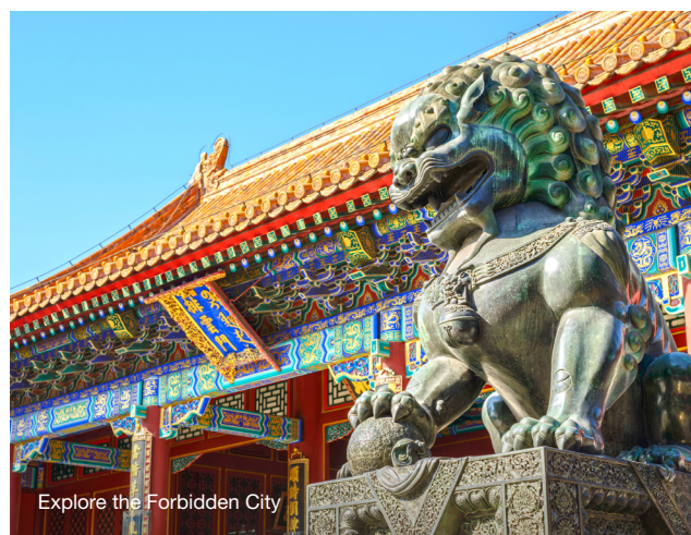
Explore the Forbidden City