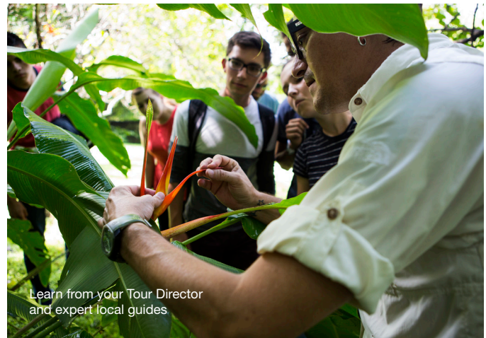
Learn from your Tour Director and expert local guides