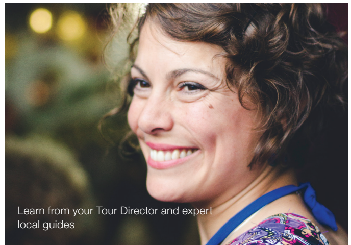
Learn from your Tour Director and expert local guides