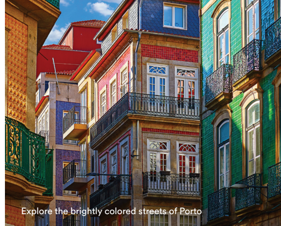
Explore the brightly colored streets of Porto

“I will confidently book with EF knowing that they truly have the infrastructure to handle a crisis, that they care deeply for the students, and that they remain committed to sharing the wonder of travel.”