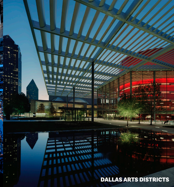
DALLAS ARTS DISTRICTS