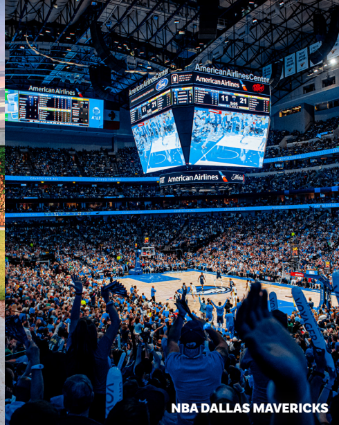
NBA DALLAS MAVERICKS