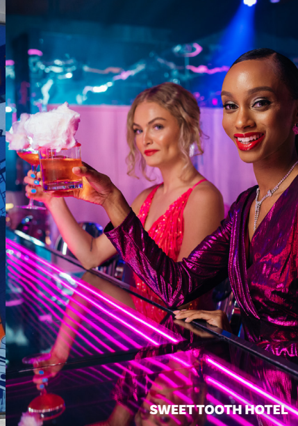
SWEET TOOTH HOTEL