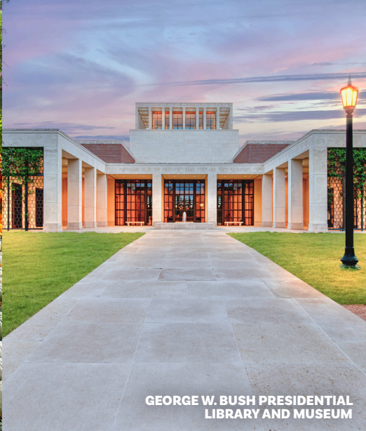
GEORGE W. BUSH PRESIDENTIAL LIBRARY AND MUSEUM