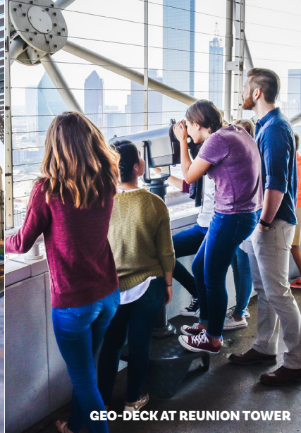
GEO-DECK AT REUNION TOWER