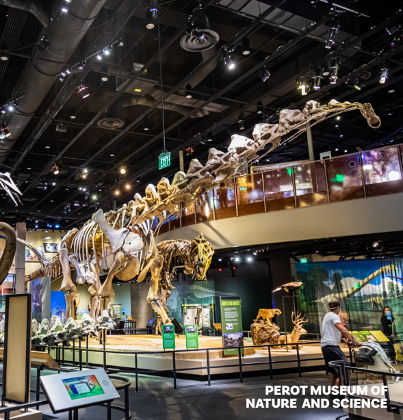
PEROT MUSEUM OF NATURE AND SCIENCE